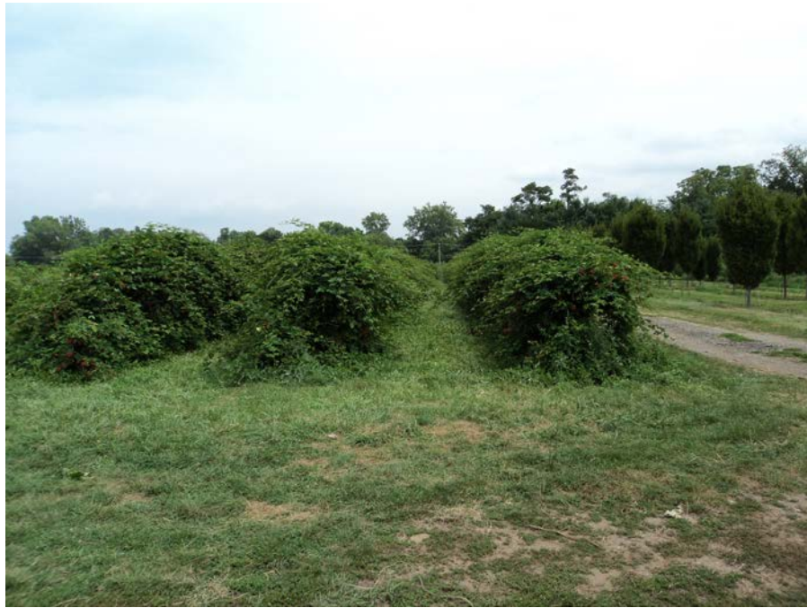
Conventional Hedge Row