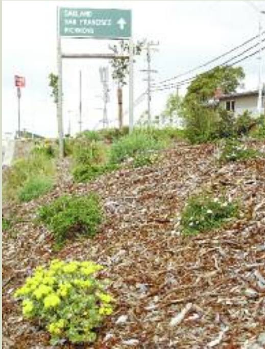
Left: Albany Buchanan Street medians were constructed using sheet mulch and other Bay-Friendly landscaping practices.