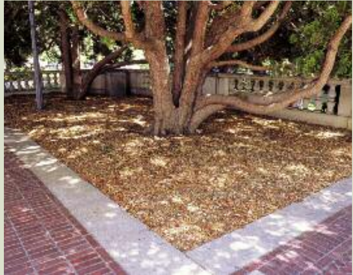
Above: Campanile, UC Berkeley. Trees beneath the Campanile on the UC Berkeley Campus are mulched with mixed plant debris.