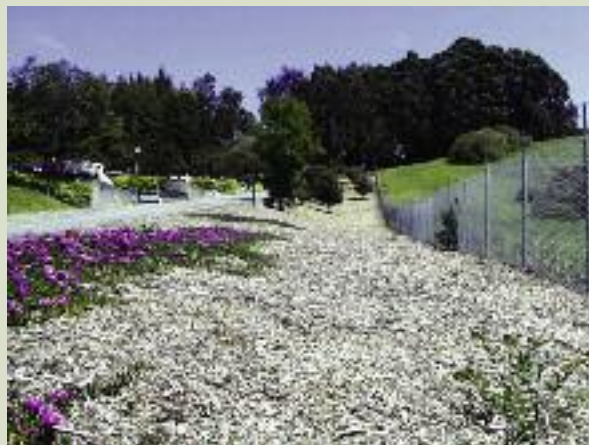
Left: Mulch made on-site from trees infected with Pine Pitch Canker at EBRPD Headquarters, Oakland.