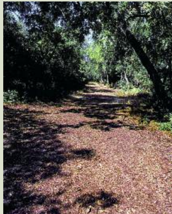
Below: Open space in Fremont is enhanced with mulch made on-site using mixed plant debris.