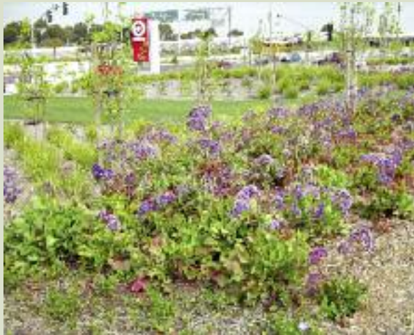
Above: Commercial site in Albany, mulched to control weeds and conserve soil moisture.