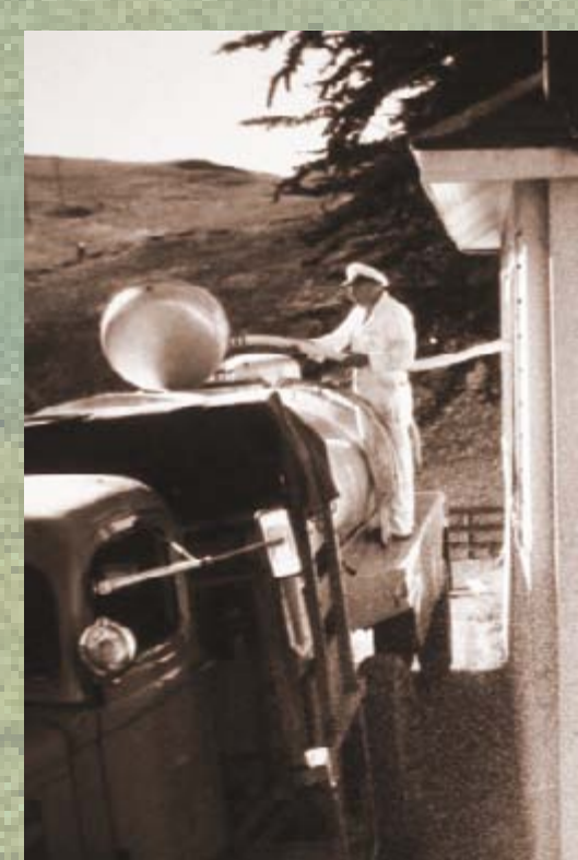
1950: 200 dairies operate in Marin County. Today there are 25 cow, 2 goat, 2 sheep, and one water buffalo dairy in Marin.