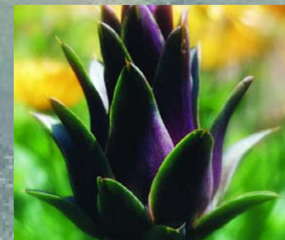
1939: 875 acres of artichokes are dry-farmed on the Point Reyes peninsula.