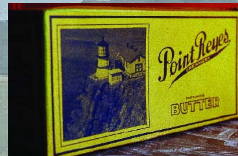
1862: Marin is the largest dairy county in California, providing a quarter of the state's butter.

Courtesy of the Bancroft & Library, University of California, Berkeley.