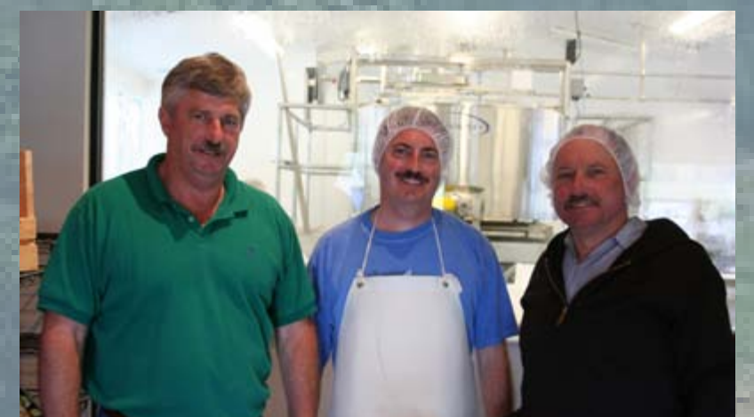
2011: Sonoma Marin Cheese Trail, home to the largest concentration of artisan cheesemakers in California.