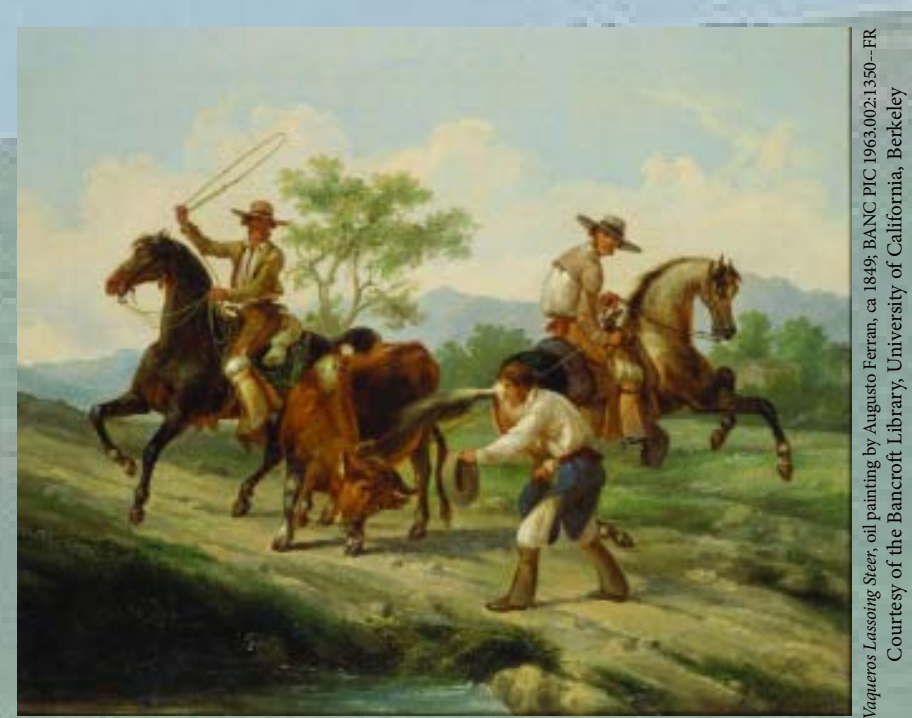
1830 - 1845: Ranchos are granted to Mexican settlers who raise cattle for hides and tallow.

Courtesy of the Bancroft & Library, University of California, Berkeley.