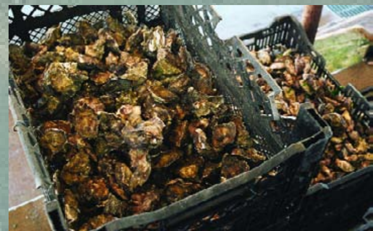
1875: First commercial oyster business operates at Millerton Point on Tomales Bay.