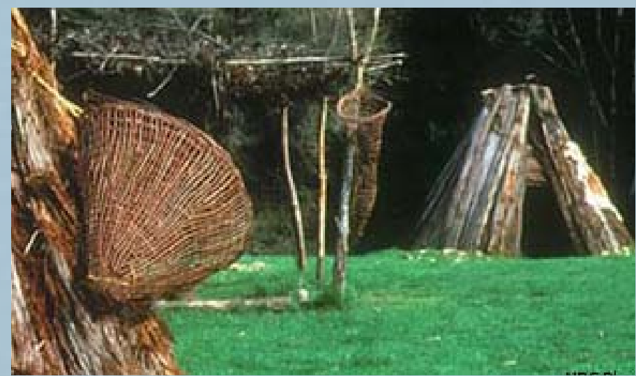
For 5,000 years, Coast Miwok fish, hunt, and gather wild foods before the arrival of Europeans.