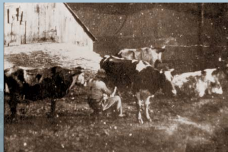
1890: Dairy production becomes the predominant agricultural activity.