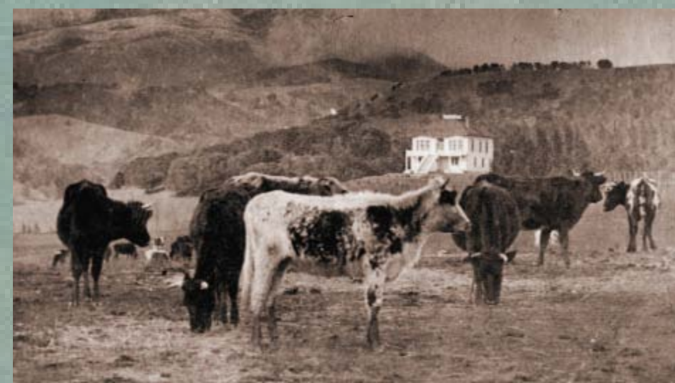
1850: Dairy, beef, and crop farming was undertaken by easterners who came out west with the Gold Rush, and as they moved on, they were replaced by Irish, Swiss, and other immigrants.