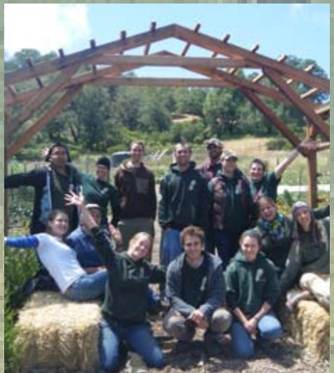
2009: Indian Valley Organic Farm & Garden is launched by Conservation Corps North Bay, College of Marin, and UCCE Marin.