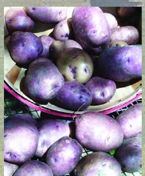
1860: Marin is fourth in the state in potato production (133,500 bushels), mostly from northern Marin.