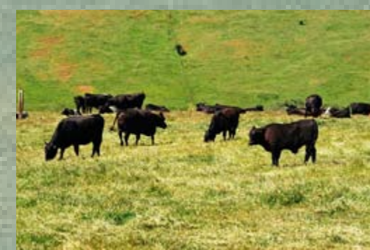
2004: First grass-fed livestock certification in California created by Marin Agricultural Commissioner's office.