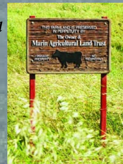
1980: Marin Agricultural Land Trust (MALT) is formed to preserve farmland.