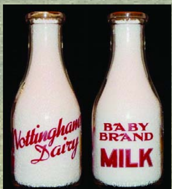
1884: Invention of milk bottle makes handling and distribution of milk easier.