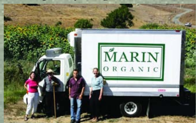
1999: Marin Organic is formed to promote local and organic food production.