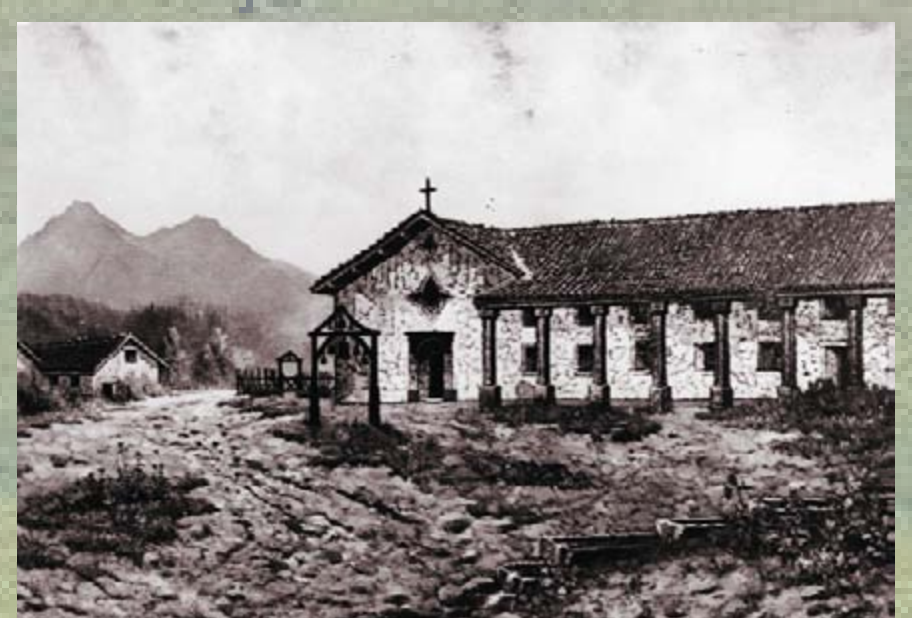
1820 - 1840: Spanish and Mexicans settle in Marin. The San Rafael missionaries operate the first ranching activity in the area.

1820 1830 1840 1849 1850 1856 1860 1862 1870 1875 1881 1884 1890 1920 1921 1938 1939 1950 1962 1972 1980 1983 1994 1995 1999 2000 2001 2004 2005 2009 2011 2012 2013 2015