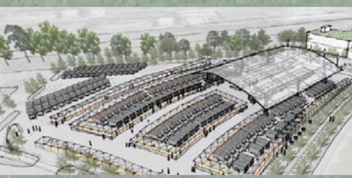
2014 - 2015 the Agricultural Institute of Marin breaks ground on the "Pavilion," a permanent home for the Marin Civic Center Farmers Market.