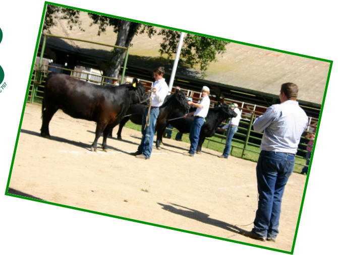
Exhibit Day is a learning event for novice and experienced Exhibitors, it is a chance to meet and share ideas with other 4-H members.

Large Livestock-Small Animal Breeding, Market and Showmanship Events Still Exhibit Judging for all 4-H projects