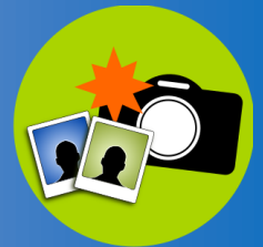
Photo Booth Available

Parents please pick up your child by 10 pm