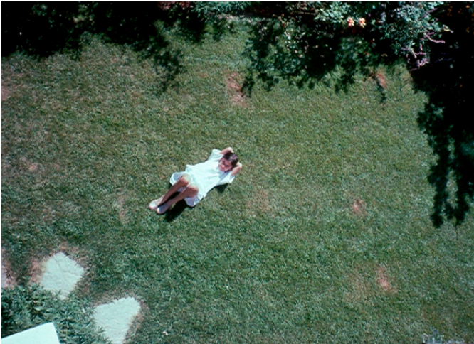
Figure 3. It takes only a few “doggie spots” to significantly reduce the quality and uniformity of a lawn.