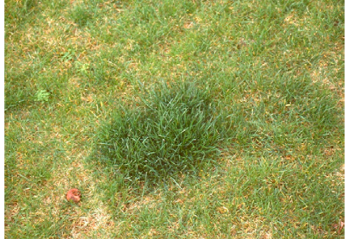
Figure 4. Where dog urine does not kill grass, its nitrogen causes plants to grow faster and darker than surrounding turf, compromising lawn uniformity.

ditions during or after the “event.” If the burn is severe, however, the spots may need to be reseeded or resodded; otherwise, weeds may eventually replace the lawn grass on these spots.