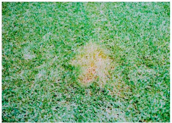
Figure 2. “Doggie spot” (lawn killed by dog urine). Older spots may remain dead, but the turf on the perimeter may turn dark green and grow faster due to nitrogen release.