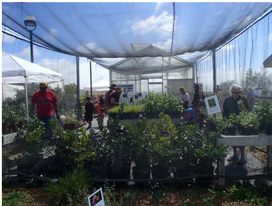
Native Plant Sale

The Watsonville Wetlands Watch presents the 4th Annual Habitat Festival and Native Plant Sale , which will be a fun-filled day for the entire family. With a focus on Green Gardening this year, we will feature presentations and workshops given by experts, a fun Kids Zone, live animals, nature walks, music, food, storytelling, face painting, and much more. We'll have over 1000 plants of 45 different native plant species all grown here at the Wetlands Educational Resource Center nursery by staff, volunteers, and students. Plus, our staff will be on hand to offer great advice and plant selection tips.