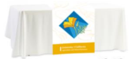
30" x 72"