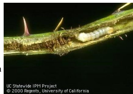
Raspberry horntail sawfly larva and frass.

Beginning in April, female horntails insert their eggs just under the epidermis, about 2 inches below the tips of the canes, causing pronounced swelling inside new shoots. The eggs hatch into very small larvae a few days after being laid. The young larvae spirally girdle the tips of the canes and cause wilting. The cane becomes weak in the area of the crook and often breaks at this point during pruning and training. The larvae later feed throughout the terminal portion of the cane, which often causes dieback. Cutting open the affected portion of the cane may reveal the thick white worm or the tunnel containing brownish granular material.