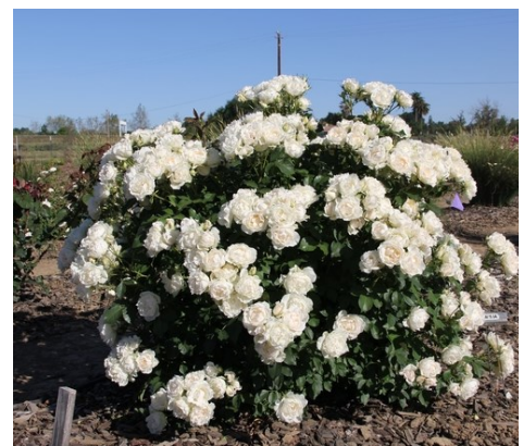
'Icecap' rose from the Meiland breeding program

We look forward to finding more great landscape roses for sustainable California gardens.