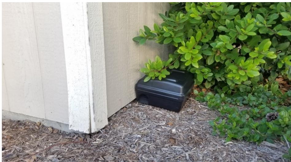
Fig 1. Rodenticide bait station placed along exterior wall. These stations can also house snap traps instead of a rodenticide.

ing (the animal's health may be affected but they do not die) in this way, but the effects on many animal species to this type of exposure is not well understood.