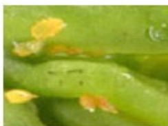
ASIAN CITRUS PSYLLID EGGS