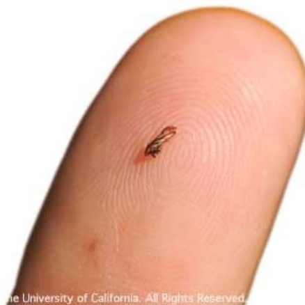
Adult Asian citrus psyllid on a finger. Elizabeth Grafton-Cardwell

In response to the ACP invasion in California, the California Department of Food and Agriculture (CDFA) has launched an extensive monitoring program to track the distribution of the insect and disease. They check yellow sticky traps in both residential areas and commercial citrus groves, and also test psyllids and leaf samples for the presence of the pathogen.