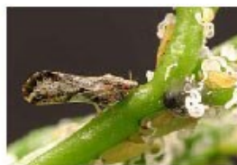
VARIOUS LIFE STAGES