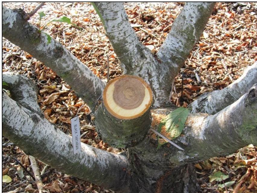
A cross-cut into the infected branch reveals a large fungal canker in the wood; the infections continues into the trunk.

If growth is very vigorous, the first summer pruning can be done in late May or June, at which time many strong upright shoots can be removed to allow sunlight to reach lower fruiting branches. Doing the final pruning in July leads to excessive regrowth later that summer. The main or final pruning should be in August, but heavy pruning, especially at that time of year, may lead to sunburned branches, so leave spurs and some other shoots to provide some shade. Alternatively, whitewash west- and south-facing branches with a 50:50 mixture of interior, white latex paint and water to prevent sunburn.