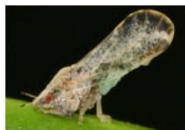
ASIAN CITRUS PSYLLID ADULT