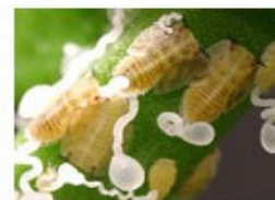
NYMPHS AND WAXY TUBULES WITH HONEYDEW