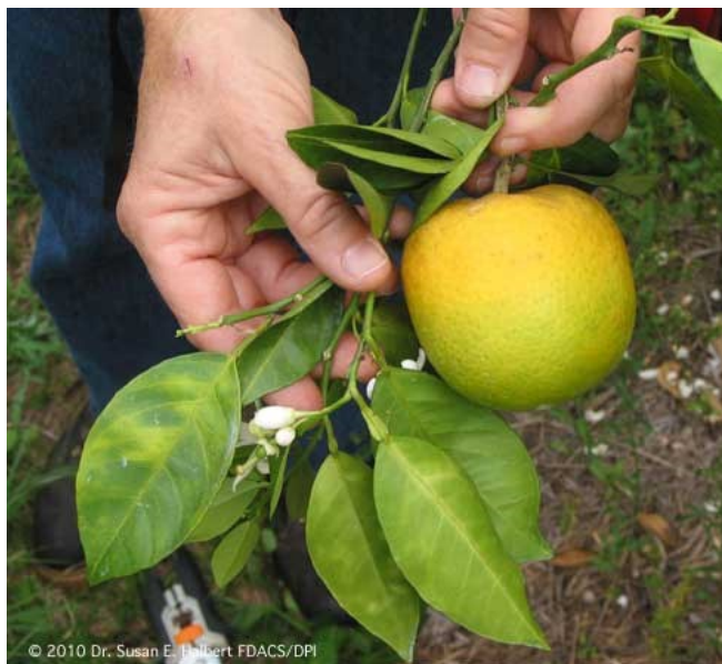
Asymmetrical yellow mottling of leaves and odd shape and greening of fruit, symptoms of Huanglongbing (citrus greening).

Currently growers are using yellow sticky traps to detect the insect and to monitor the population. “Efficient lures,” Leal said, “are sorely needed for sticky traps, particularly for early ACP detection. Although ACP is present in Arizona and California, the disease itself has not been established, Leal said. “The