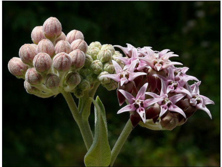
Showy milkweed

If you're lucky enough to have naturally moist garden soil here in droughty California, showy milkweed can be almost invasive, sending out aggressive creeping roots that can easily crowd out other garden plants. The Xerces Society is working to make seeds of both narrow-leaved and showy milkweed more readily available through retail nurseries: more information and a short list of nurseries is available in their California milkweed