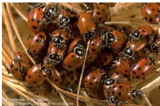
Adult overwintering convergent lady beetles. [J.K.Clark]

Many retail nurseries and garden centers sell lady beetles for controlling aphids in gardens and landscapes. Gardeners often ask, “Does releasing lady beetles really work? UC research has demonstrated that lady beetle releases can effectively control aphids in a limited landscape or garden area if properly handled and applied in sufficient numbers. However, because of inadequate release rates or poor quality, lady beetles often fail to provide satisfactory control; other low toxicity aphid management practices such as hosing off or insecticidal soap or oil sprays may be more effective. Here are some things to consider if you decide to try lady beetle releases: