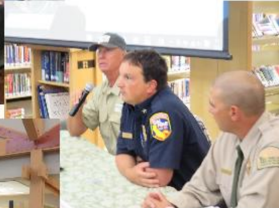
Representatives from UC Riverside, Cal - Fire, the County Parks Department, a biologist from the County Dept. of Agriculture, and an arborist served on the six-person panel.