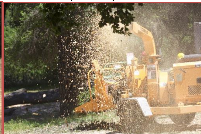
Some infested wood has been buried, or ... other infested wood (bark) is being chipped