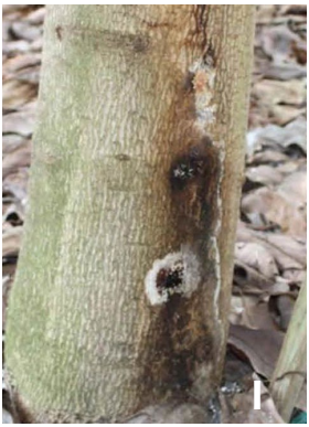
Avocado trunk canker, Phytophthora menzei Fig. I, J