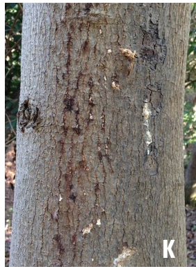
Black streak disease Botryosphaeria spp. Fig. K, L