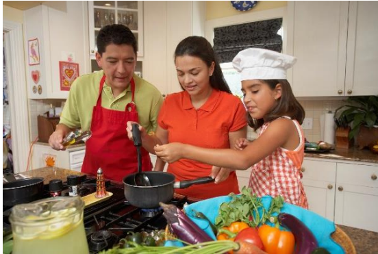
Diet quality & physical activity