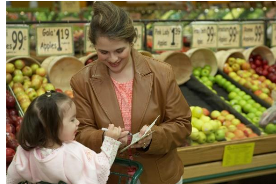
Food resource management