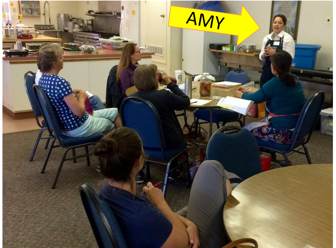
Explaining the capstone project