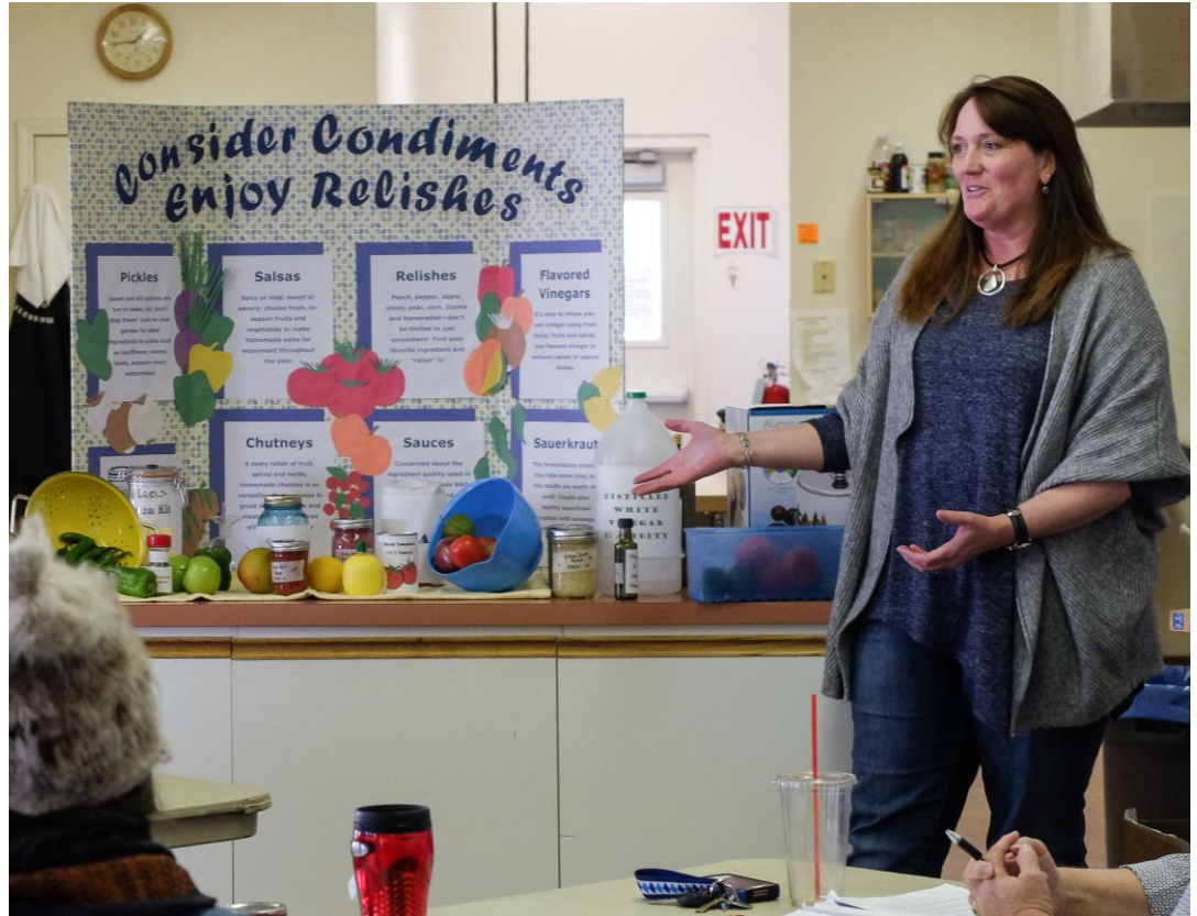
Poster board presentation, 2016 Class