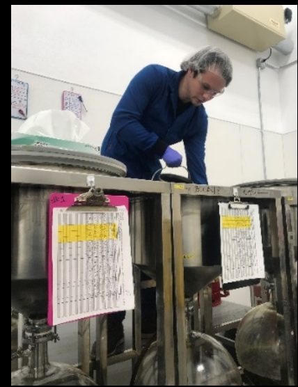
Filtering out the plant waxes.