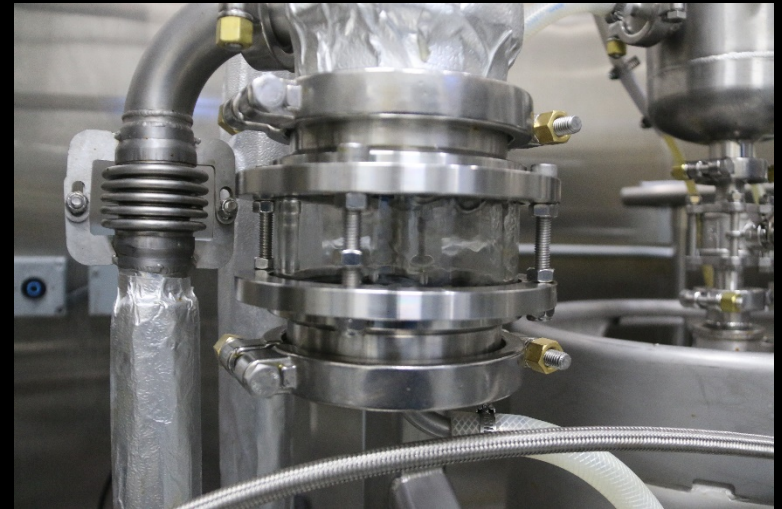
Falling Film Evaporator