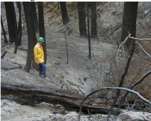
Gondola Wildfire burn site near Stateline, NV.

A healthy Sierran forest also is generally more conducive to supporting wildlife, including sensitive birds and salmonids. We thus need to evaluate the benefits and costs