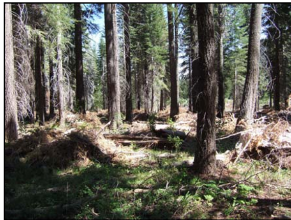
Material cut and piled by hand in Blackwood Canyon.