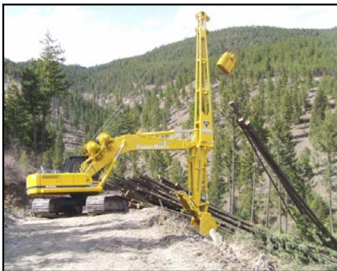
Top Left: skyline yarder on an excavator base. Bottom Right: Skyline yarding whole trees.

4.3.7 An appropriate access network is critical. Roads are expensive to build, more expensive to remove, and generally create more environmental impact than all the harvesting carried out from the road, assuming the harvesting is planned and conducted carefully. It is therefore important to utilize the existing road and trail network as much as possible. For example, use of an existing road in the drier portion of a SEZ would almost certainly be preferable to locating a new road just outside the SEZ. Most of damage associated with a properly maintained existing road has already taken place. However, Dave Fournier's (USFS LTMBU; personal communication) analysis indicates that only a small percentage of National Forest land in the Basin is currently accessible by road.