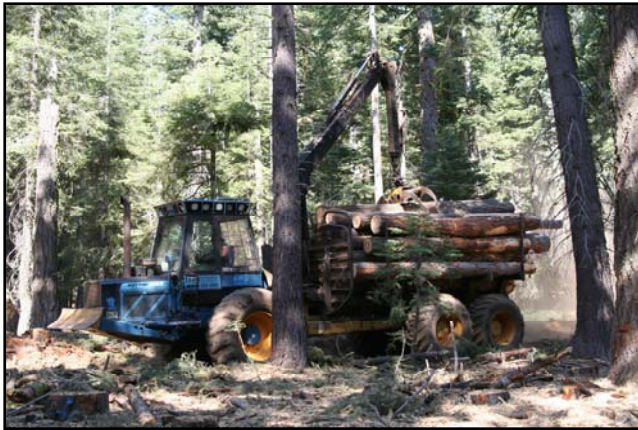
A forwarder transporting cut-to-length logs in the Lake Tahoe Basin. The same or a similar vehicle can transport whole trees or sections of trees with limbs and tops attached.

monitoring of anticipated worst-case situations would allow operations to be halted as soon as signs of unacceptable impact become apparent, rather than waiting for delayed results from expensive, labor- and lab-intensive tests. We focus on soil compaction as an example. A traditional protocol might call for core samples to be taken from a random or regular grid of many points distributed across a treatment unit: expensive, labor-intensive, not focused on the anticipated worst cases, and with substantial delay between the beginning of any