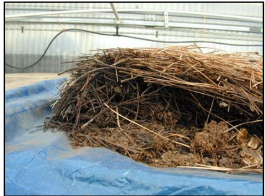
O horizon litter layer removed from forested site near Stateline, NV.

4.1.5 Some of the current regulations with respect to water quality protection are narrowly focused and do not consider the wider contextual history that has resulted in the current conditions, the concept of achievable desired conditions, or the consequences of taking no action. For example, fire suppression has caused a decline in forest health that includes the emergence of dense and unhealthy mono-culture stands characterized by reduced growth, increased disease and insect infestation, and the surface accumulation of heavy organic debris and decomposing organic (O horizon) materials (Ansley and Battles, 1998; Johnson et al., 2005; Miller et al., 2006; Neary et al., 1999; Stephens and Moghaddas, 2005; Stohlgren, 1998), making these systems extremely prone to wildfire. Fuel reduction strategies not only make it easier to fight fires and protect lives and property, but it can also improve the health of the forest, making it less susceptible to severe wildfire, insect and disease attack, and more capable of producing the large widely spaced healthy trees more typical of a pre-European forest.