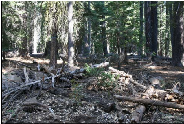
An untreated stand near Tahoe City.

4.4.2 In concert with the above paradigm shift, is the need for innovative experimentation and real time monitoring feedback. The significance of an impact must be assessed from both a statistical and ecological perspective. Although statistical evaluation is fairly routine today, sound ecological assessment remains elusive. A key component of ecological assessment is identification of known indicators of ecosystem status, response, and recovery. The search for and measurement of ecosystem indicators is a dynamic process because relevancy is not necessarily static. This dictates the need for real time monitoring feedback so that the implementation of management strategies can be truly adaptive. For example, prior to the Angora wildfire, overstocking and high surface fuel loads of adjacent steep slopes was considered a key ecosystem indicator relevant to both forest health and the spread of fire within the Basin. That relevancy did