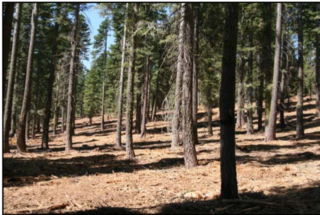
A stand near Tahoe City after mechanized treatment at a cost of approximately $2500 per acre.

4.3.6 The cost information presented by Steve Rheinberger (USFS; personal communication) as typical for various fuel reduction treatments were on the order of half or less of those experienced for similar recent operations in the Basin. Several factors contribute to high Basin costs. Operations require more time and effort to plan, permit and approve. Small treatment units cost more per acre because mobilization and de-mobilization costs must be spread over less area. Tahoe's unique considerations for water quality and working in people's back yards require measures beyond those used elsewhere. For example, cut-to-length (CTL) operations that have been prescribed for the Basin are more expensive than whole-tree methods commonly used elsewhere. In addition, the Basin's brand of CTL treatment is costlier than that