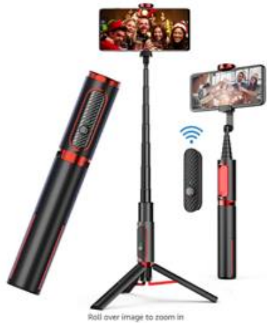
Selfie Stick Tripod Bluetooth Selfie Stick - Wireless Selfie Stick Tripod for Apple & Android Devices