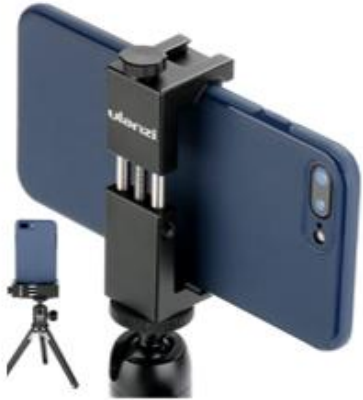
Phone Tripod Mount