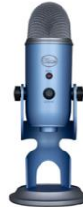
Yeti USB microphone (for laptop or tablet with USB plug)

Multiple pickup patterns let you use this single microphone for recordings which would normally require multiple units. Integrated studio controls for volume, gain and pattern selection offer finely detailed control over the recording process with this Yeti USB microphone