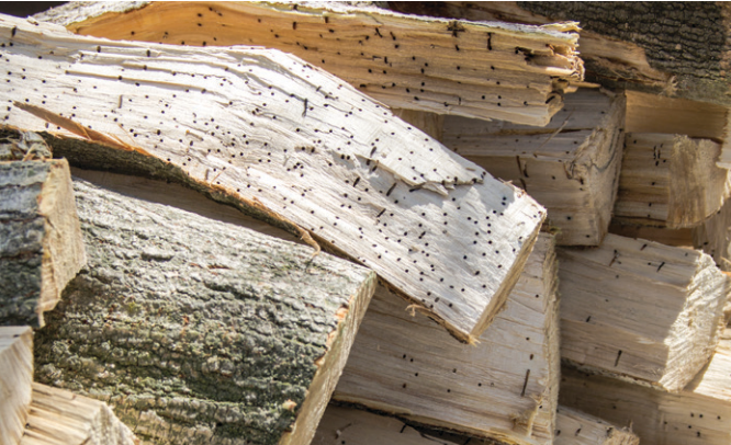
Box elder logs full of ISHB tunnels and beetles.