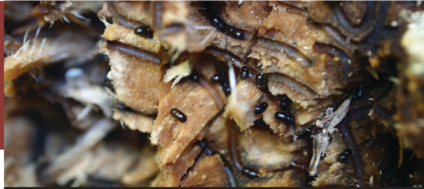
ISHB tunnels in castor bean wood.

The invasive shothole borers (ISHB) are beetles that tunnel into trees and introduce a fungus that they use as their food source. The fungus causes a disease called Fusarium dieback that disrupts the flow of water and nutrients in trees. ISHB was first discovered in Los Angeles in 2012 and has now spread to Orange, San Diego, Riverside, San Bernardino, Ventura, Santa Barbara, and San Luis Obispo Counties.