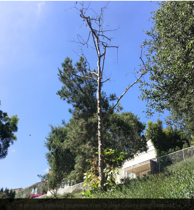
A severely infested sycamore in an Orange County neighborhood.

In severely infested trees, the beetles and associated fungal disease can cause tree decline, branch dieback, and tree death. Trees with heavily infested branches can be especially hazardous, since the combined damage of the fungal disease and the beetle's tunneling activity weakens the wood, causing limbs to break and fall.