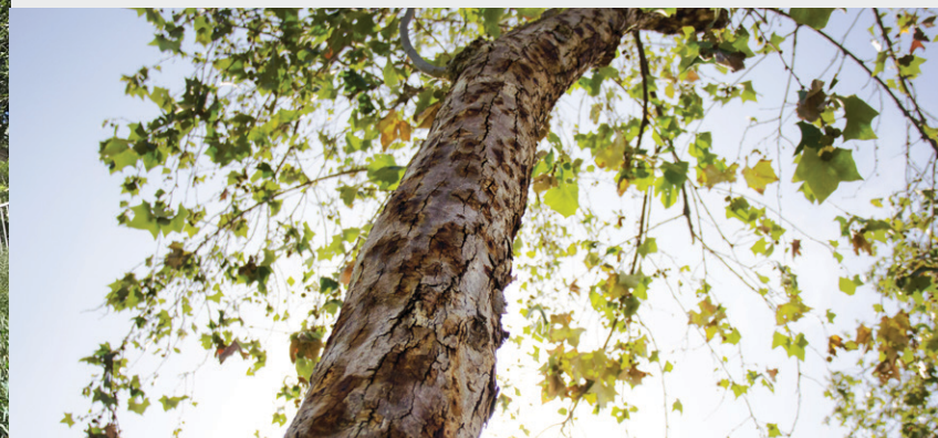
ISHB attacks on Mexican sycamore.