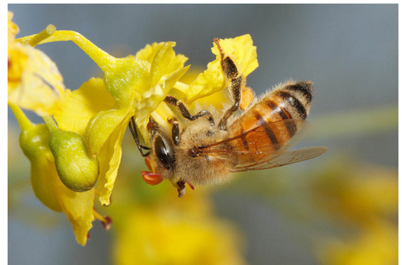
Figure 2. Honey bee ( Apis mellifera ), visiting Parkinsonia sp.

Bees are the most important biotic agent for the pollination of agricultural crops, horticultural plants, and wildflowers (Frankie and Thorp 2002; NAS 2007). People are often most familiar with the introduced European honey bee ( Apis mellifera ), which was brought to the eastern United States 400 years ago; it arrived in California around 1850. The honey bee is just one species of bee in this incredibly diverse group of pollinators. Approximately 4,000 species of bees exist in the United States, with 1,600 of those residing in California (figs. 1 and 2). About 20,000 species have been recorded worldwide (DiscoverLife.org). Native bee species come in a variety of shapes, colors, sizes, and lifestyles that enable them to pollinate a diversity of plant species (see also Griffin 1997).