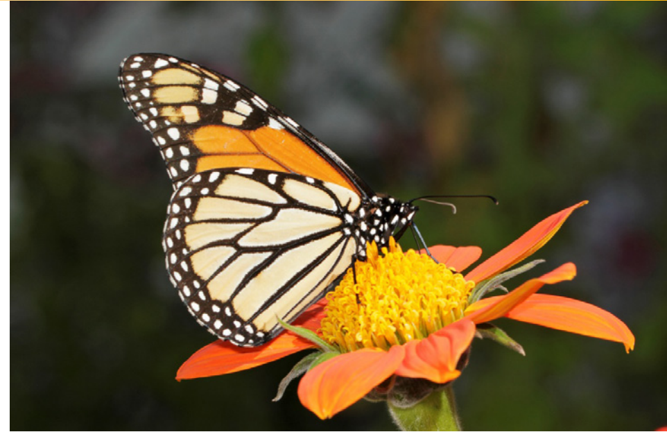
Figure 4. Monarch butterfly ( Danaus plexippus ) visiting a Tithonia rotundifolia flower.

These gorgeous, often colorful, daytime-flying insects have long been purposely lured to flowers by gardeners. Butterfly larvae, or caterpillars, require specific plants to feed on, though the adults can use nectar from many plants. While adult butterflies are not as efficient pollinators as are bees, they do transfer pollen that sticks to their legs as they flit from flower to flower. Their stunning looks have made them attractions at many botanical gardens and zoos, where butterfly houses and gardens stock their favorite flowers for nectar resources (figs. 4 and 5) (Stewart 1997; Xerces and Smithsonian 1998).