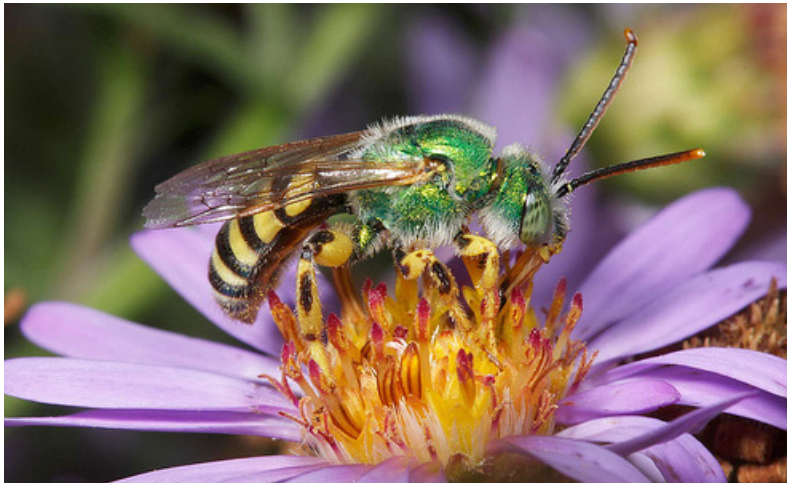
Figure 1. Male of Agapostemon texanus visiting Aster sp.

The relationships that exist between flowering plants and pollinators are not casual, as many plants and pollinators have coevolved over long periods of time to efficiently exchange services. Pollination of flowers by pollinators is the unintended outcome of their activity on the flower. As pollinators visit flowers to sip nectar