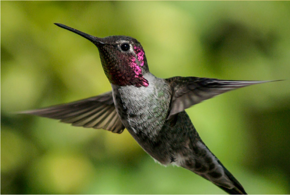
Figure 3. Male Anna hummingbird ( Calypte anna ) hovering and showing its characteristic iridescent rose color on its head and throat.