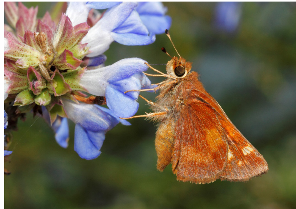
Figure 5. An umber skipper ( Poanes melane ) visiting a Salvia uliginosa flower.