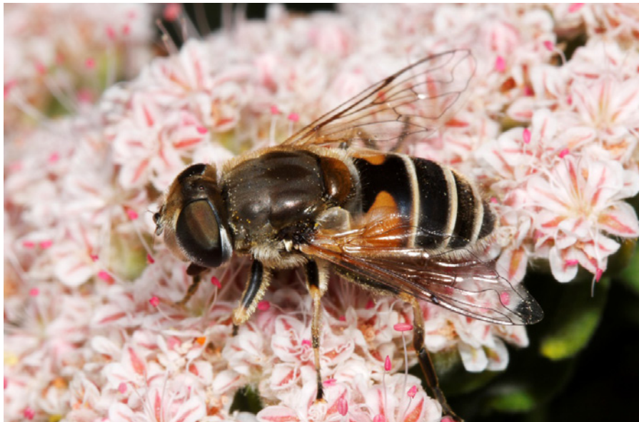
Figure 6. The common hover fly ( Eristalis arbustorum ) visiting Eriogonum .

The importance of conserving a diversity of pollinators has become more apparent as the introduced European honey bee population has declined due to colony collapse disorder (CCD). Unique to honey bee colonies, CCD causes worker bees to suddenly and mysteriously disappear. Single hive losses ranging from 30 to 100 percent have been reported by beekeepers in both North America and Europe (Nordhaus 2011). Honey bees are relatively inexpensive, and the industry standard when experiencing large hive losses is to order additional hives. A growing concern, however, is that if hive losses continue to increase, demand for honey bees will become too great to sustain. What will not decrease is flowering plants' need for successful pollination from their associated pollinator(s). While scientists still do not know the exact cause(s) of CCD, they do know that managed honey bees are subjected to a number of stressors, such as pesticide poisoning, low food-source