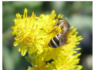
Solidago californica 'Cascade Creek' Cascade Creek goldenrod • Upright spreading perennial • Yellow flowers • Bees, hummingbirds