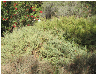
Baccharis pilularis 'Pigeon Point' Pigeon Point coyote bush • Evergreen shrub • Apple-green foliage and creamy flowers • Bees, butterflies