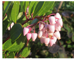
Arctostaphylos densiflora 'Howard McMinn'