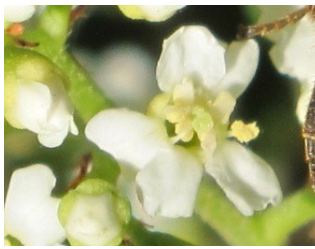
Heteromeles arbutifolia toyon