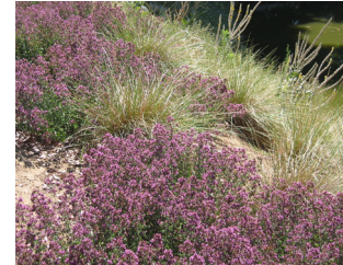
Origanum species and cultivars oregano