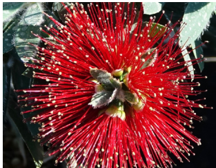
Callistemon species and cultivars bottlebrush • Tough, evergreen trees and shrubs • Attractive "bottle brush" flowers, red or mauve purple • Bees, hummingbirds