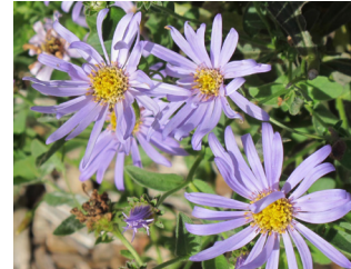
Aster x frikartii 'Mönch' mönch aster