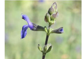
Salvia chamaedryoides germander sage