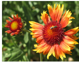
Gaillardia x grandiflora blanket flower