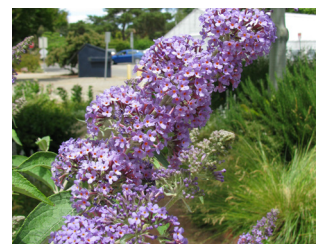
Buddleja dwarf cultivars butterfly bush