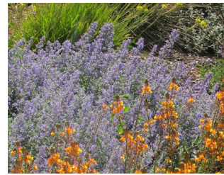
Nepeta x faassenii catmint