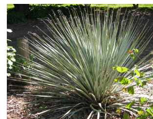
Dasylirion wheeleri desert spoon