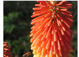
Kniphofia species, hybrids and cultivars poker plant • Semi-deciduous clumping perennial • Bees, hummingbirds