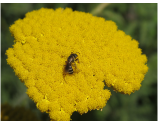
Achillea 'Coronation Gold' yarrow