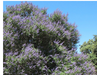
Vitex agnus-castus 'Shoal Creek' Shoal Creek chaste tree • Deciduous large shrub • Blue-violet flower spikes • Bees, butterflies