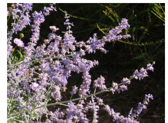
Perovskia atriplicifolia and cultivars Russian sage • Perennial with woody base • Large clusters of delicate blue flowers late summer and fall • Bees