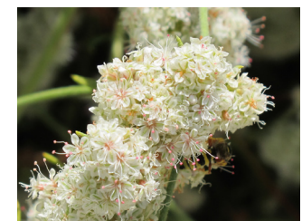
Eriogonum various species buckwheat