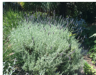
Lavandula x gingsii 'Goodwin Creek Gray', Goodwin Creek lavender • Evergreen small shrubs • Spikes of purple-blue flowers • Bees and butterflies