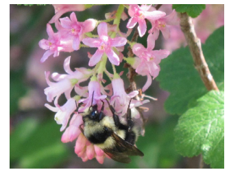
Ribes species and cultivars currant