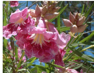
Chilopsis linearis cultivars desert willow • Deciduous tree, multi-trunked • Large fragrant purple or pink flowers • Bees and hummingbirds