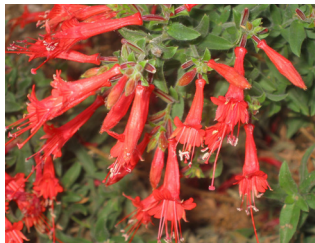
Epilobium californicum cultivars California fuchsia • Deciduous perennial • Red flowers • Bees, hummingbirds