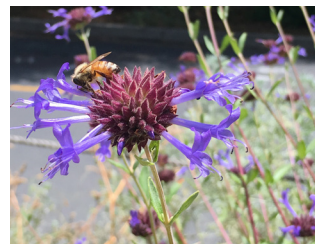
Salvia clevelandii cultivars Cleveland sage • Evergreen shrubs with fragrant foliage • Whorls of blue-lavender flowers on spikes in spring into summer • Bees, butterflies and hummingbirds