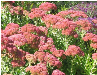
Hylotelephium spectabile 'Autumn Joy' (synonymous with Sedum spectabile 'Autumn Joy') Autumn Joy sedum • Perennial with clumping bright green foliage • Bees, butterflies