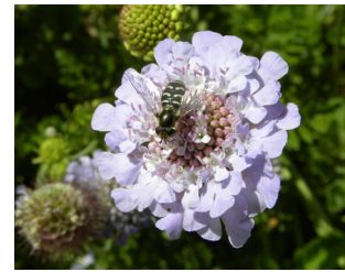
Scabiosa 'Butterfly Blue' butterfly blue pincushion flower