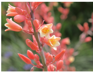
Hesperaloe parvifolia coral yucca • Evergreen upright rosette • Flowers coral pink, long spikes in summer • Hummingbirds