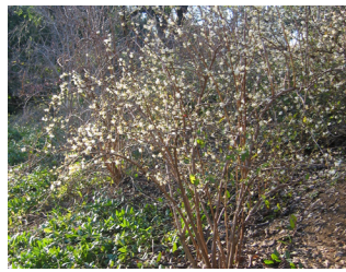
Lonicera standishii winter honeysuckle