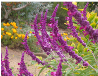
Salvia leucantha Mexican bush sage • Large perennial with woody base • Purple or purple and white flowers in fall • Hummingbirds