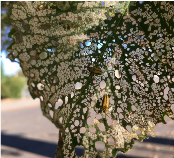
Elm leaf beetles and damage to leaves caused by adults feeding (shot holes) and the larva feeding (skeletonization).

The Beetles are back! No not John, Paul, George and Ringo but the Elm Leaf Beetles. They have been very active in Willows. There is a row of Elm trees in Memorial Park that are being defoliated. In most summers the tree will put out another growth of leaves. This repeated defoliation does weaken the trees.