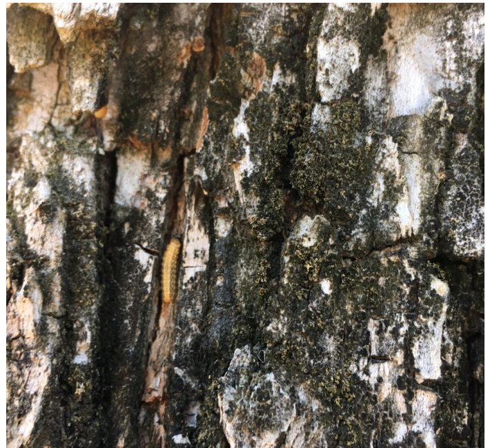
Beetle larva crawling up the tree to feed on leaves.

We have the most questions in the plant clinic about landscape trees. Most of the problems people have with their trees are due to selecting a tree not suited to the place it is planted and improper watering. The CA Center for Urban Horticulture (CCUH) has developed something call a Tree Ring Irrigation Contraption (TRIC ). It is designed to deep water the roots at the drip line. For more information visit their website https://ccuh.ucdavis.edu/tric