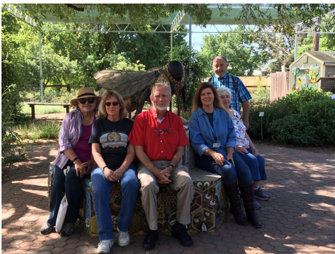
At the Hagen-Das Bee Haven UC Davis on April 24.