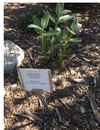
Showy Milkweed at the Haagen-Das Bee Haven