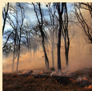
Living with Fire