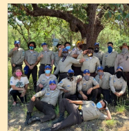
UC California Naturalist Program