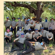
UC California Naturalist Program