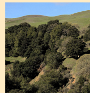
Oaks & Rangelands