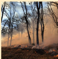
Living with Fire