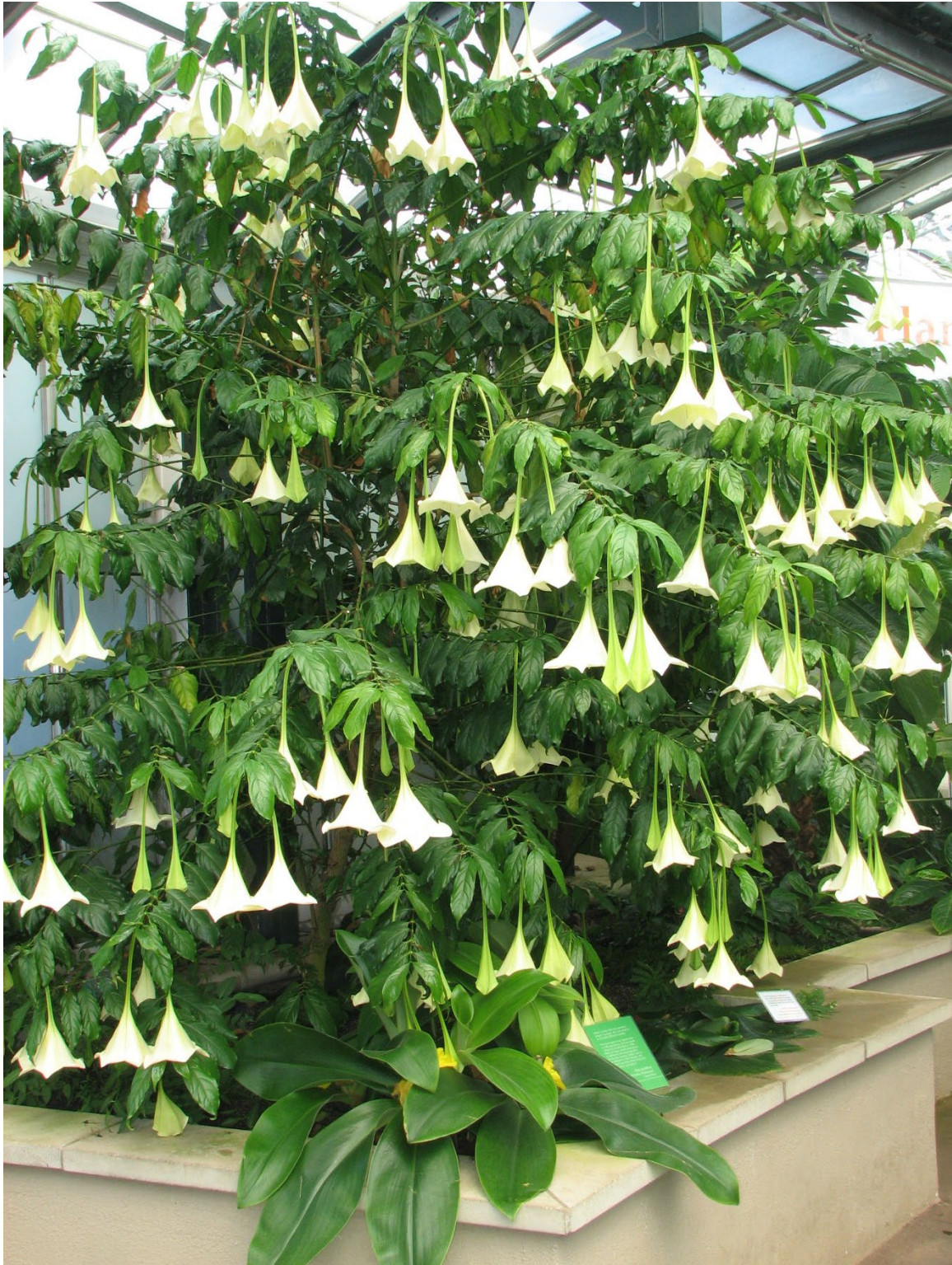
1. Osa pulchra , habit, with large, pendent, trumpet-shaped, white flowers, June, 2009. HNT 81360. All photos of O. pulchra taken in the Conservatory of The Huntington unless noted otherwise.