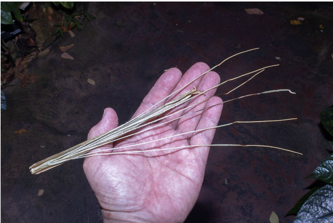
23. Stamens and style of Osa pulchra are long and slender. Note the elongated anthers at the tip of the filaments, and the style (third from bottom on right). HNT 129353.