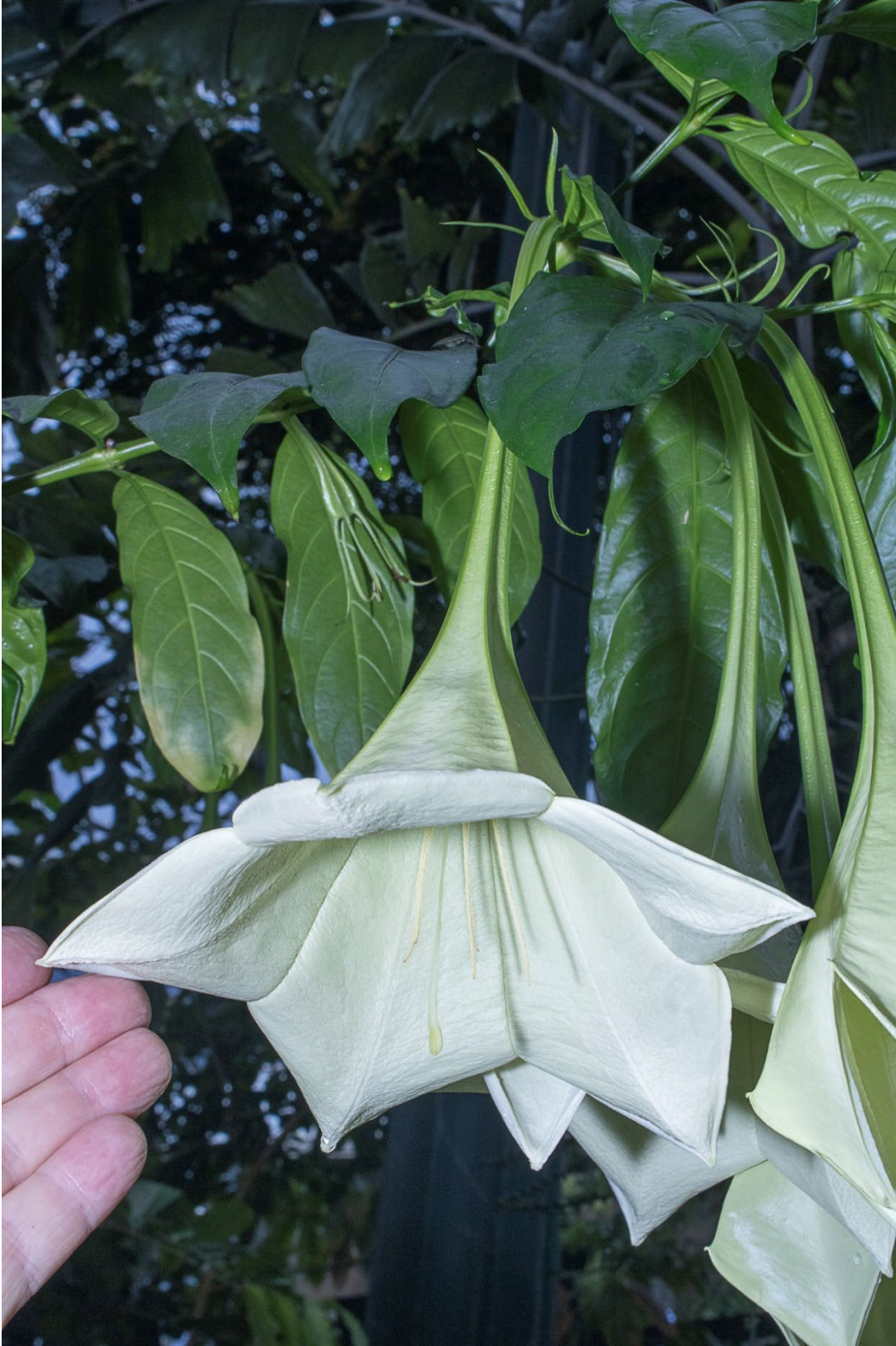
19. The corolla of Osa pulchra is distally flared and five-lobed. HNT 129353 .