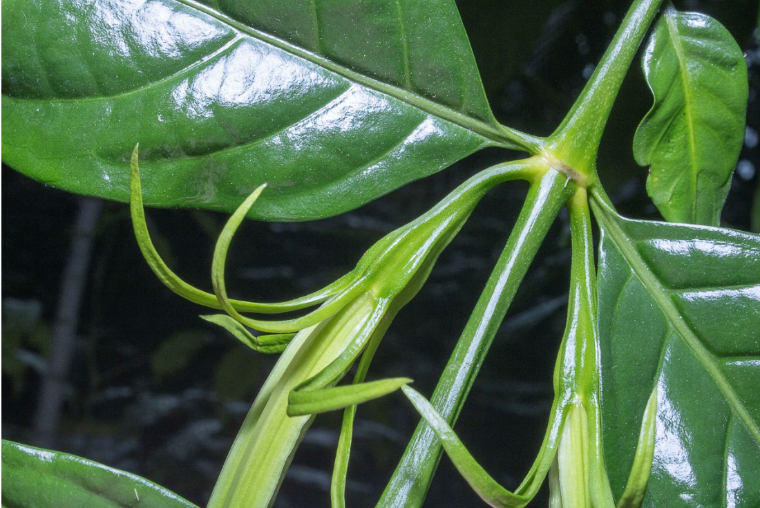
15. The calyx of Osa pulchra is deeply 5-lobed, with narrowly elliptic to linear sepals. HNT 129353.