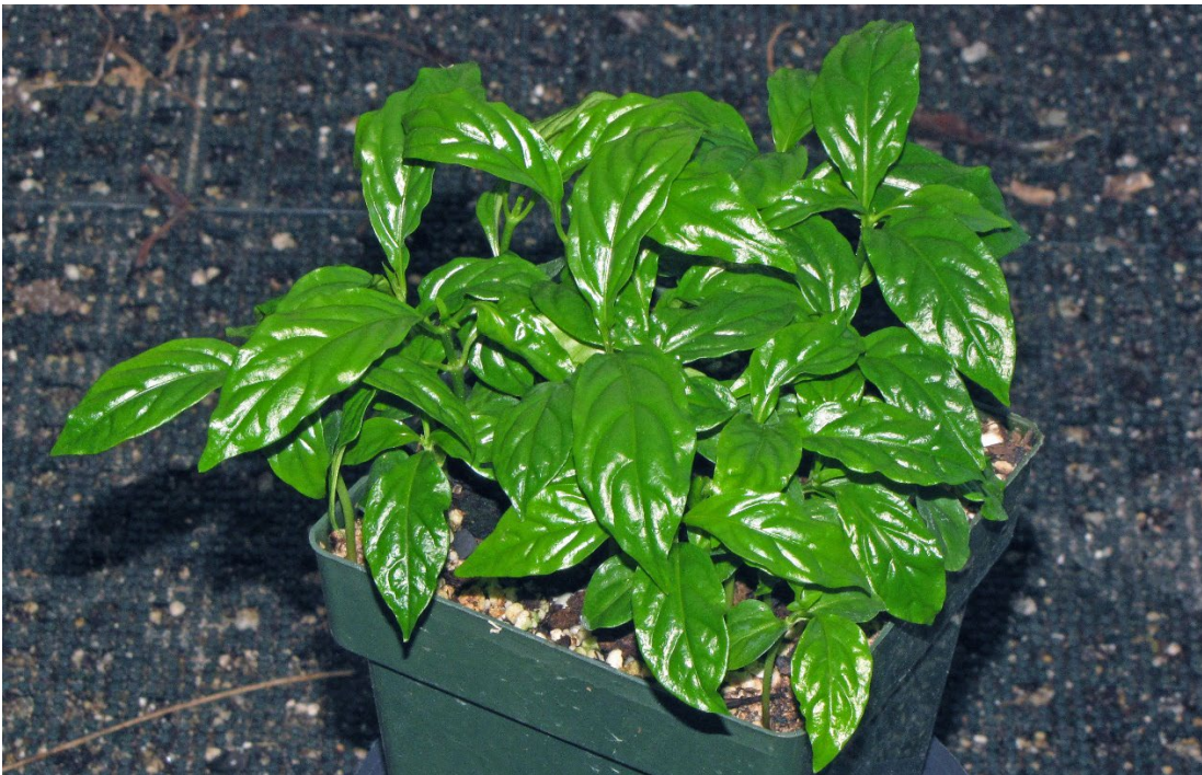
38. A community pot of Osa pulchra seedlings ready for planting in individual liners or small pots.