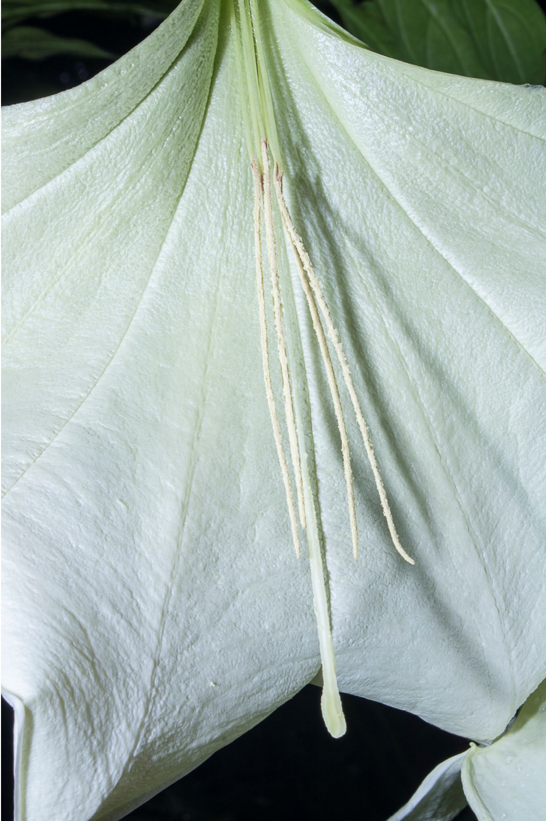
24. The style can exceed the elongated anthers in Osa pulchra . HNT 129353.