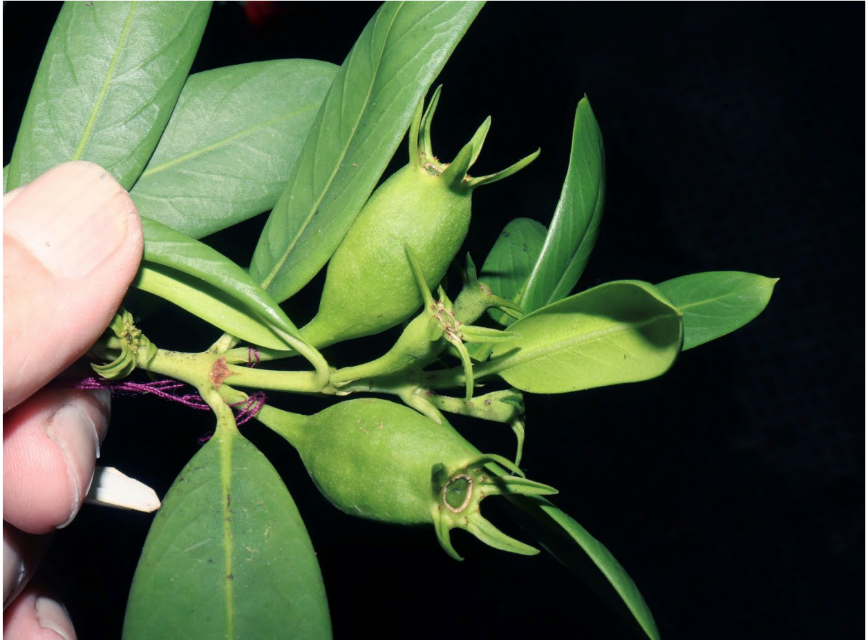
33. Unribbed fruits of Nernstia mexicana differ from the ribbed fruits of its close relative Osa pulchra . Cultivated, H. Ochoterena 153 .