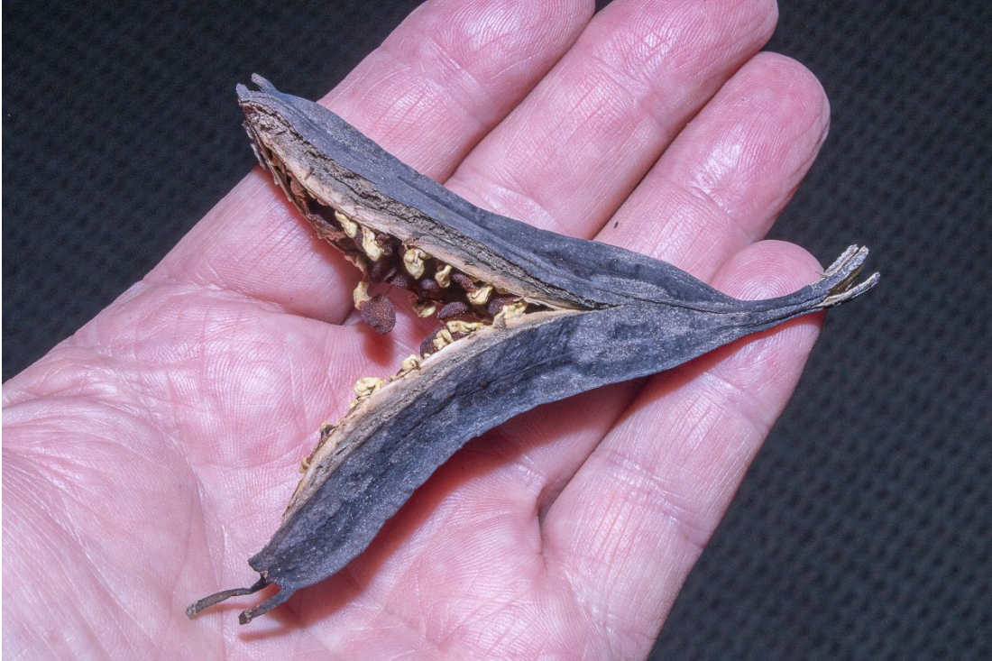
28. Mature fruits of Osa pulchra are woody and split longitudinally.