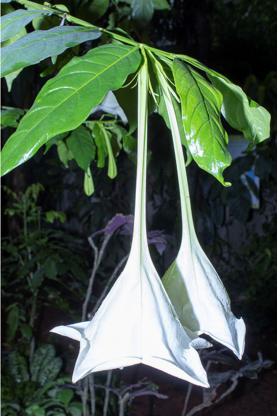
17. The corolla of Osa pulchra has a long, narrow throat before abruptly flaring outwards. HNT 129353.