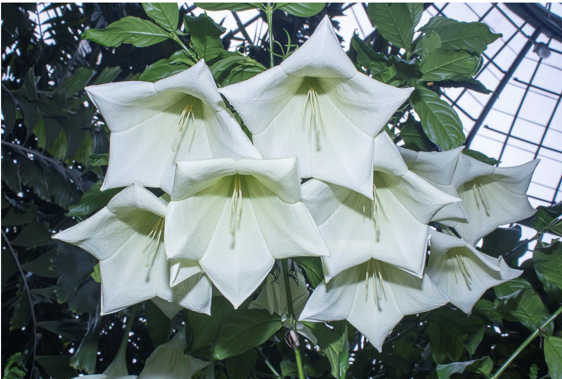
16. The five-ribbed corolla of Osa pulchra is trumpet-shaped with the distal portion flared outward and five lobed. HNT 129353.