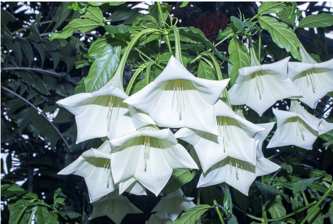
11. The handsome and showy flowers of Osa pulchra are large, white, and pendent. HNT 129353.