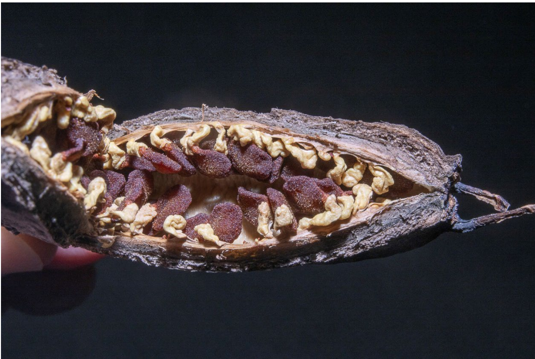
29. The view of the seeds inside the fruit of Osa pulchra shows the attached aril.