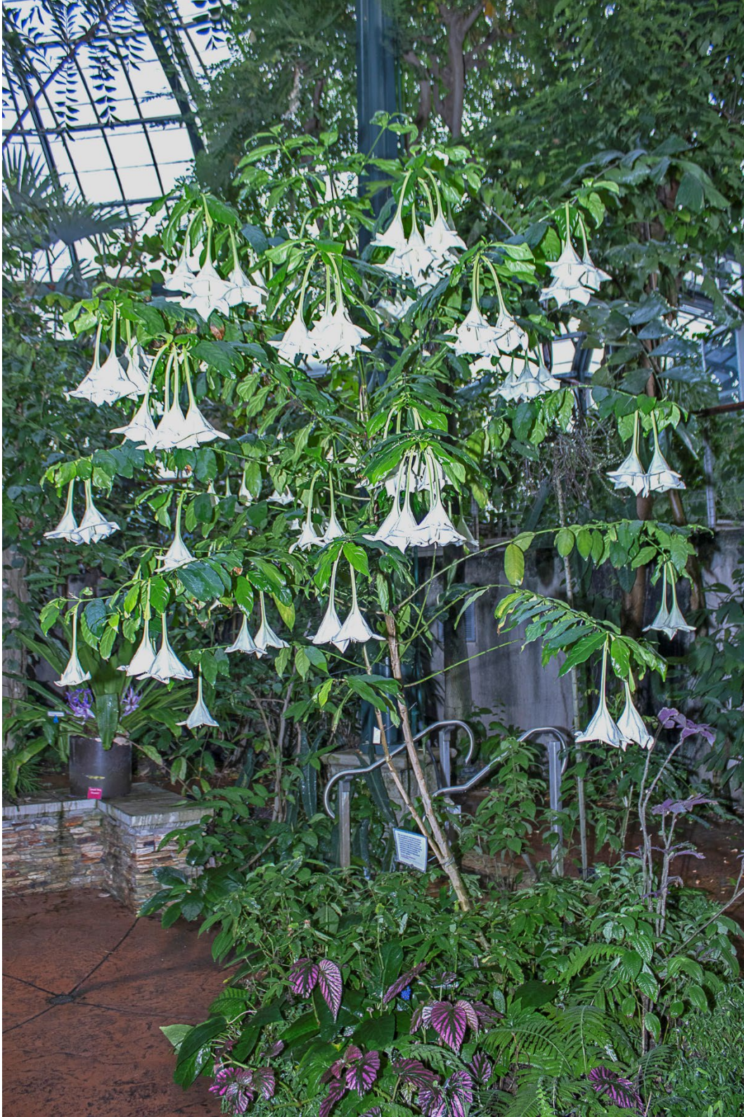
5. Osa pulchra , habit. HNT 129353.