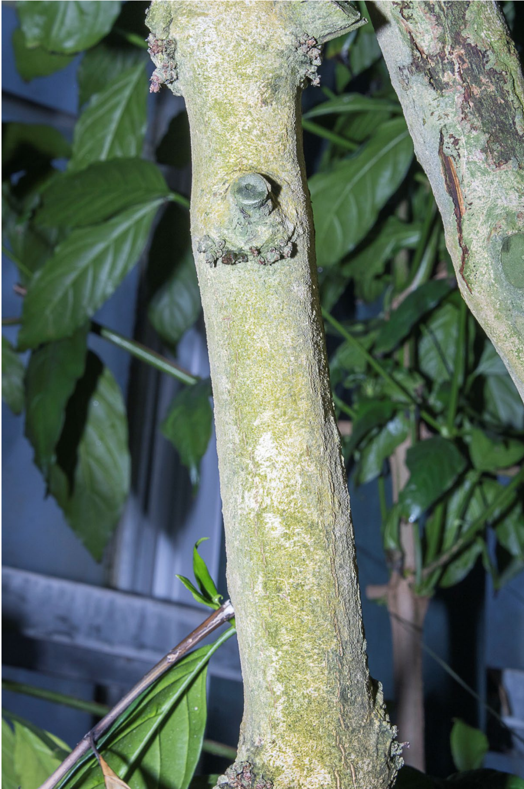
6. Bark of Osa pulchra is mostly smooth and tan. HNT 81360.