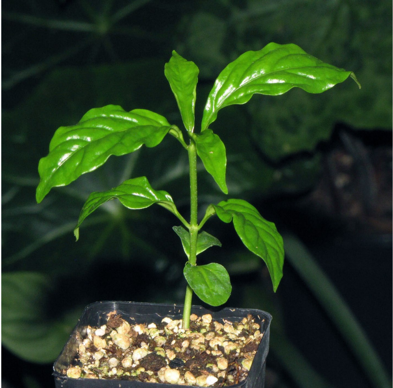
39. This well grown seedling of Osa pulchra will soon be ready to shift up into a larger size pot.

firmly rooted and roots have filled the liner container, shift them up into the next appropriately larger container ( Fig. 39 ). When the roots have filled out this larger container, typically a 3.8 ℓ (1-gallon), they are ready for planting out. They also make an acceptable container plant ( Fig. 34 ).