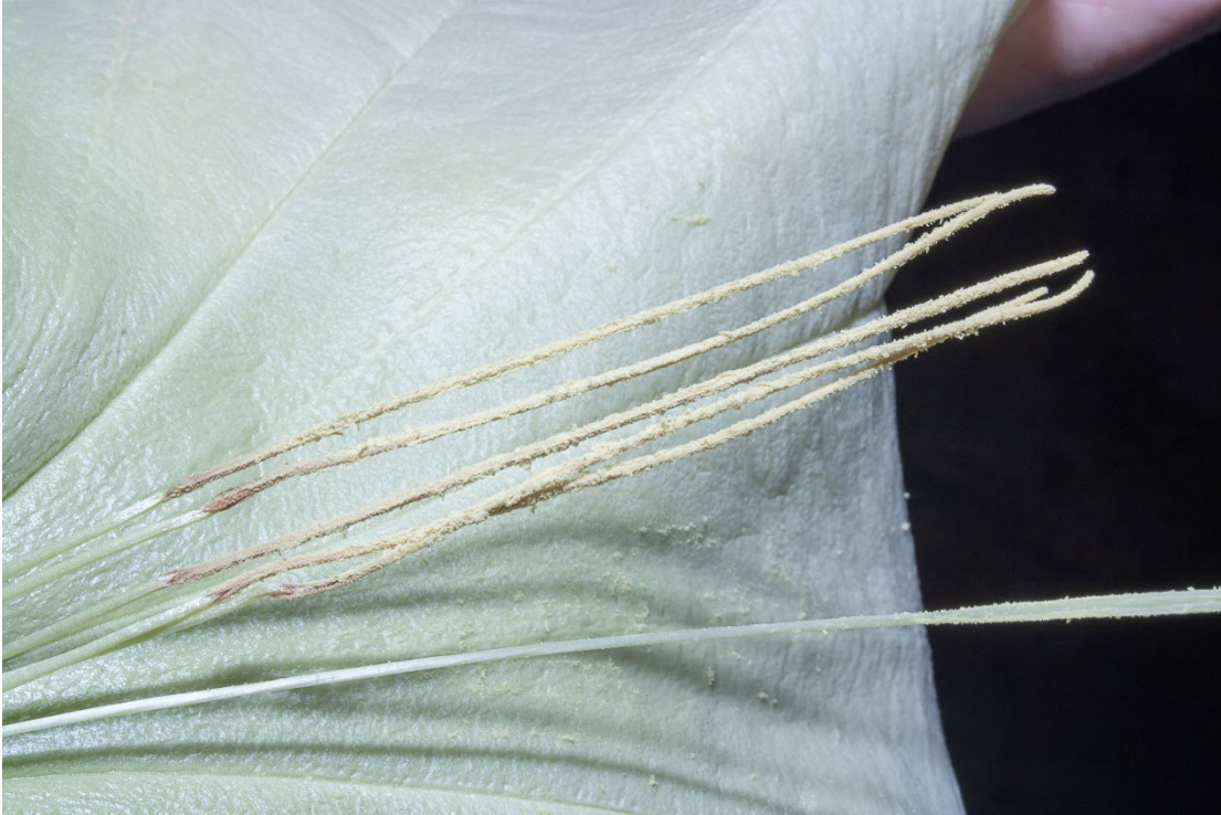
35. The elongated anthers of Osa pulchra contain abundant pollen. HNT 129353.