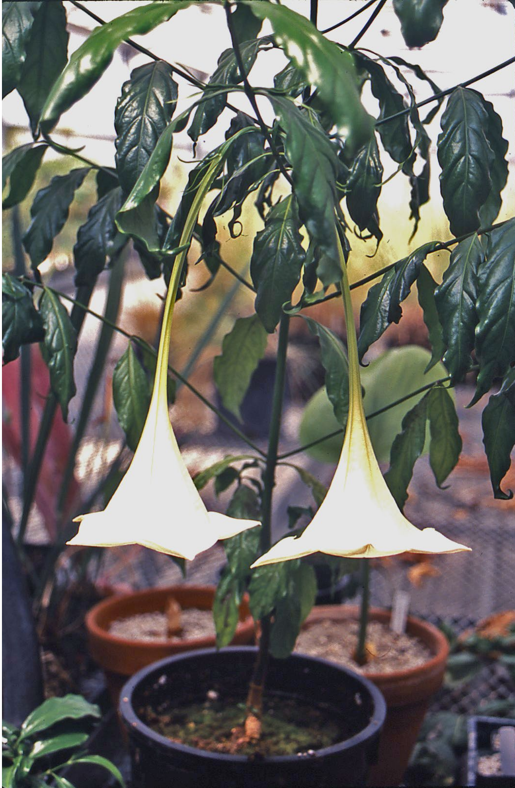
34. Osa pulchra makes a suitable container plant and flowers as a young specimen.