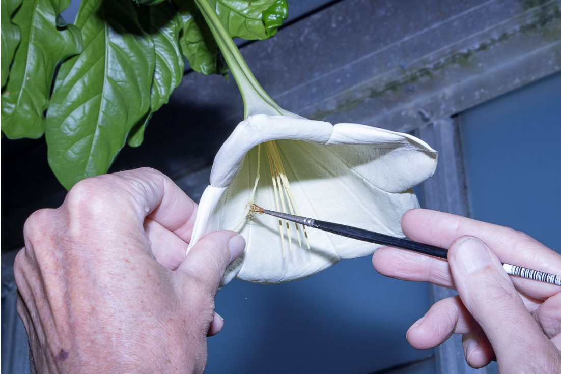
37. Apply the pollen carefully to the stigmatic surface of a different clone of Osa pulchra from which the pollen was collected. HNT 81360.