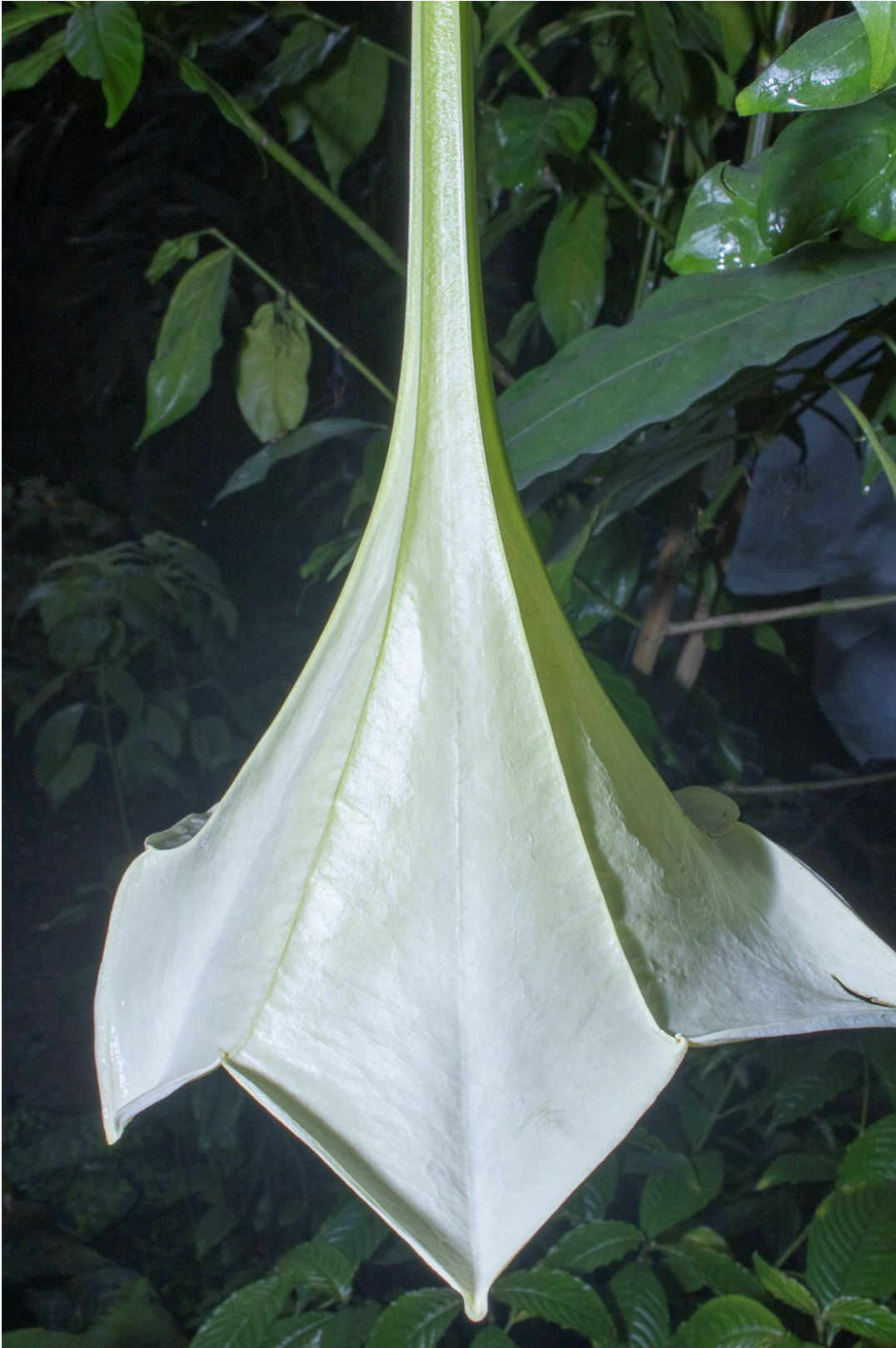
18. The corolla of Osa pulchra is five-ribbed and -lobed distally. HNT 129353.