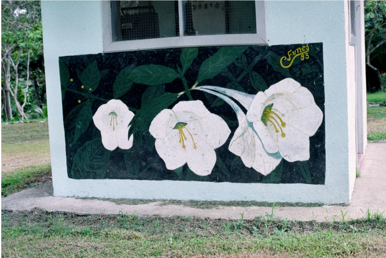
2. A painting of Osa pulchra graces a wall at the entrance to the old Estación BOSCOA near the historic, original site near Rincón.