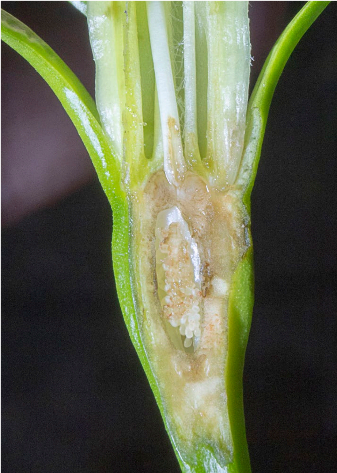
25. In this longitudinal view of the ovary of Osa pulchra the ovules (if fertilized, future seeds) are visible as well as the base of the style and filaments, the latter with small, retrorse hairs. HNT 129353 .