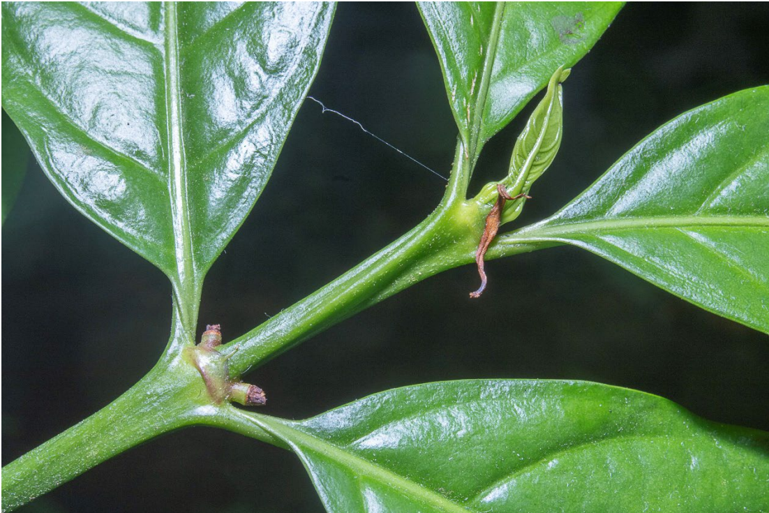
7. The interpetiolate stipules of Osa pulchra are rounded to broadly triangular, briefly connate around twig, and with an acuminate to attenuate apex. Note the short, winged petiole or leaf stalk. HNT 129353.