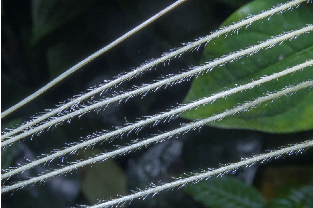
22. The stamens of Osa pulchra have long filaments with short, retrorse hairs. HNT 129353.