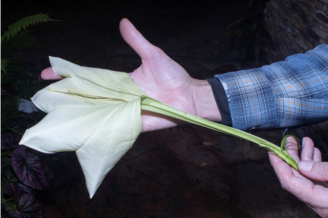
20. Part of the corolla of Osa pulchra was removed to show the stamens and style exerted from the narrow portion of the corolla tube. HNT 129353 .