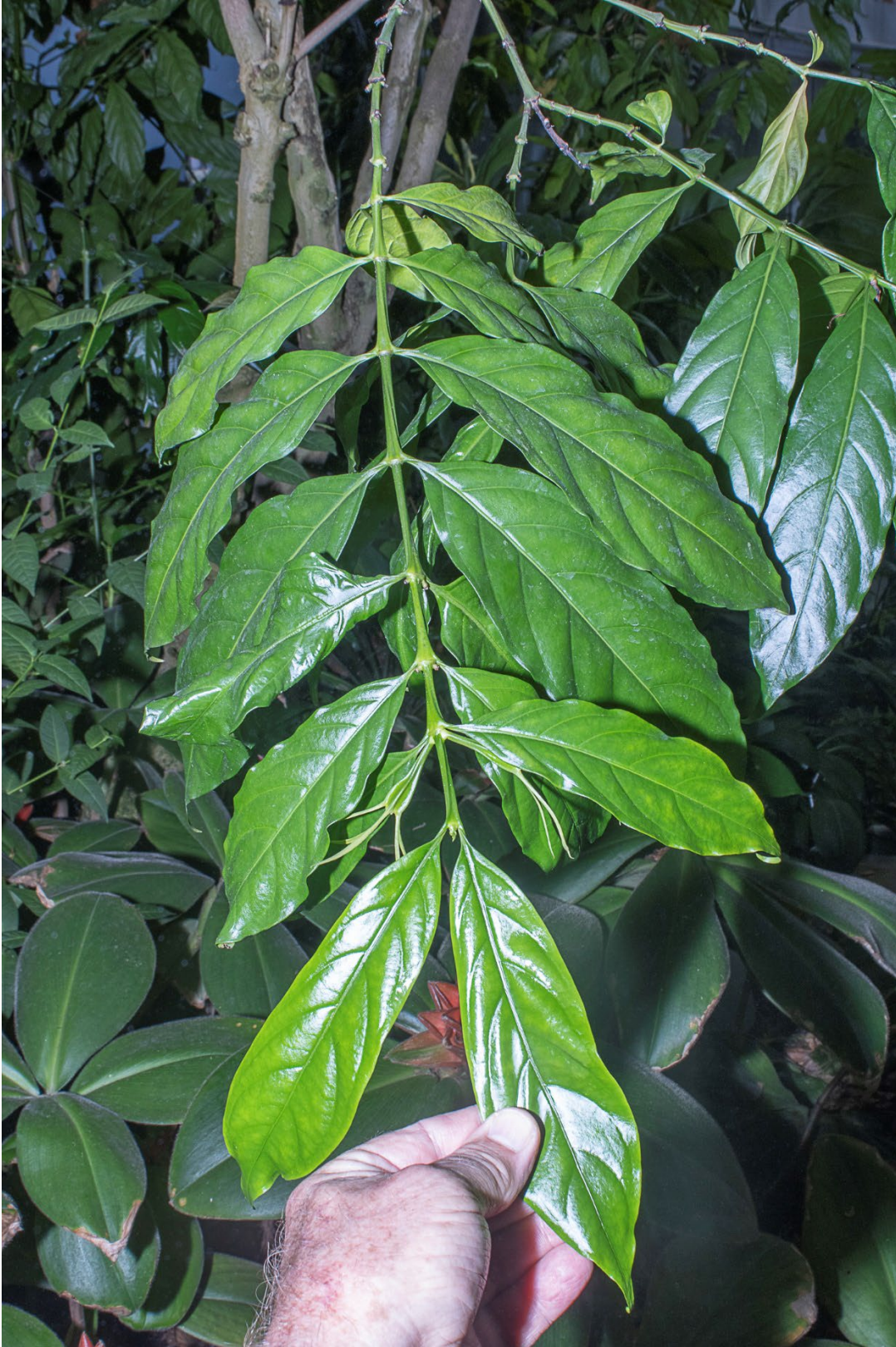
9. Leaves of Osa pulchra are opposite and distichous when spreading in the same plane. HNT 81360.