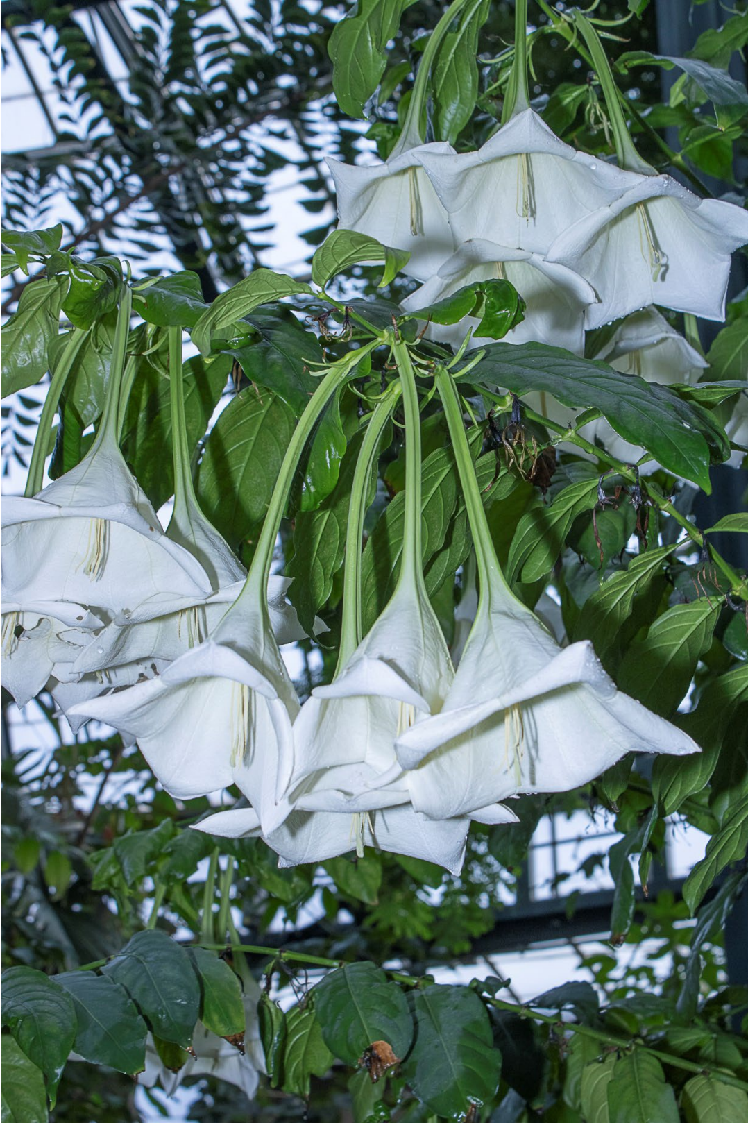
14. The flowers of Osa pulchra are typically one per leaf axil (two per node). HNT 129353.