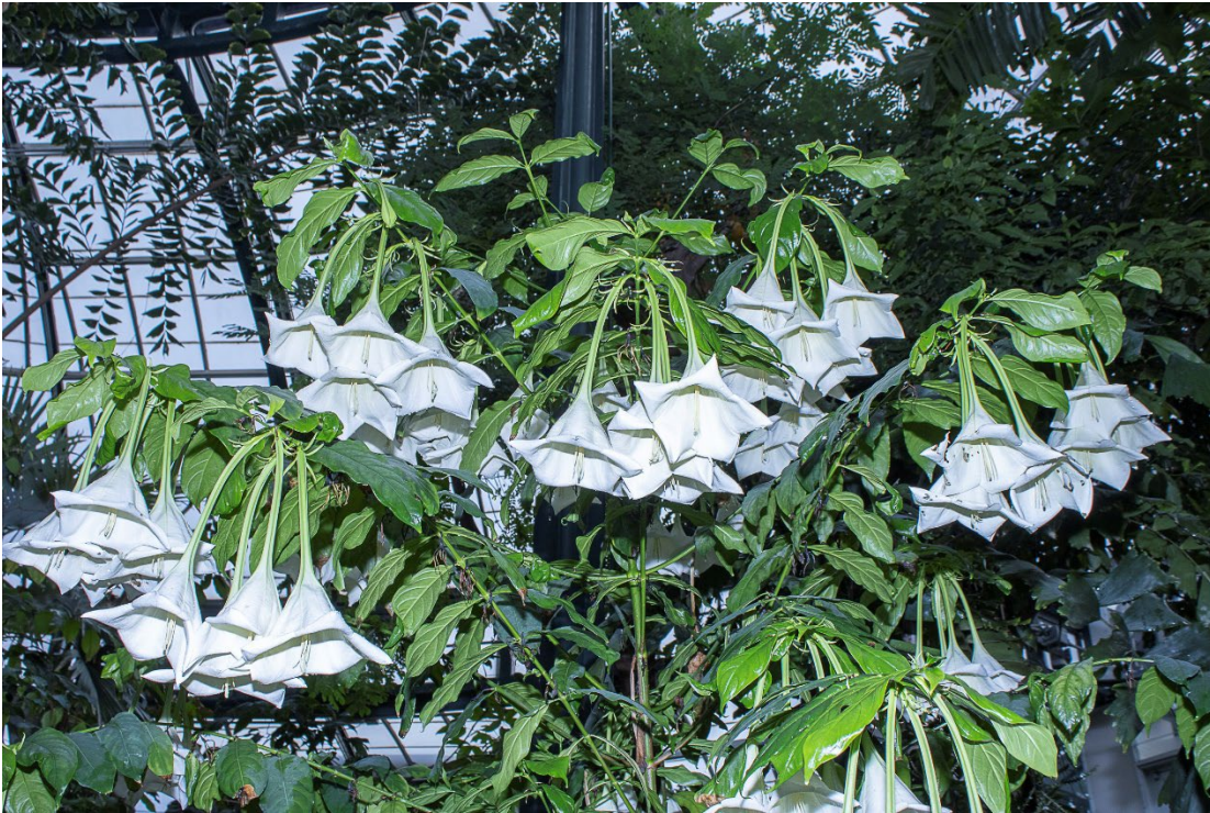
12. The large, white, pendent flowers of Osa pulchra appear in distal portions of leafy lateral shoots. HNT 129353.