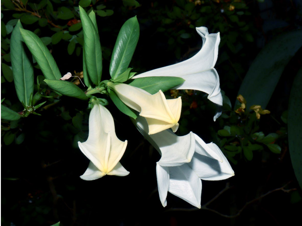
31. Nerstia mexicana is a relative of Osa pulchra . Cultivated, H. Ochoterena 153.