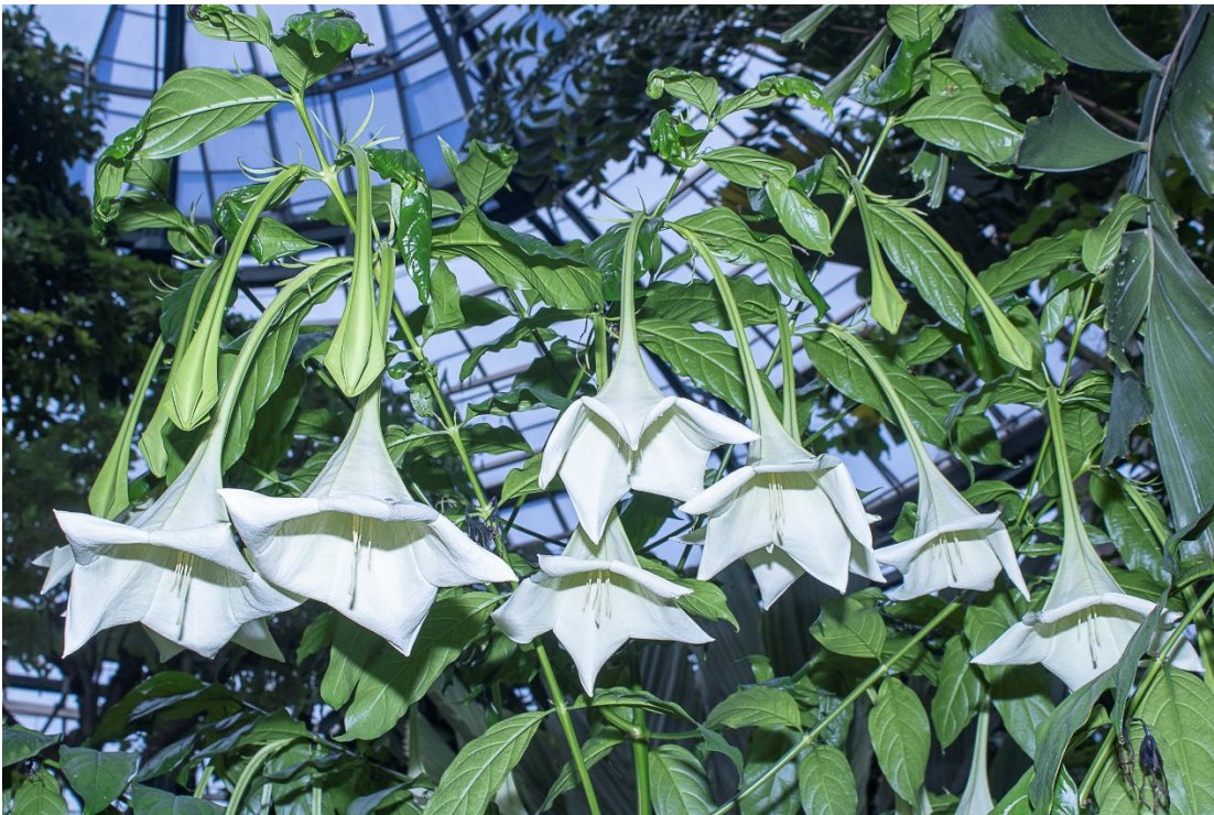
13. Flowers of Osa pulchra are large, white, and pendent. HNT 129353.