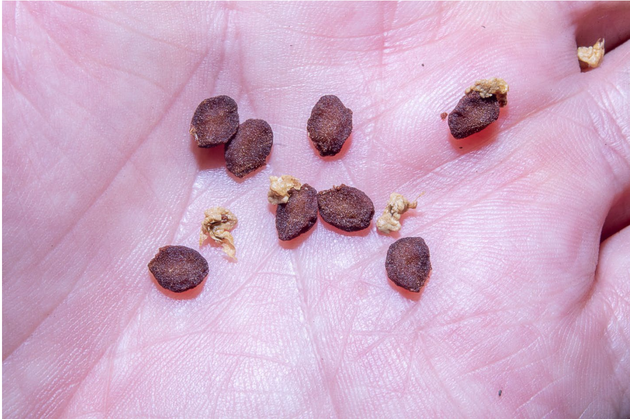
30. Seeds of Osa pulchra are irregularly rounded, more or less flat, and brown. Note the attached and detached arils.