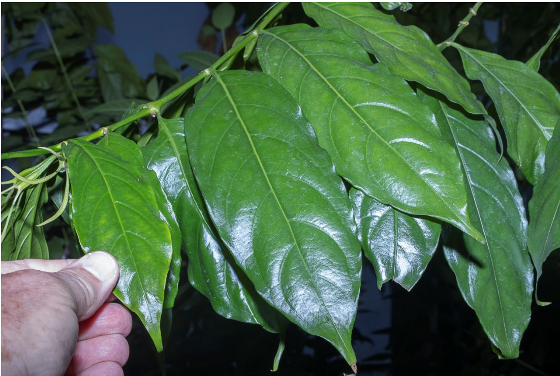
8. Leaves of Osa pulchra are simple, opposite, and glossy green. HNT 129353.