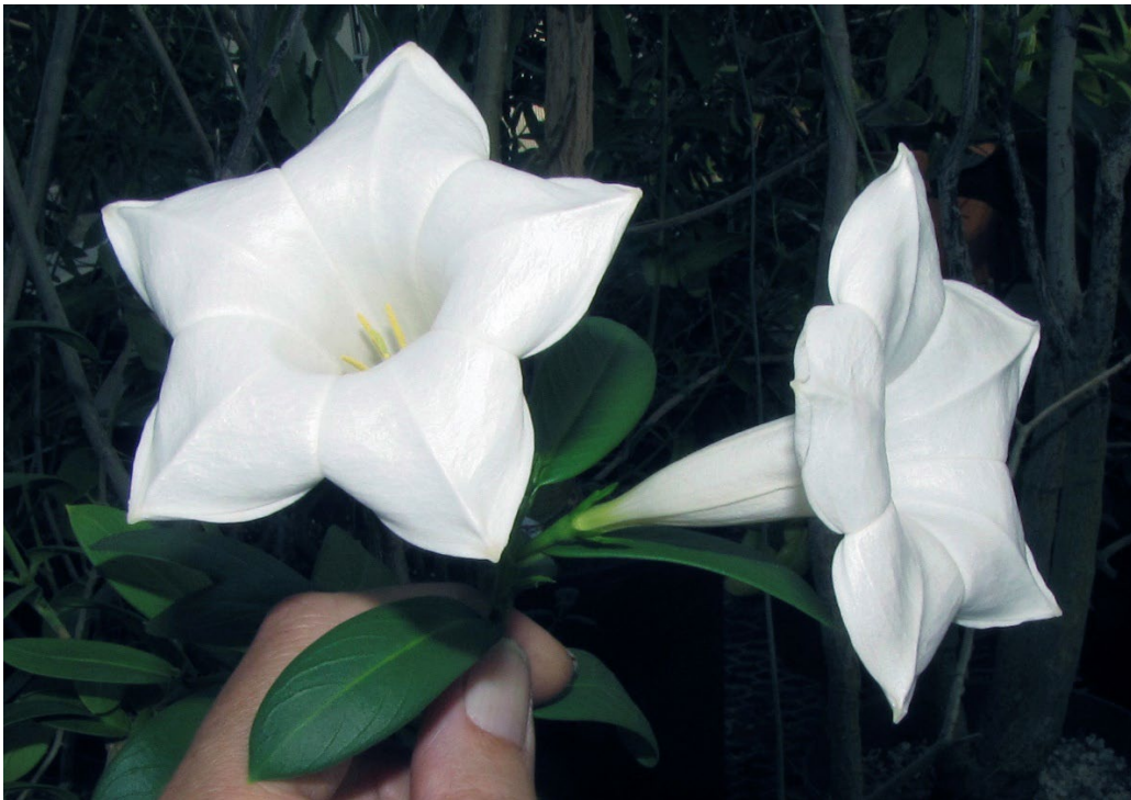
32. Flowers and leaves of Nerstia mexicana are smaller than those of Osa pulchra . Cultivated, H. Ochoterena 153.