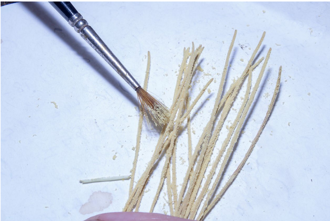
36. Pick up pollen of Osa pulchra with the brush. HNT 129353.