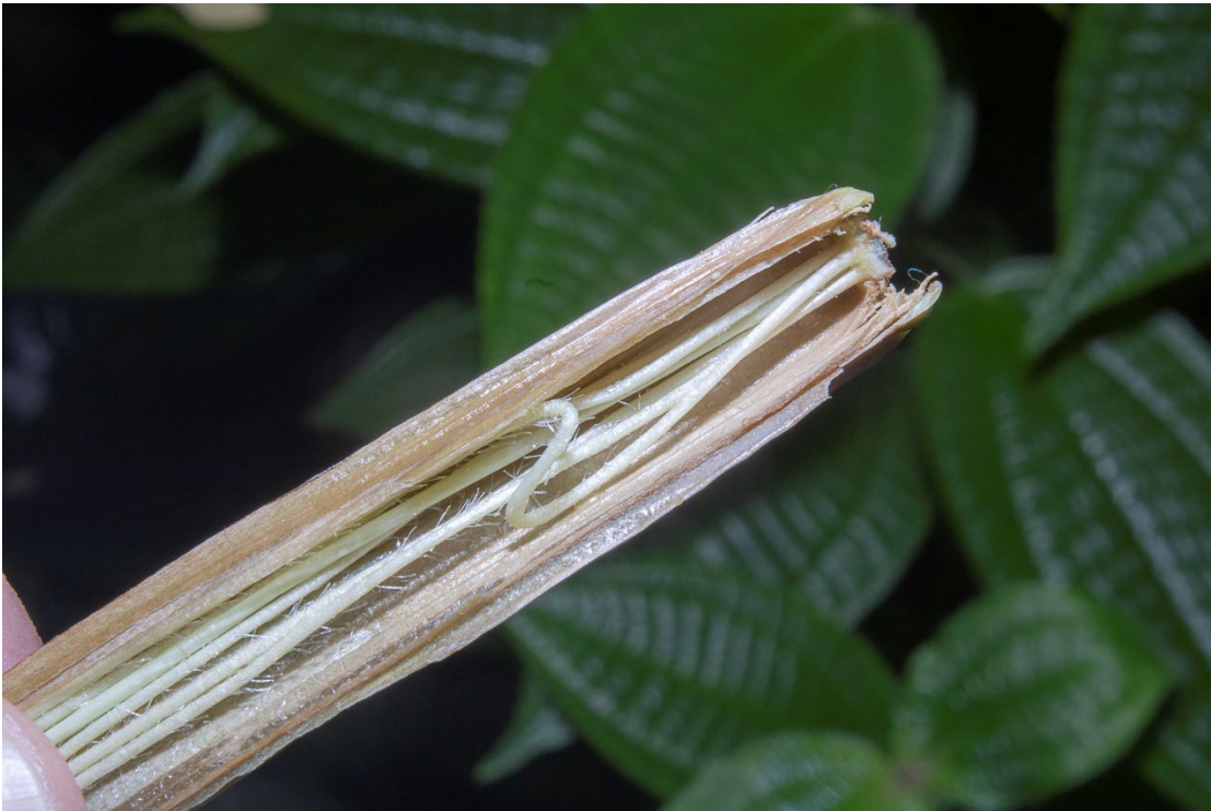
21. The narrow, tube-like base of the corolla of Osa pulchra shows the base of the stamens and style bunched together. HNT 129353 .