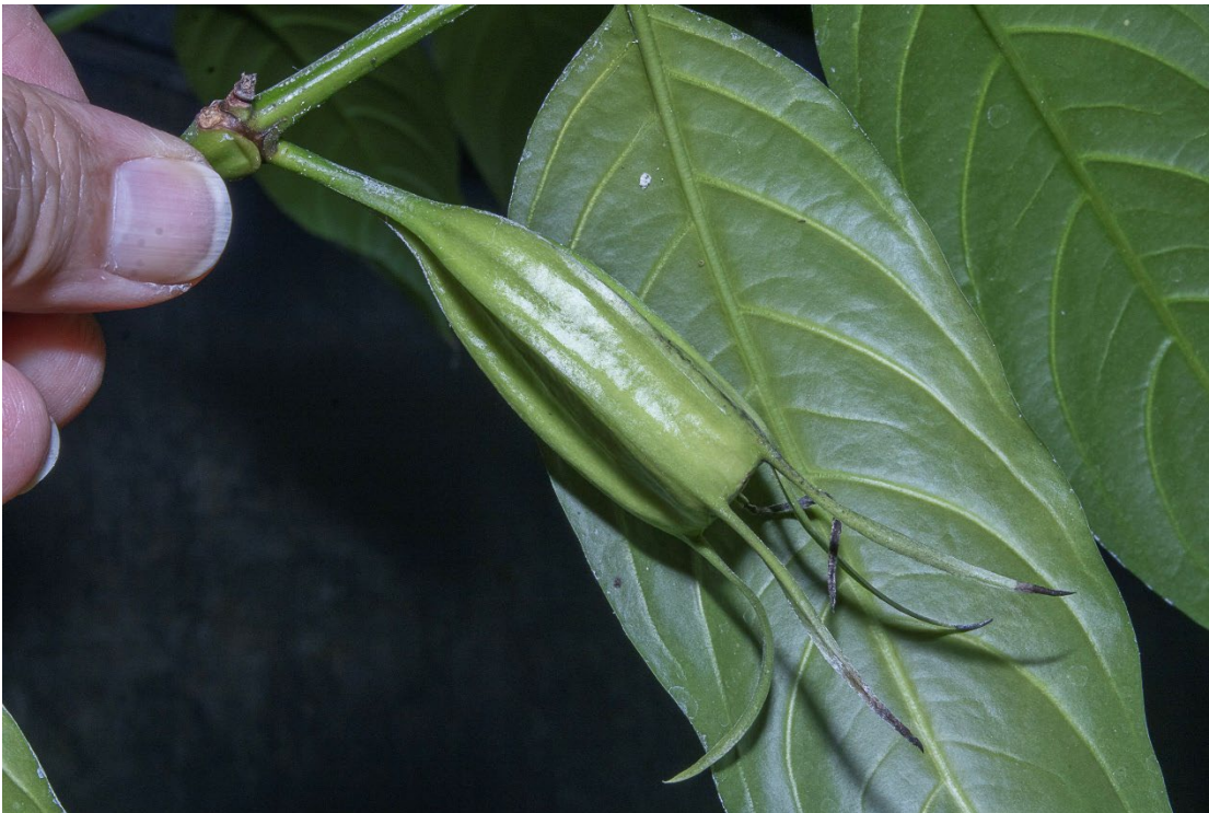
27. Immature fruits of Osa pulchra are green and prominently ribbed, the ribs terminating in the long, slender calyx lobes. HNT 81360.