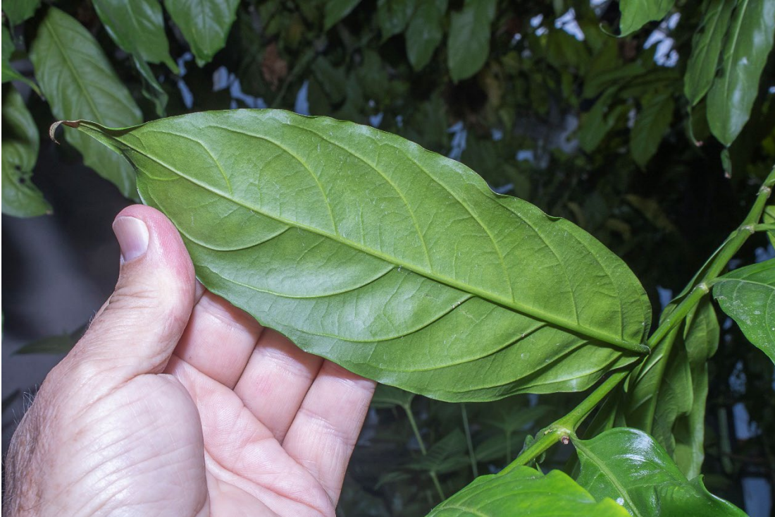
10. Leaf blades of Osa pulchra are elliptic to narrowly elliptic-oblanceolate with an acuminate apex and 5–8 primary lateral veins on each side of midrib, these raised abaxially. HNT 129353.