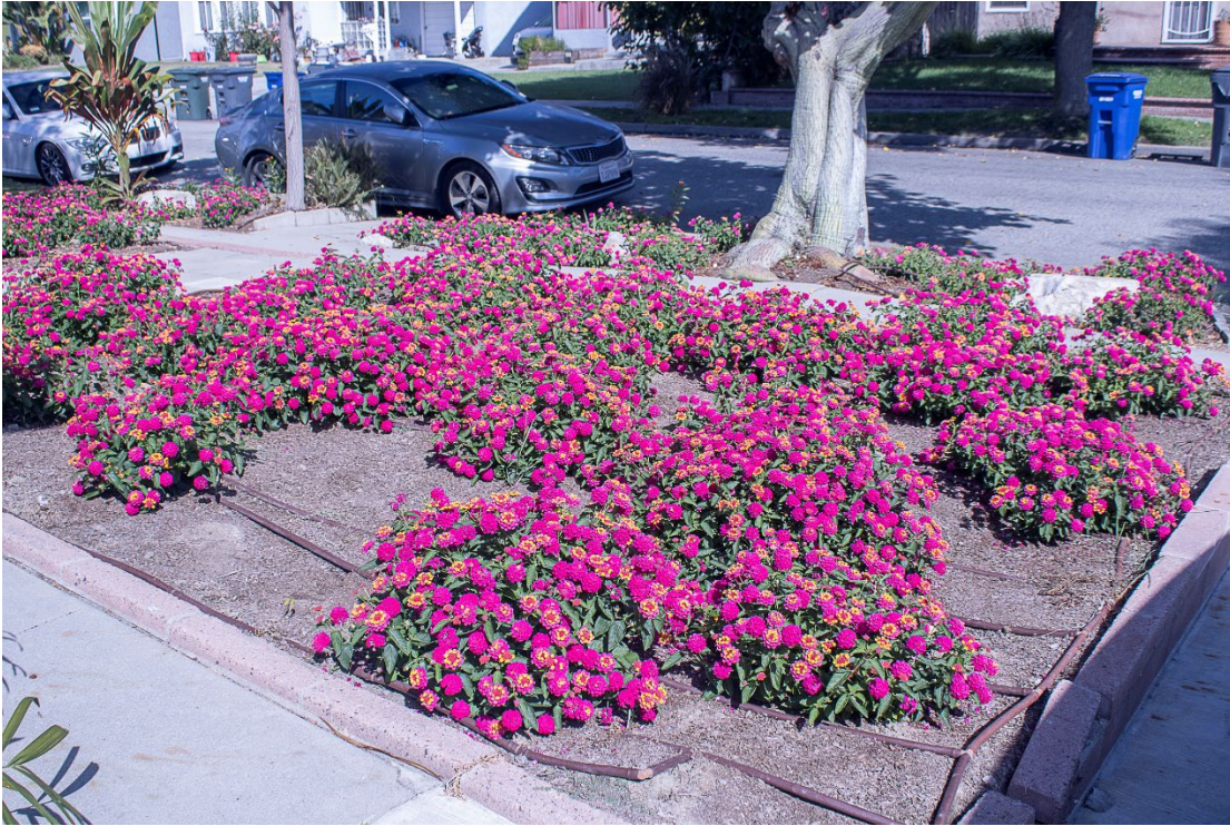
1. Lantana strigocamara 'Balandrise' makes an outstanding mass planting or ground-cover. All photographs taken at Lakewood, CA and © 2024 by D. R. Hodel.