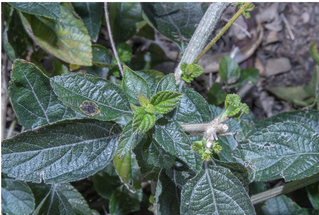
14. Two weeks after pruning Lantana strigocamara 'Balandrise' (study initiation), latent, subapical buds began to initiate growth.