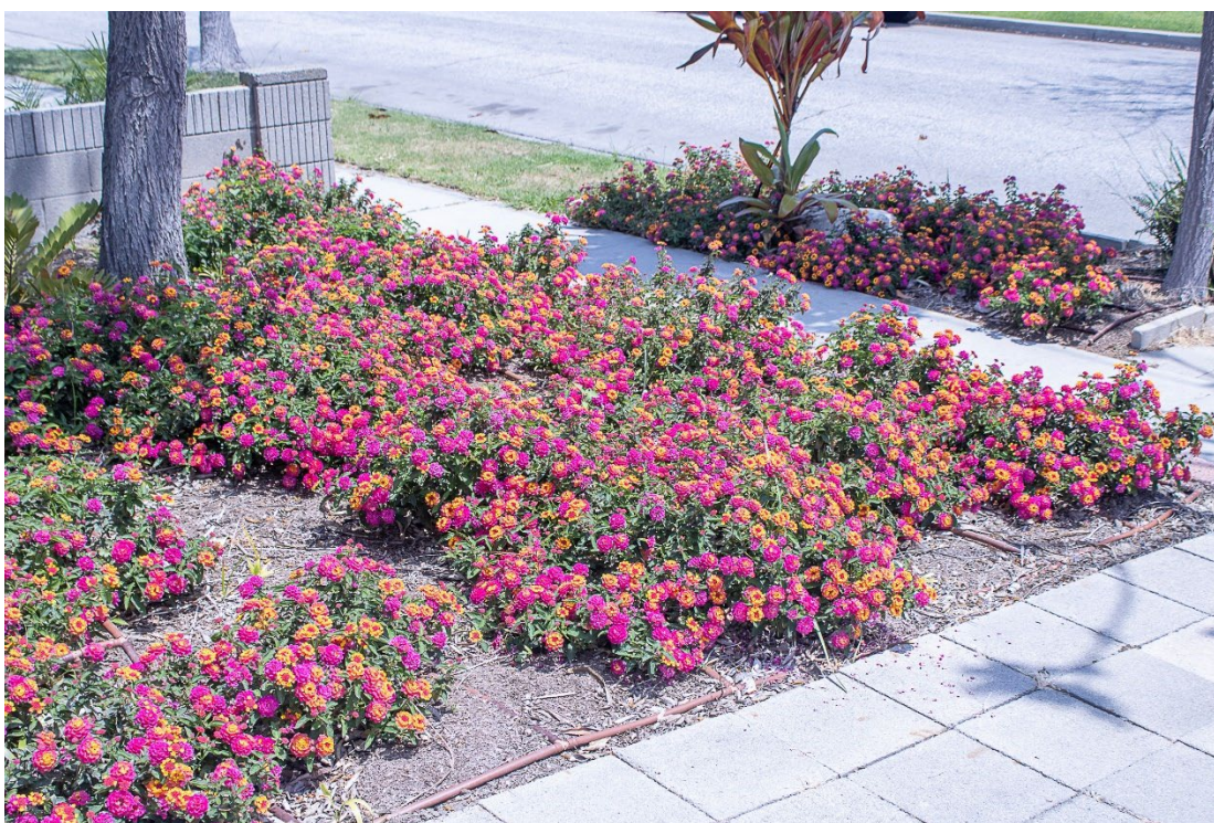
18. Unpruned plants of Lantana strigocamara 'Balandrise', which already had inflorescences when the study initiated, attained peak flower 3.5 weeks later.