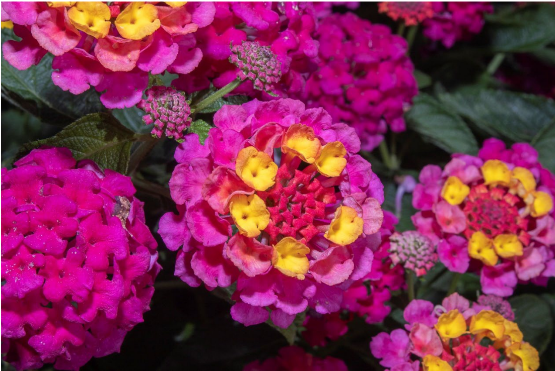
8. The bright yellow-orange and dark purple-pink flowers of Lantana strigocamara 'Balandrise' make a pleasing color combination.