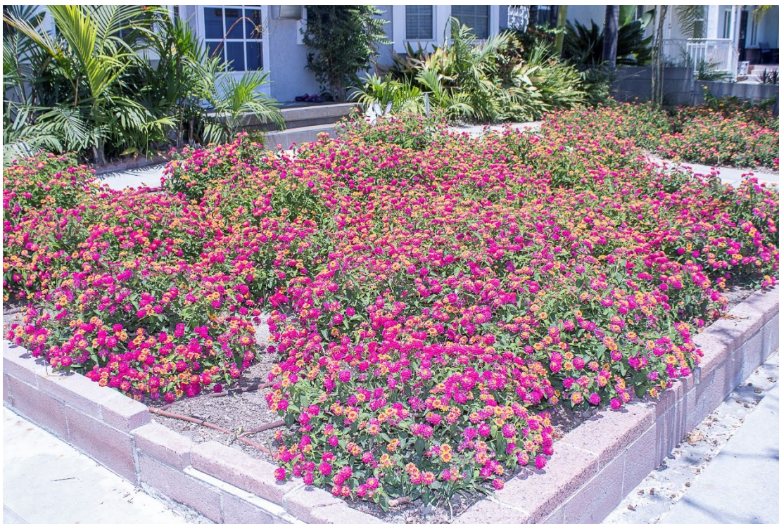
17. Ten weeks after pruning, plants of Lantana strigocamara 'Balandrise' had mean new shoot growth of 13 cm and attained peak flower.