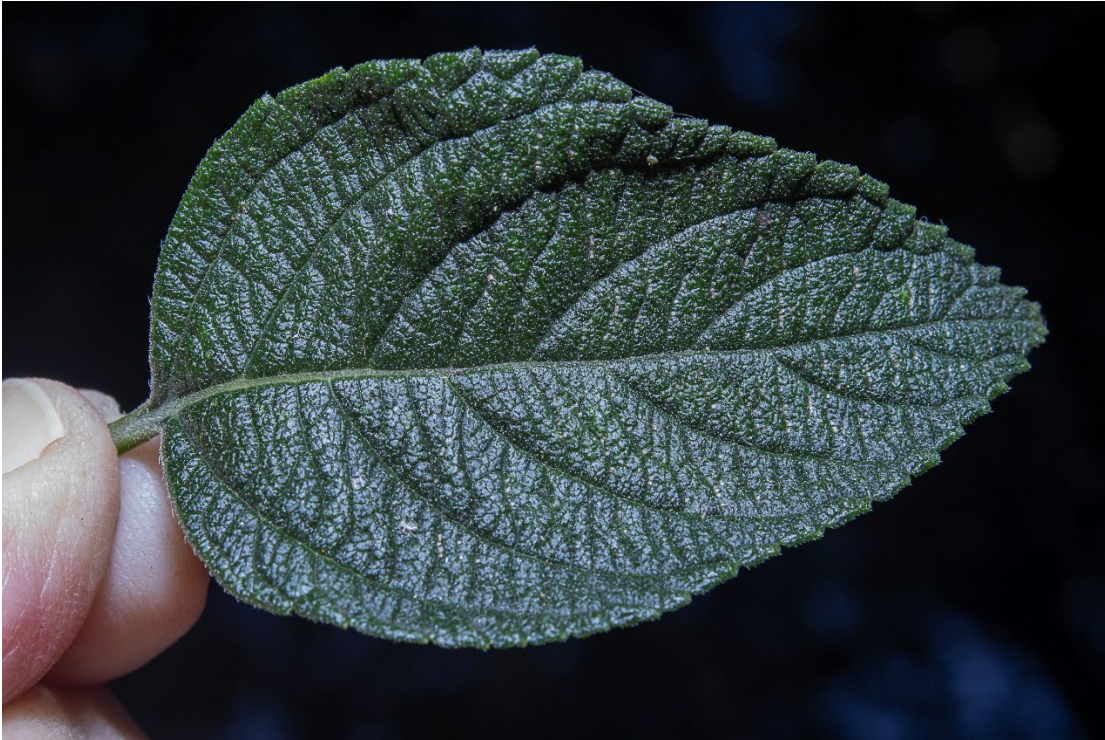
3. Leaves of Lantana strigocamara 'Balandrise' are dark green and conspicuously scabrous-pubescent adaxially, with finely toothed margins distally.