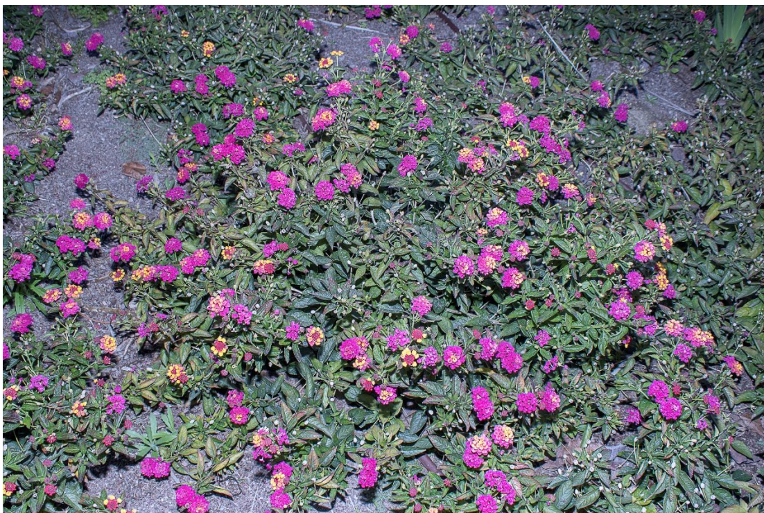
9. By April 15, 2024, plants of Lantana strigocamara 'Balandrise' were emerging from their winter stasis and beginning to grow and flower.