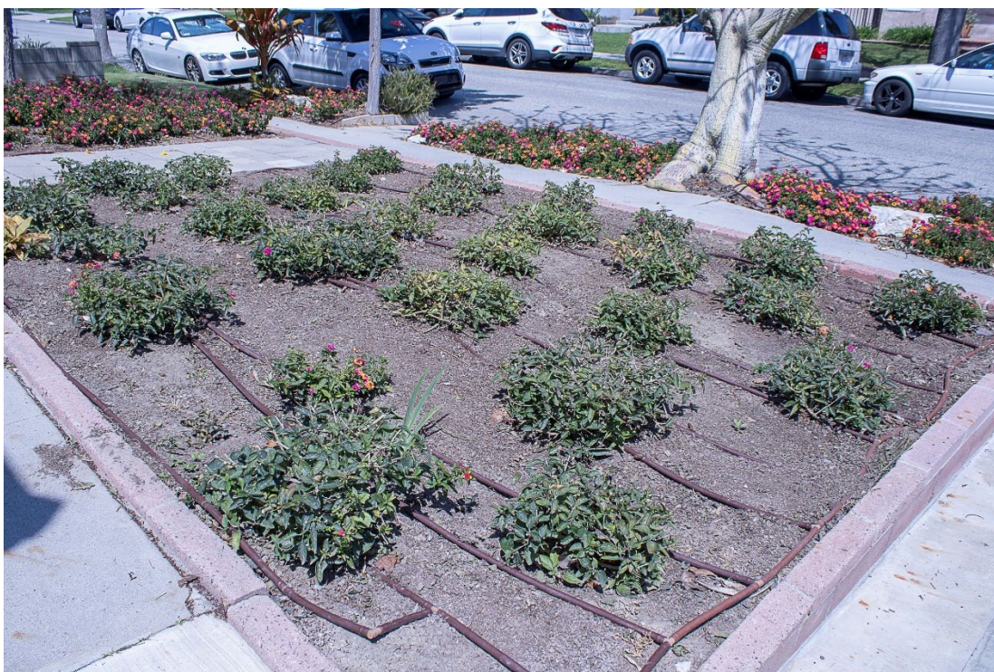
10. On April 15, 2024, the 25 clumps of Lantana strigocamara 'Balandrise' in the south section were pruned to 15 cm tall.