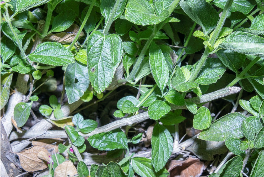
11. Pruned plants of Lantana strigocamara 'Balandrise' produced only lateral shoots during the study. Note the pruned tip at the right.