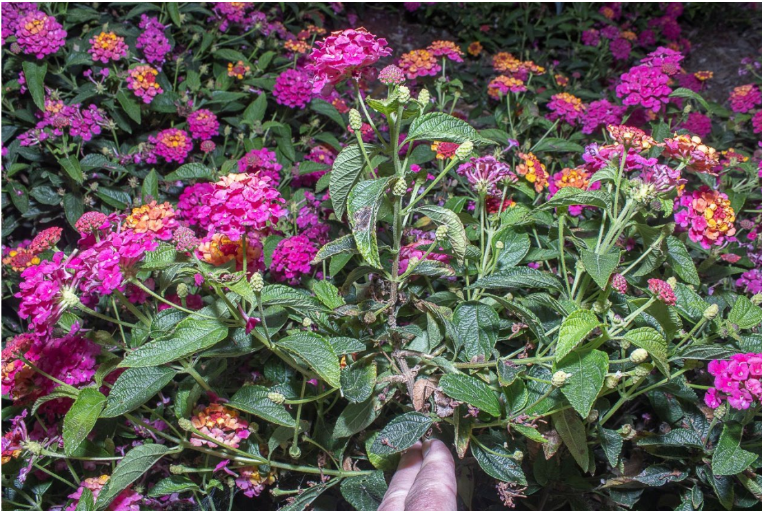
12. Unpruned plants of Lantana strigocamara 'Balandrise' produced a combination of tip (center) and lateral shoots (left and right) during the study.