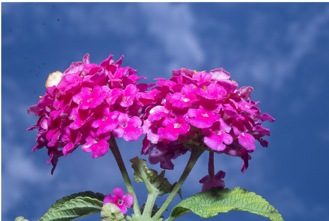
6. The inflorescence of Lantana strigocamara 'Balandrise' holds about 45 flowers.