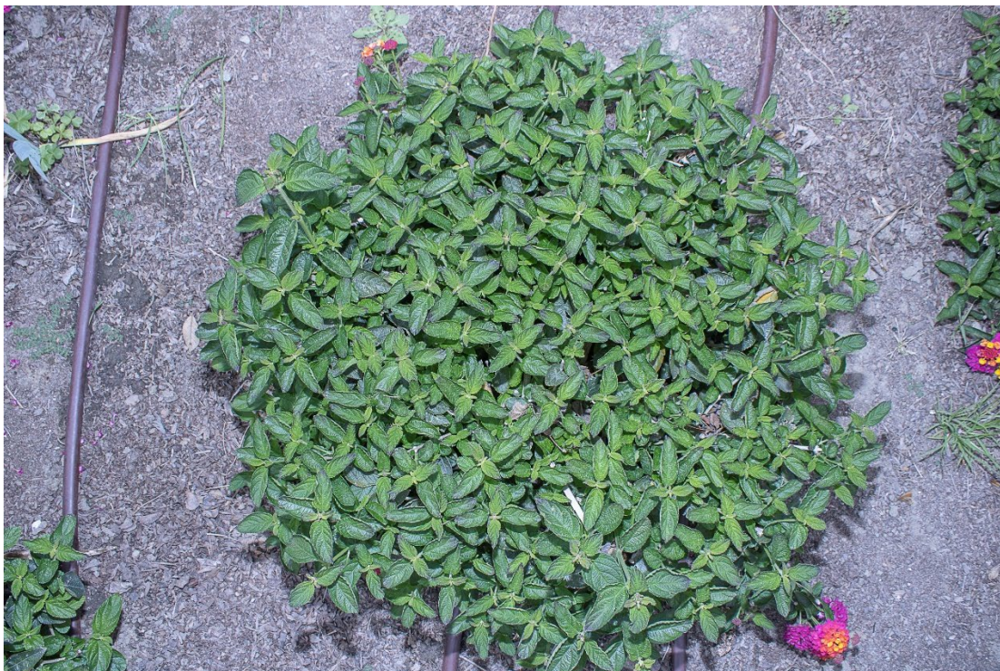
15. Five weeks after pruning Lantana strigocamara 'Balandrise', plants had grown substantially.