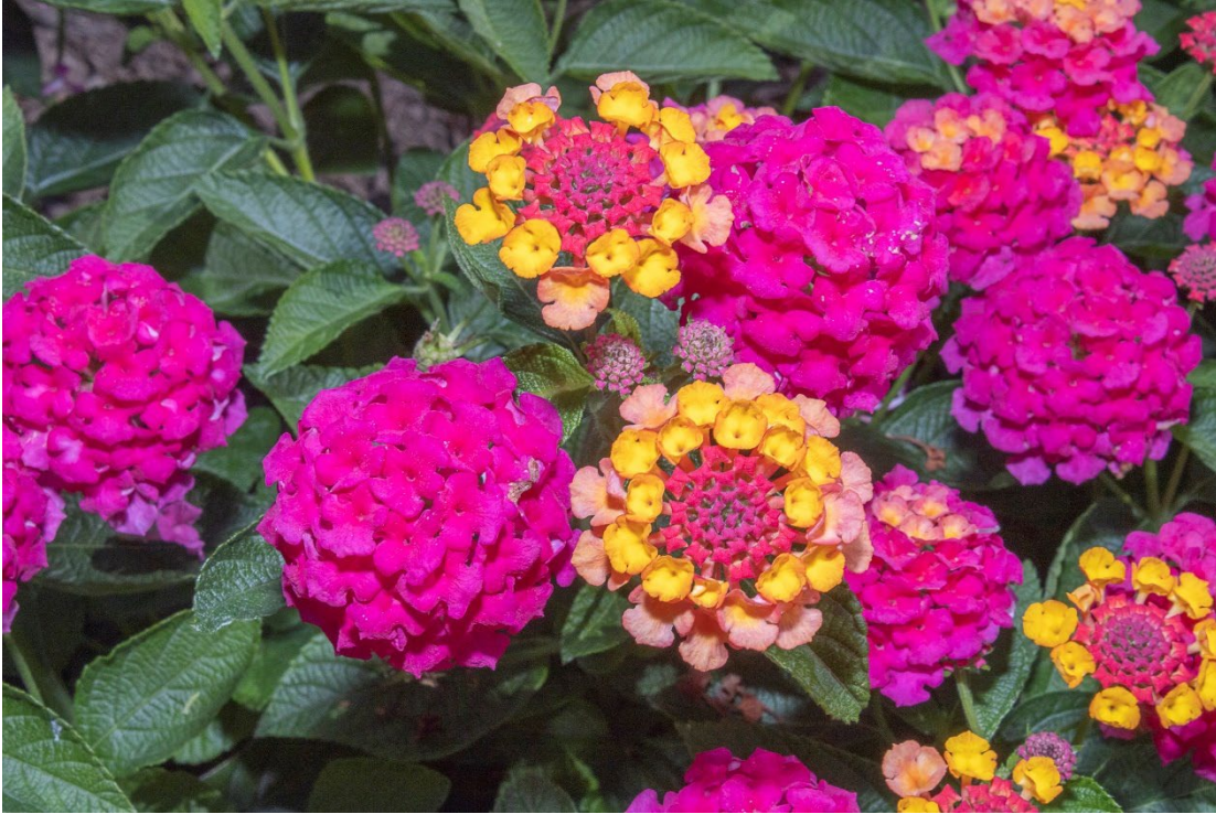
7. Inflorescences of Lantana strigocamara 'Balandrise' are a striking and redeeming feature, with newly emerging bright yellow-orange flowers at the top that later change to purple-pink as they age and “move downward” in the inflorescence.