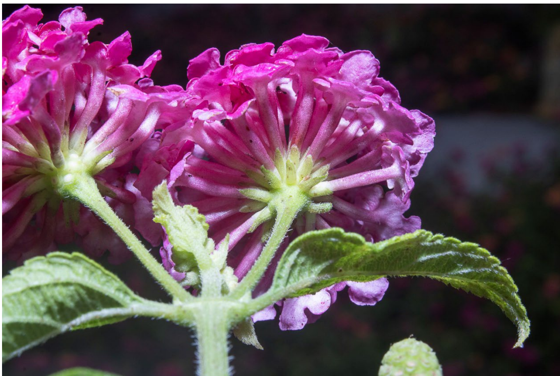
5. The inflorescence of Lantana strigocamara 'Balandrise' is held on a scabrous-pubescent peduncle. Note the long corolla tube with a green calyx at its base.