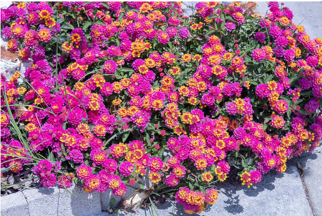
2. Lantana strigocamara 'Balandrise' has handsome flowers emerging bright yellow-orange at the top of the inflorescence then later changing to purple-pink as they age.