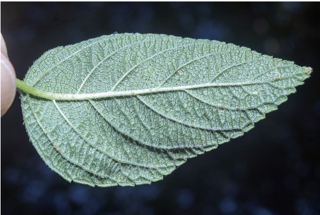
4. Leaves of Lantana strigocamara 'Balandrise' are paler abaxially and conspicuously scabrous-pubescent on the midrib and main veins.