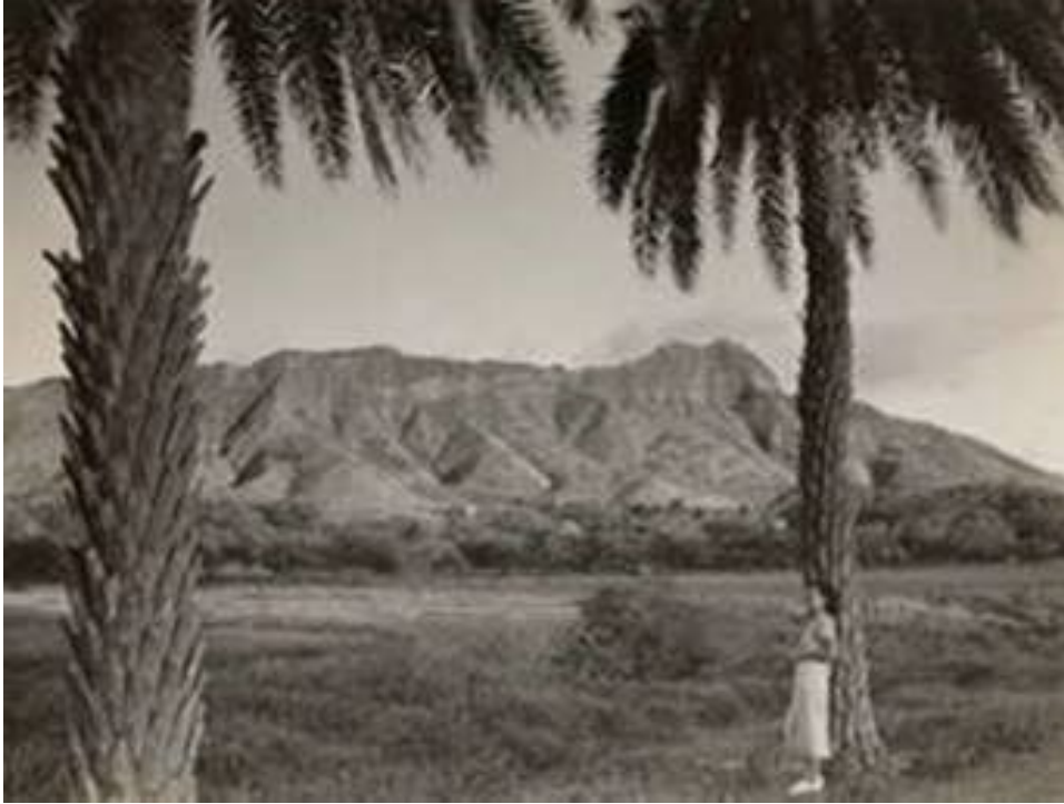
10. Date palms, girl at the base of the date palm, circa 1880, Kapi'olani Park, Honolulu. Source: Hawai'i State Archives. Public domain.