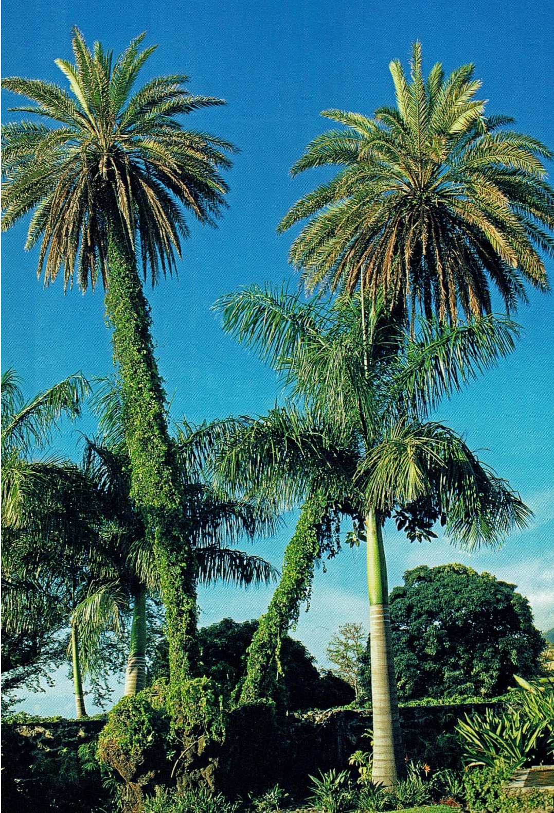
5. Date palms at Edward Bailey house, Wailuku, Maui.