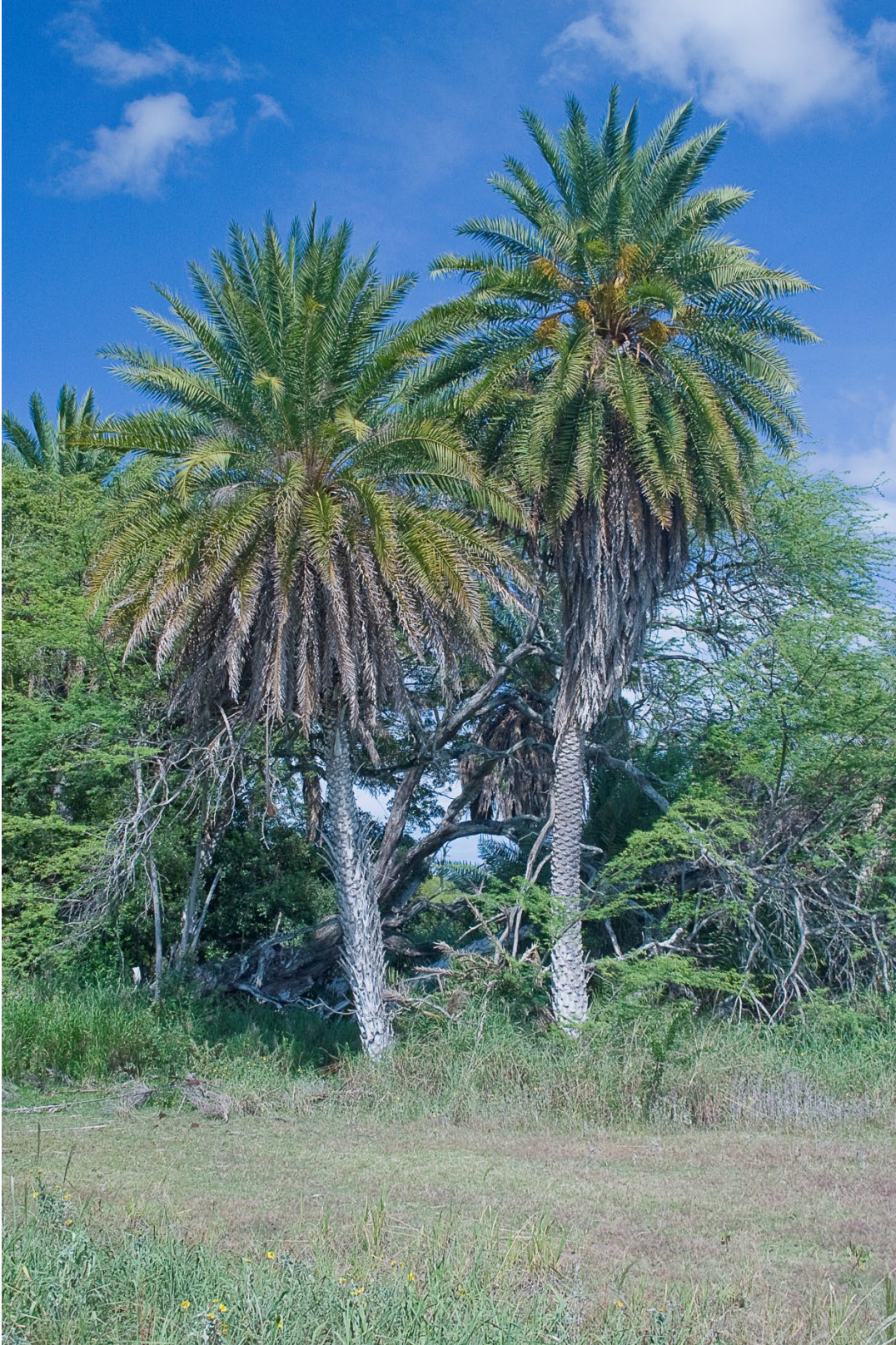
3. Wild date palms, Phoenix sylvestris (or a hybrid) naturalized at Hale'iwa, North Shore, O'ahu.