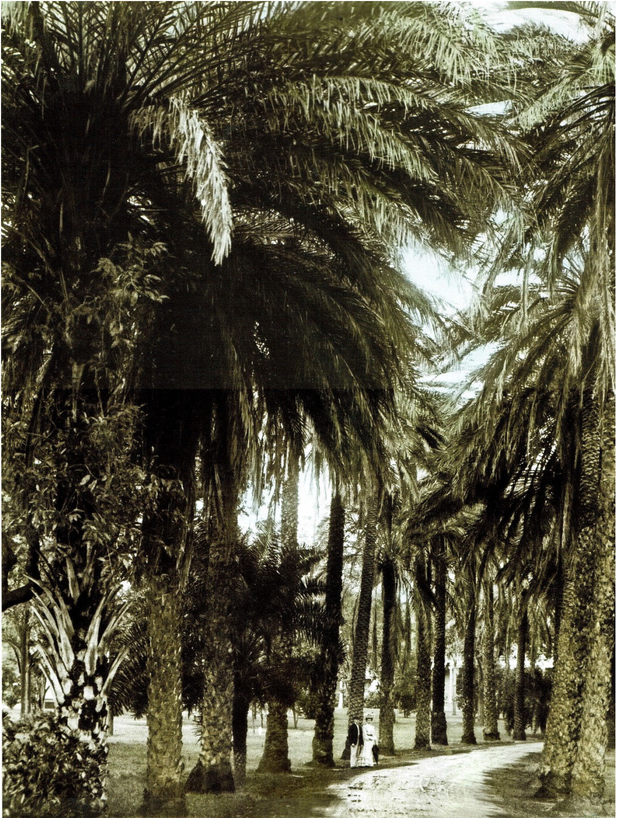
6. Date palms along driveway of the Queen's Hospital, circa 1885.