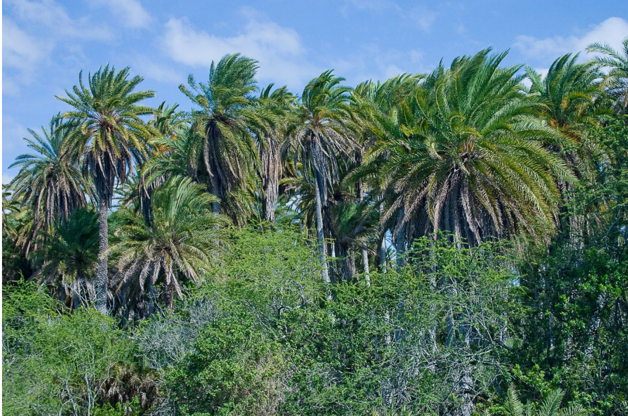
4. Wild date palms, Phoenix sylvestris (or a hybrid) naturalized at Hale'iwa, North Shore, O'ahu, where they can form impenetrable thickets.