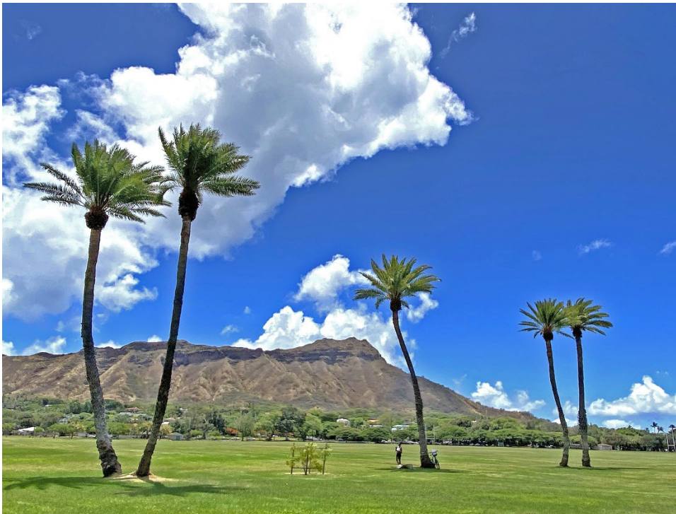
11. Photograph of same date palms in Figure 10 with a girl at the base, 2020.