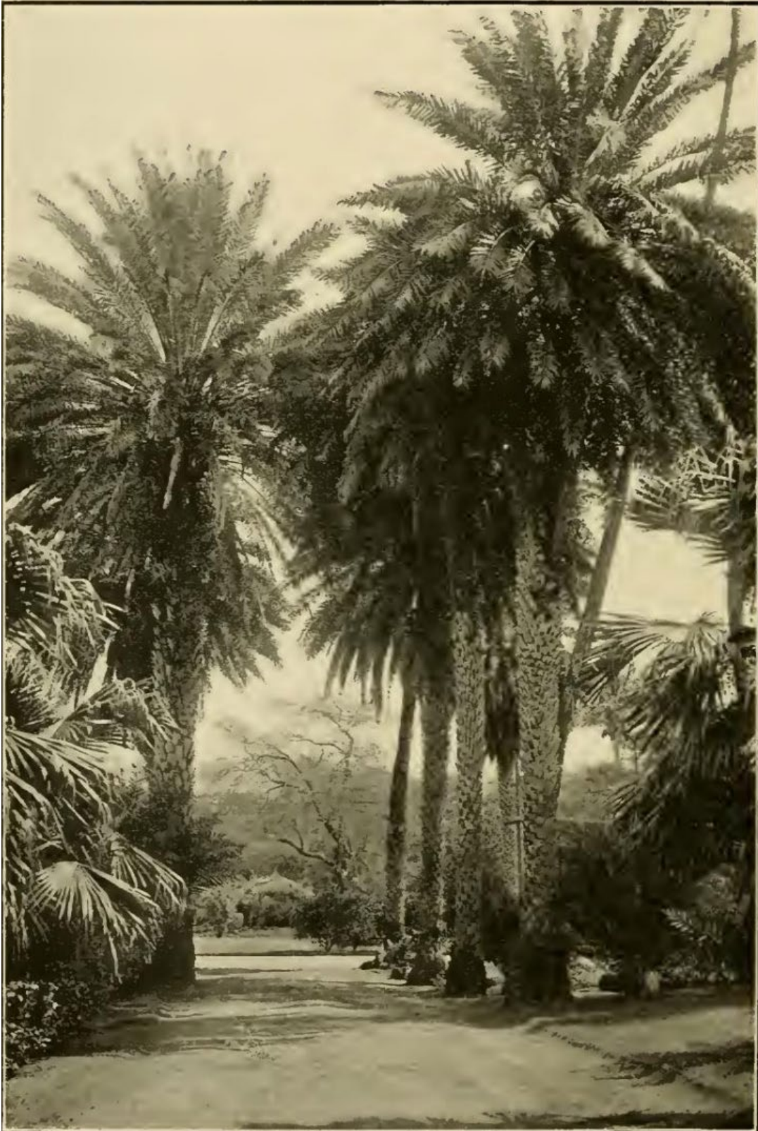
2. Date palms in Moanalua Gardens, Honolulu.