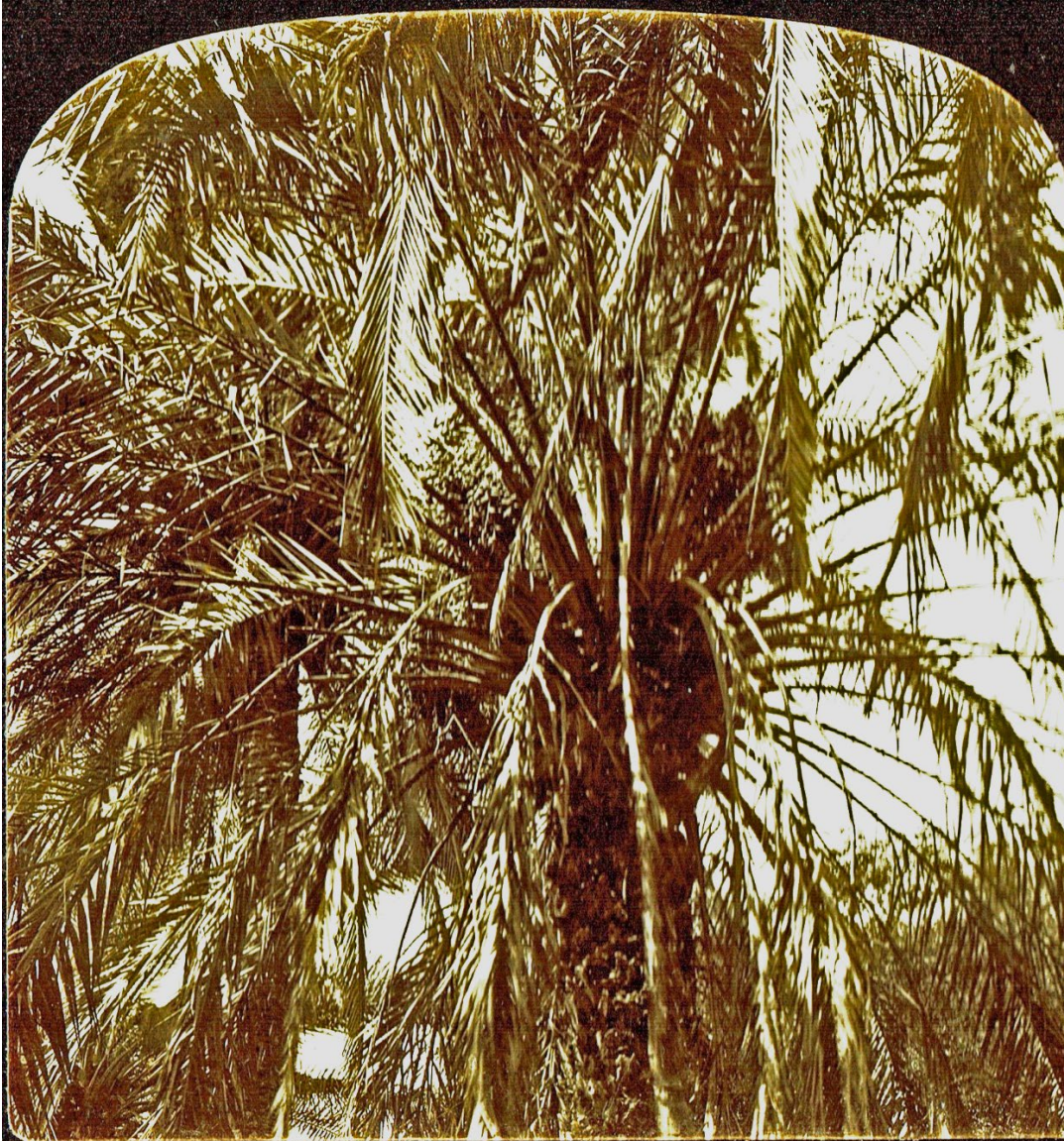
8. Date palm with ripening fruit, Hawaiian Islands. 1903.