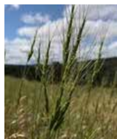
Barbed Goat Grass