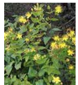
Canary Island St. John's Wort