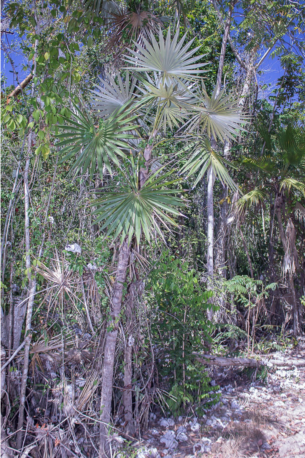
8. Coccothrinax acuminata in habitat on white sands, Guane, Pinar del Río, Cuba.