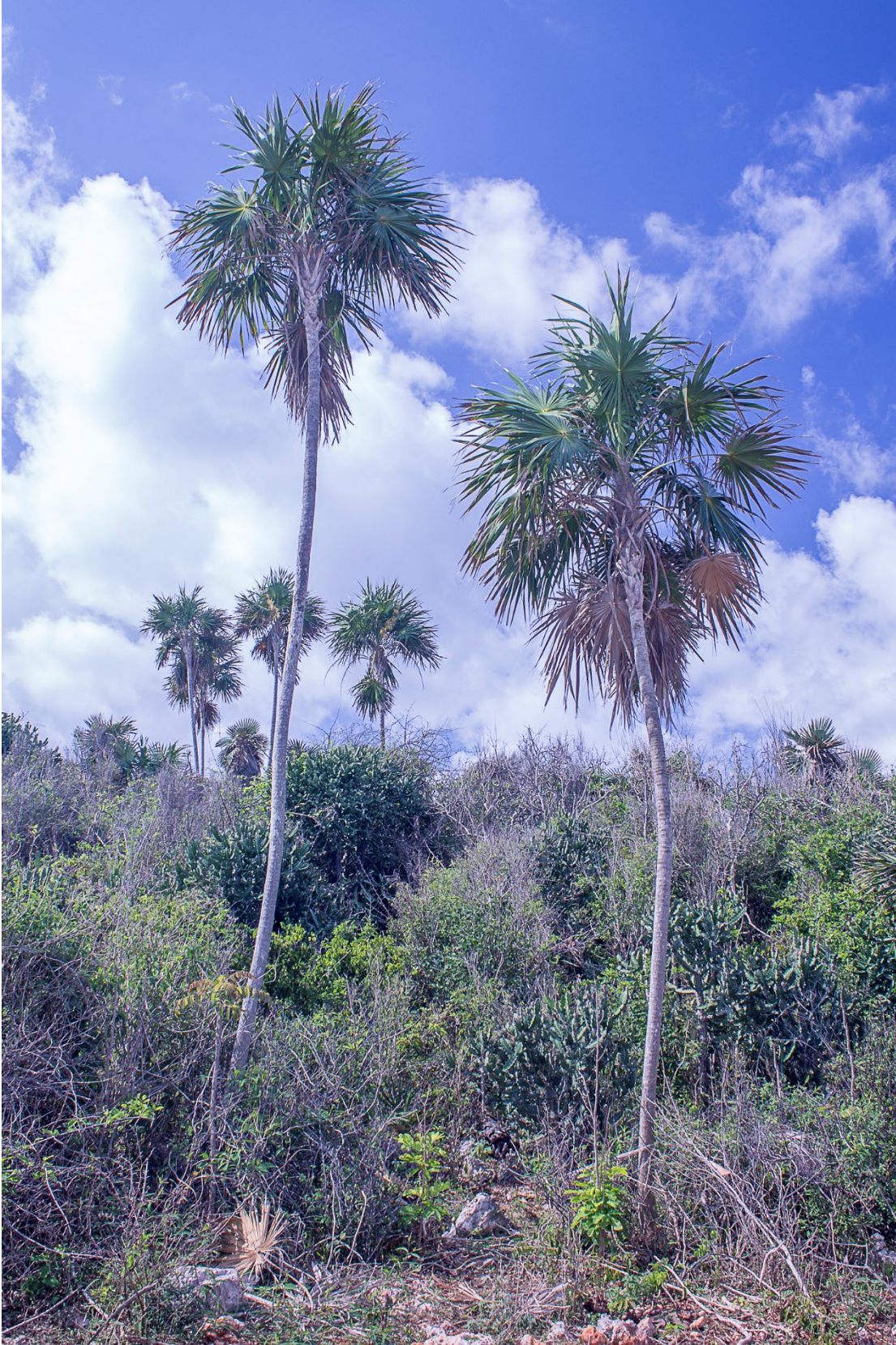
Fig. 20. Thrinax radiata in habitat, Matanzas, Cuba.