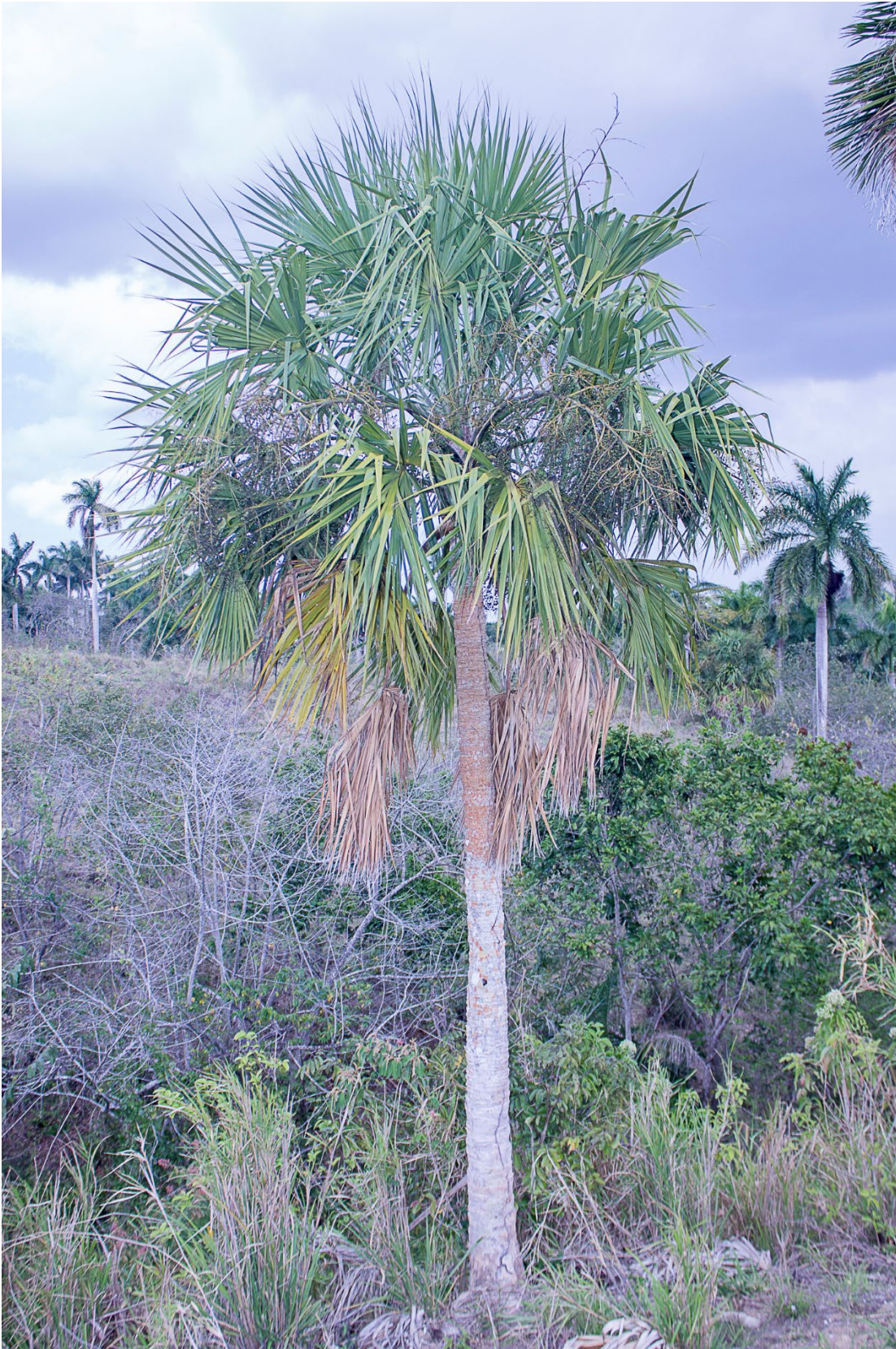
19. Sabal yapa in habitat, Bahía Honda, Artemisa, Cuba.