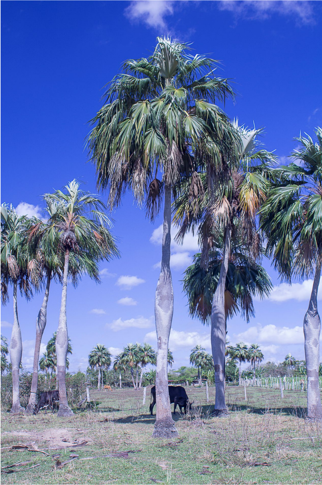
10. Coccothrinax wrightii in habitat, Pinar del Río, Cuba.