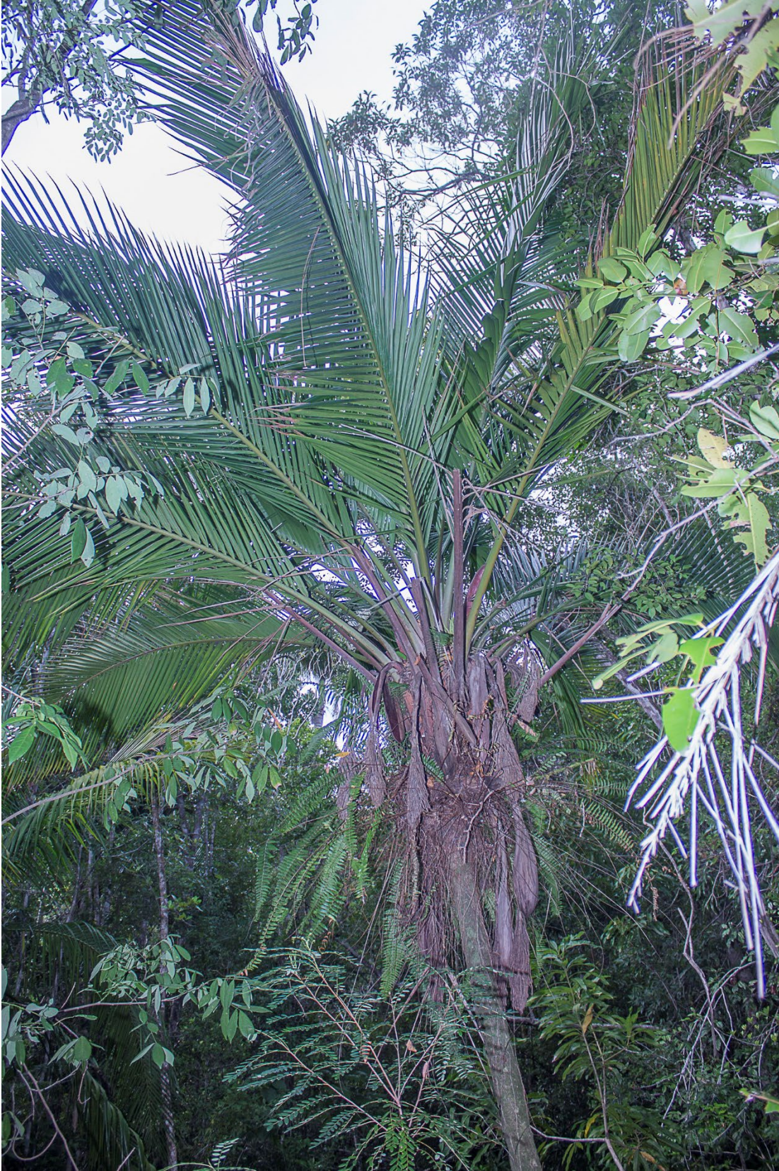
7. Calyptronoma plumeriana in habitat, Moa, Holguín, Cuba.