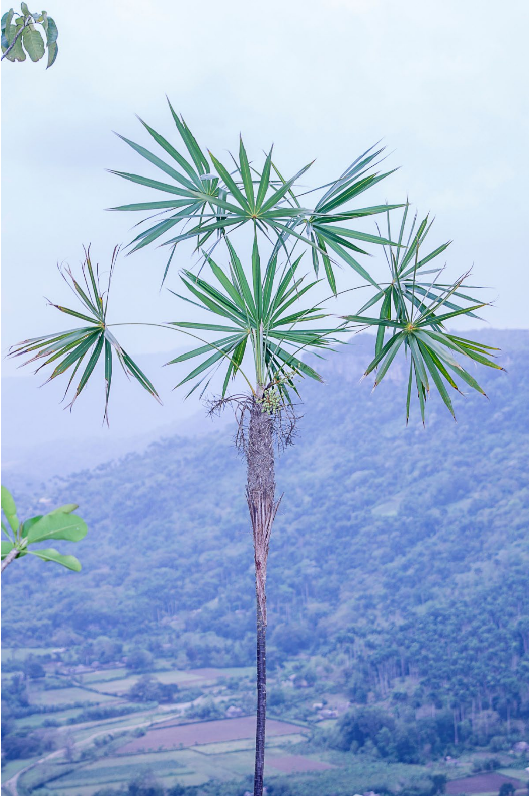
9. Old, fruiting Coccothrinax rigida in habitat at or near the type locality, Sagua de Tánamo, Holguín, Cuba.