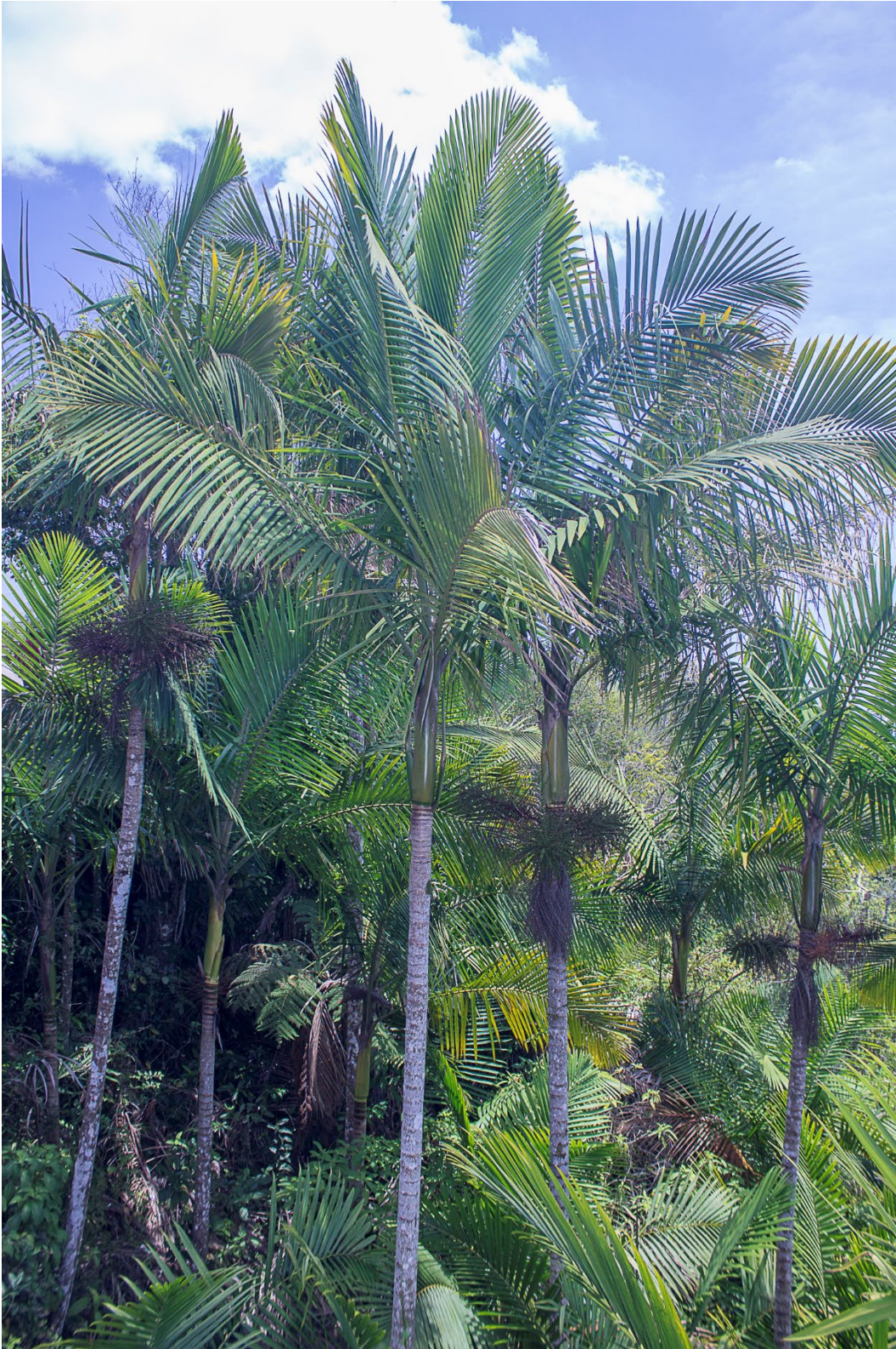
17. Fruiting Prestoea acuminata var. montana in habitat, la Gran Piedra, Santiago de Cuba, Cuba.