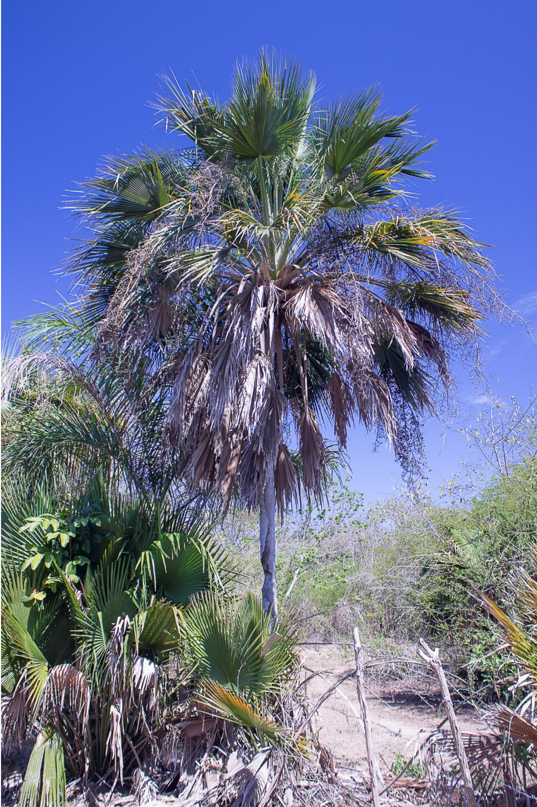
11. Mature Copernicia glabrescens in habitat, Pinar del Río, Cuba.