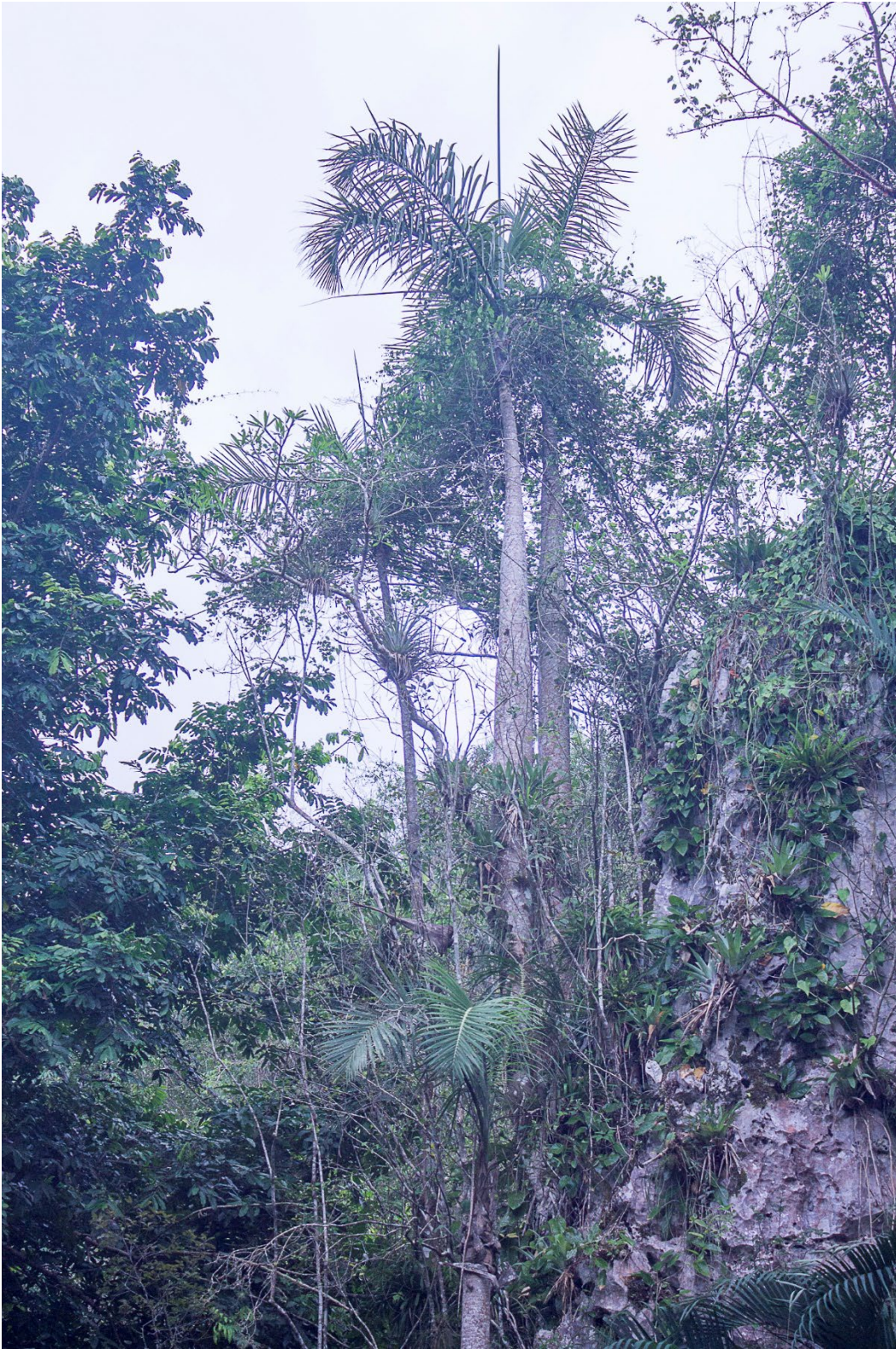
Fig. 14. Gaussia princeps on limestone habitat, Viñales, Pinar del Río, Cuba.