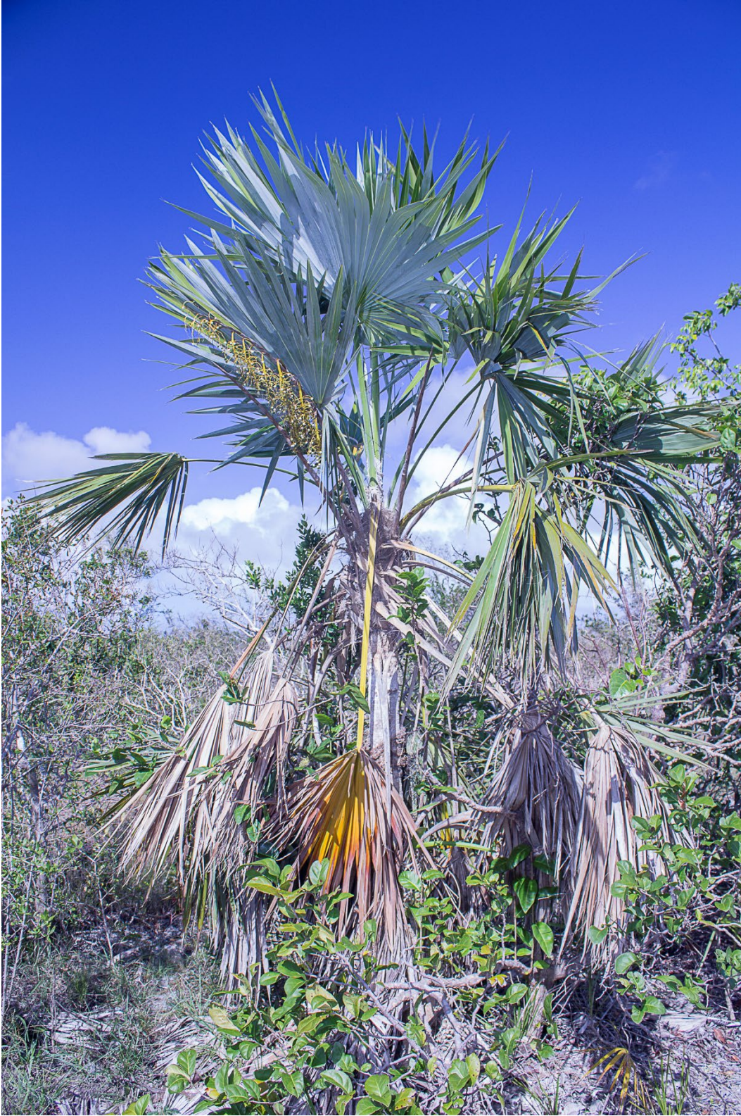
Fig. 16. Fruiting Leucothrinax morrisii in habitat, Cayo Romano, Camagüey, Cuba.