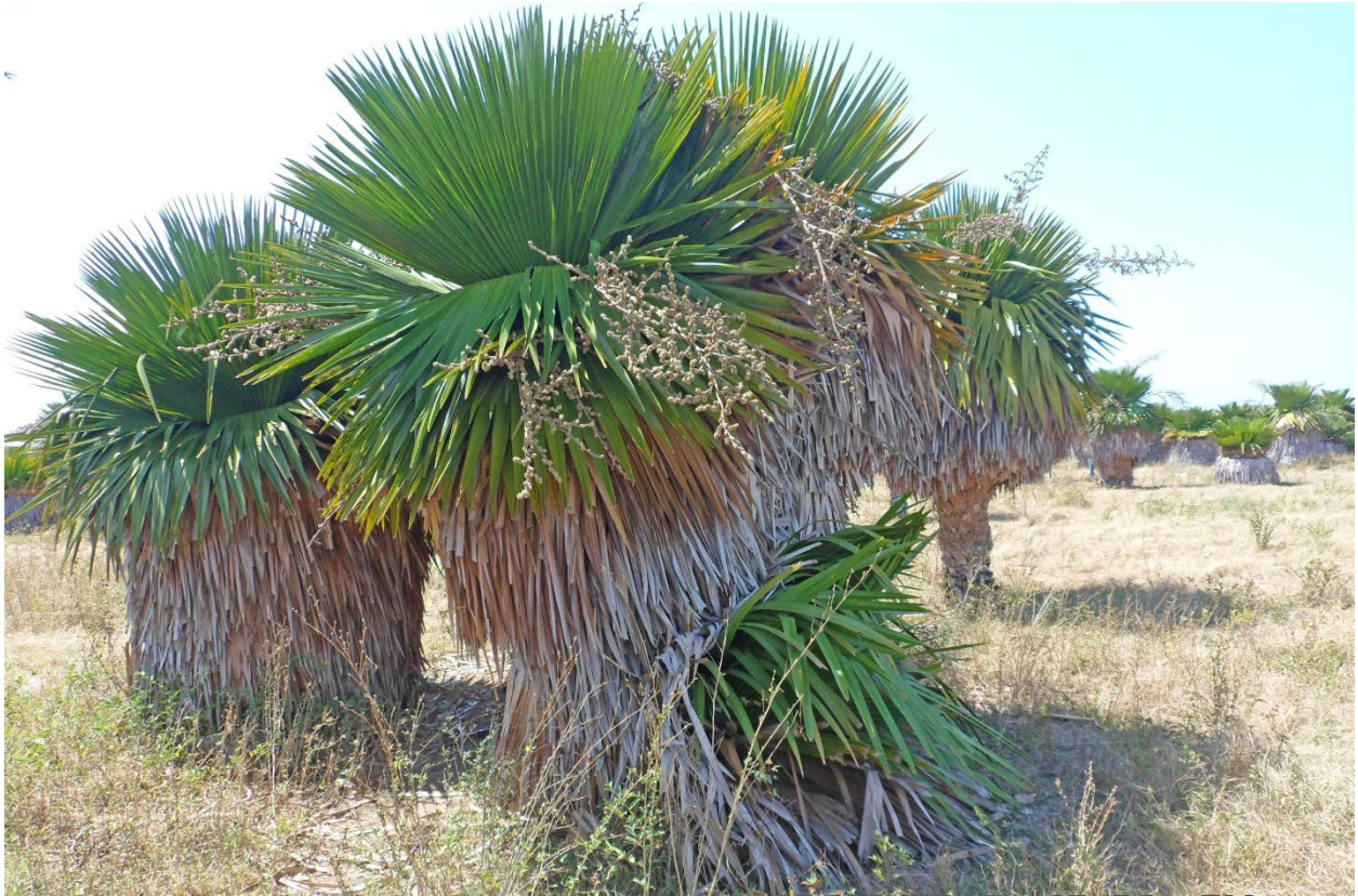
13. Mature Copernicia macroglossa in habitat, Potrero Manatí, Trinidad, Cuba.

Notes: Sauvalle (1871: 562) was the first to associate the name " Copernicia macroglossa Gris. & Wendl." with C. Wright 3966 , but as a nomen nudum.