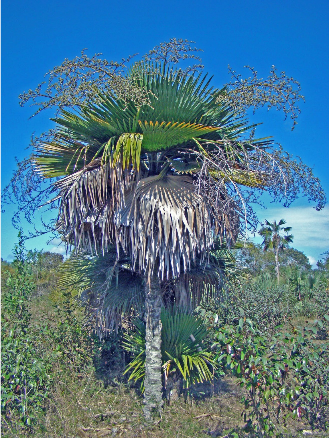
12. Flowering Copernicia × escarzana in habitat, La Pimienta, Cienfuegos, Cuba. The presence of a petiole shows it is a hybrid.