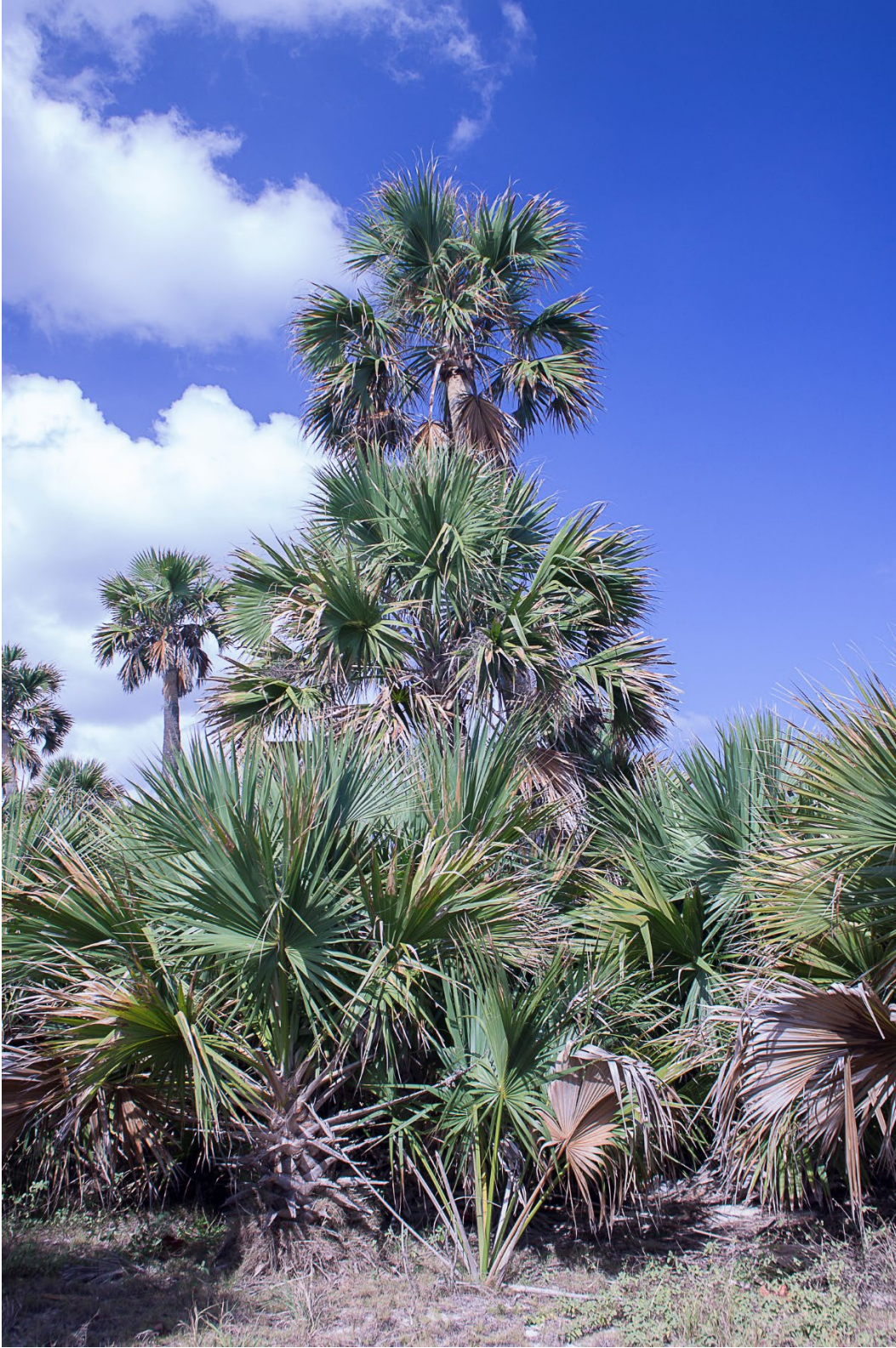
18. Sabal palmetto in habitat, Playa Santa María, Havana, Cuba.