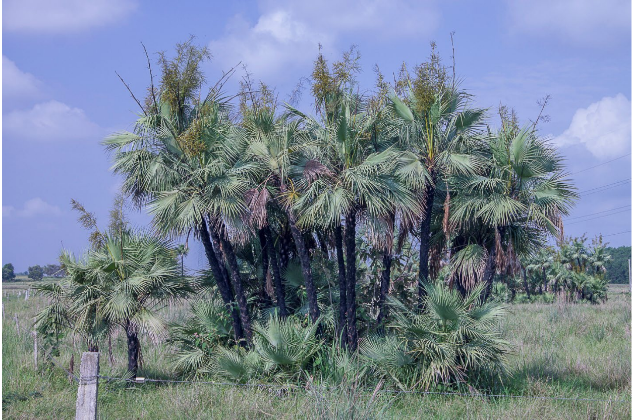
6. Flowering Acoelorrhaphe wrightii in habitat, La Barbarita, Pinar del Río, Cuba. Note the blackened trunks from periodic fire.

= Acoelorrhaphe arborescens (Sarg.) Becc., Webbia 2: 113. 1907. ≡ Serenoa arborescens Sarg., Bot. Gaz. 27: 90. 1899. ≡ Paurotis arborescens (Sarg.) O. F. Cook, Amer. Nat. 48: 314. 1914. [USA].