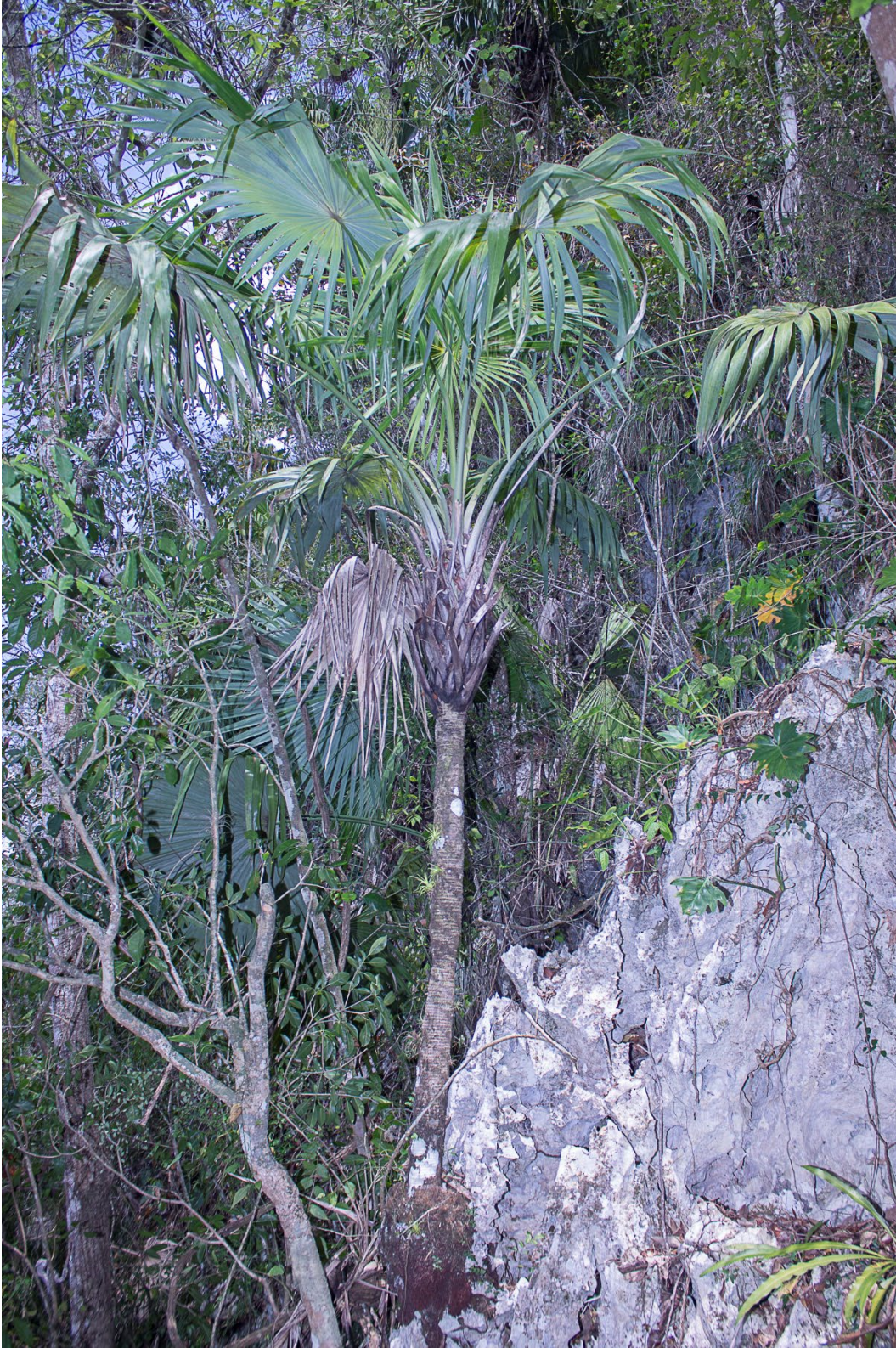
15. Hemithrinax compacta on limestone habitat, Mayarí, Holguín, Cuba.