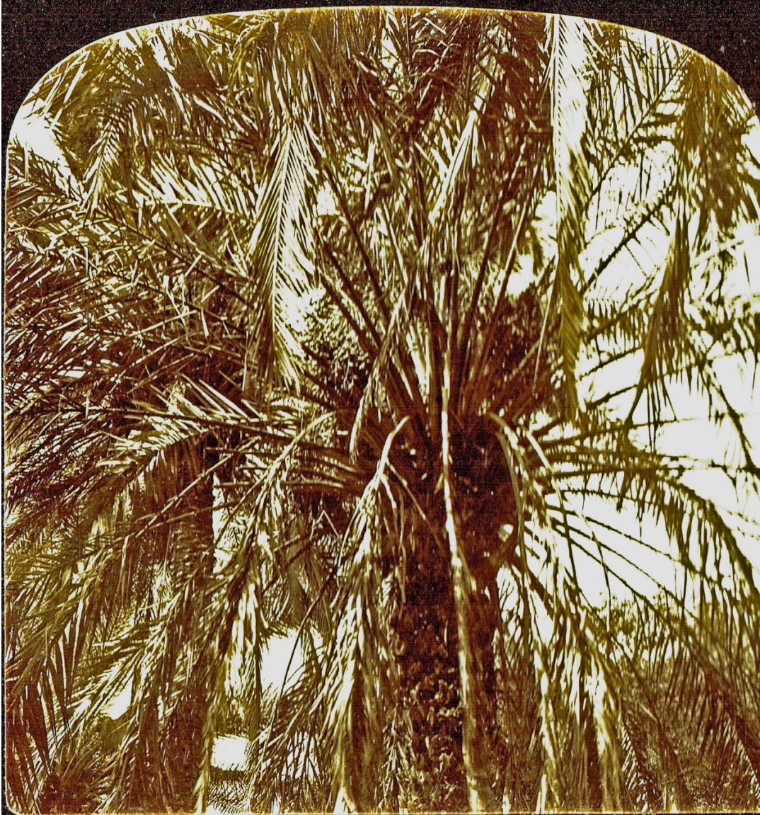
8. Date palm with ripening fruit, Hawaiian Islands. 1903.