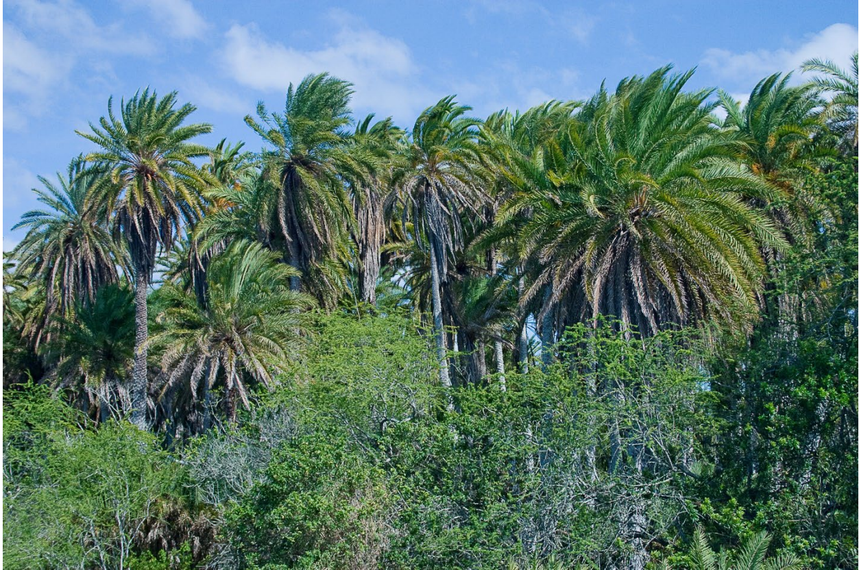
4. Wild date palms, Phoenix sylvestris (or a hybrid) naturalized at Hale'iwa, North Shore, O'ahu, where they can form impenetrable thickets.