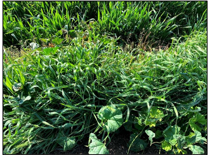
Figure 2. Edge of field where helicopter missed herbicide application. Cheeseweed, shepherd's-purse are present.

we returned to evaluate the chickweed for herbicide control. We found that tribenuron did reduce the chickweed growth relative to the untreated control, and there was a dose response where the 4X rate reduced the canopy more. We also observed that pyroxsulam did not reduce the chickweed canopy relative to the untreated control regardless of application rate (Figure 3). Based on our test we concluded that we could not rule out the possibility of ALS inhibitor herbicide resistance in common chickweed.