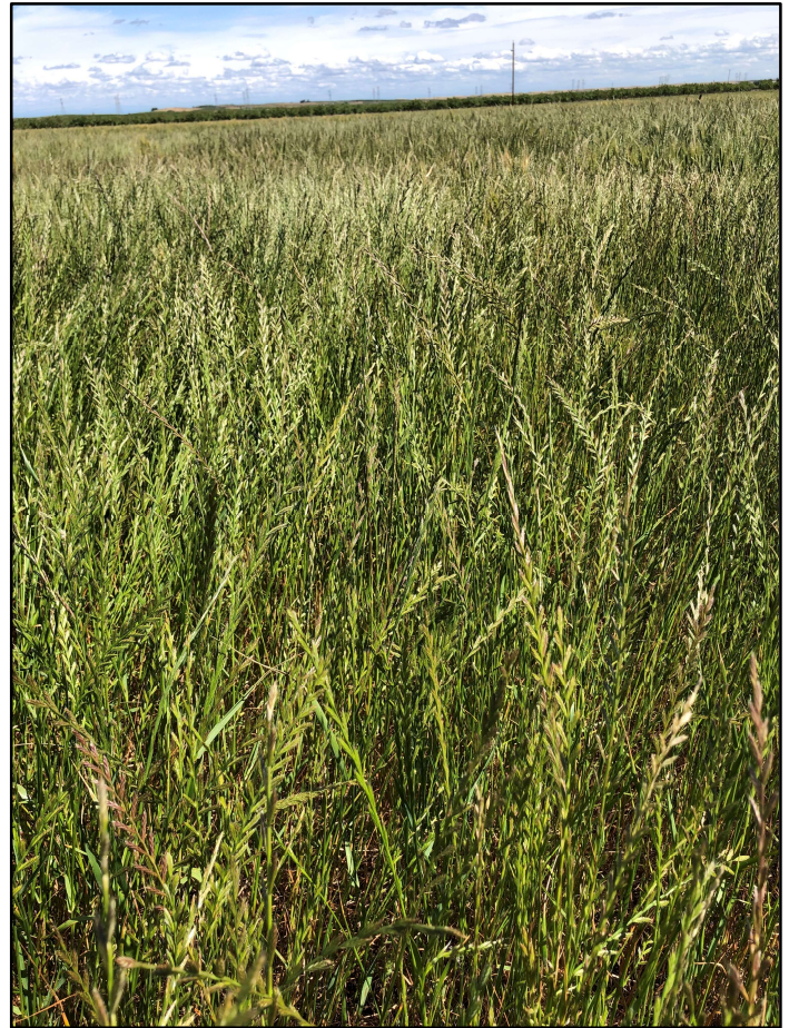
A ground view of heavy Italian ryegrass pressure after drought conditions reduced the efficacy of the Axial treatment in the 2021-2022 herbicide field trials.

On the other end of the timeline, harvest weed seed control (HWSC) may be useful in California. HWSC is a term for several practices that capture or destroy weed seed at harvest, before it can be returned to the