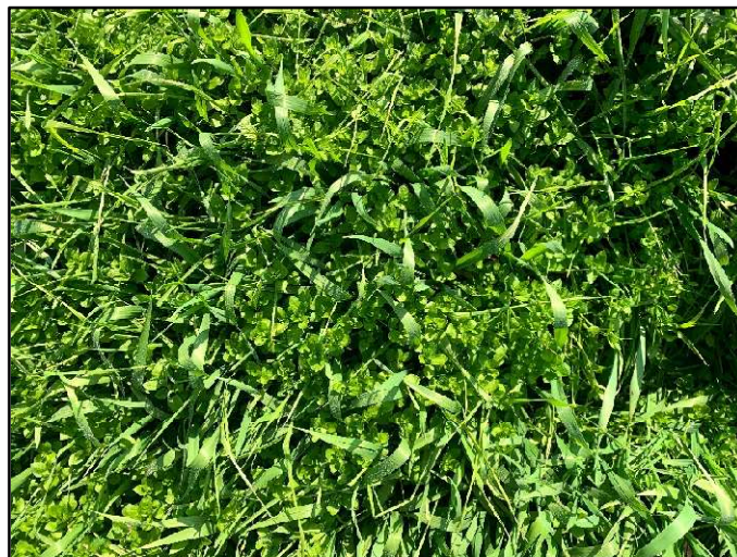
Figure 1. Common chickweed in small grain crop uncontrolled after ALS inhibitor herbicide application. Absent of other weeds.

With the help of former UCCE Weed Science Advisor, Jose Dias, we set up a replicated herbicide trial that included 2X and 4X applications of tribenuron and pyroxsulam with an untreated control for comparison. Four weeks after the application,