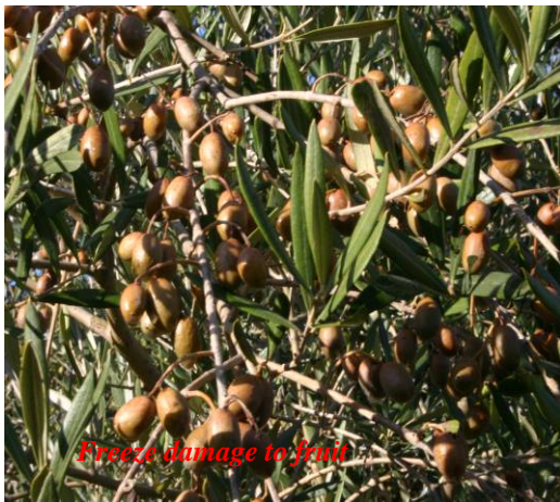
Freeze damage to fruit