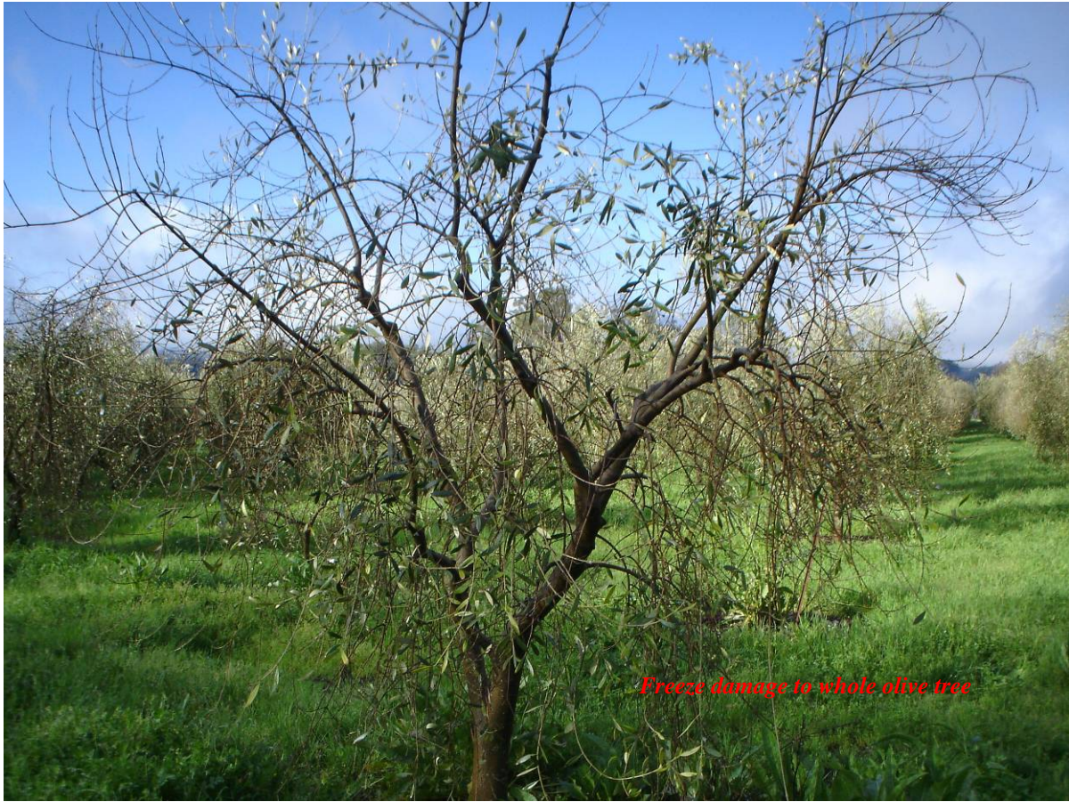
Freeze damage to whole olive tree