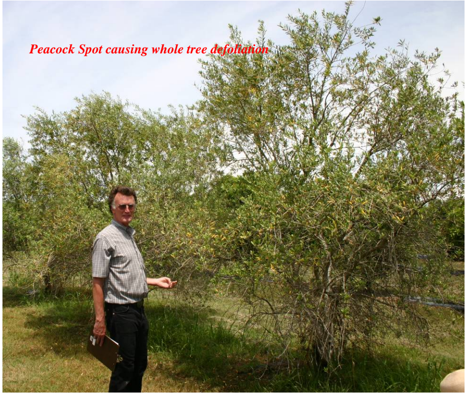
Peacock Spot causing whole tree defoliation