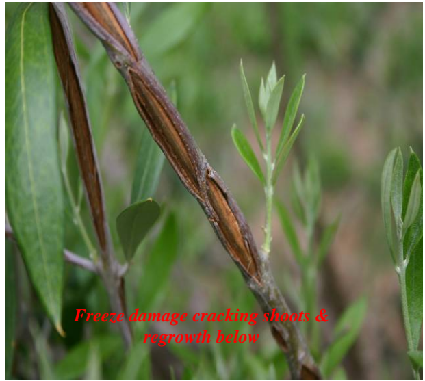
Freeze damage cracking shoots & regrowth below