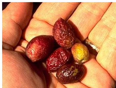
Shriveled frozen fruit