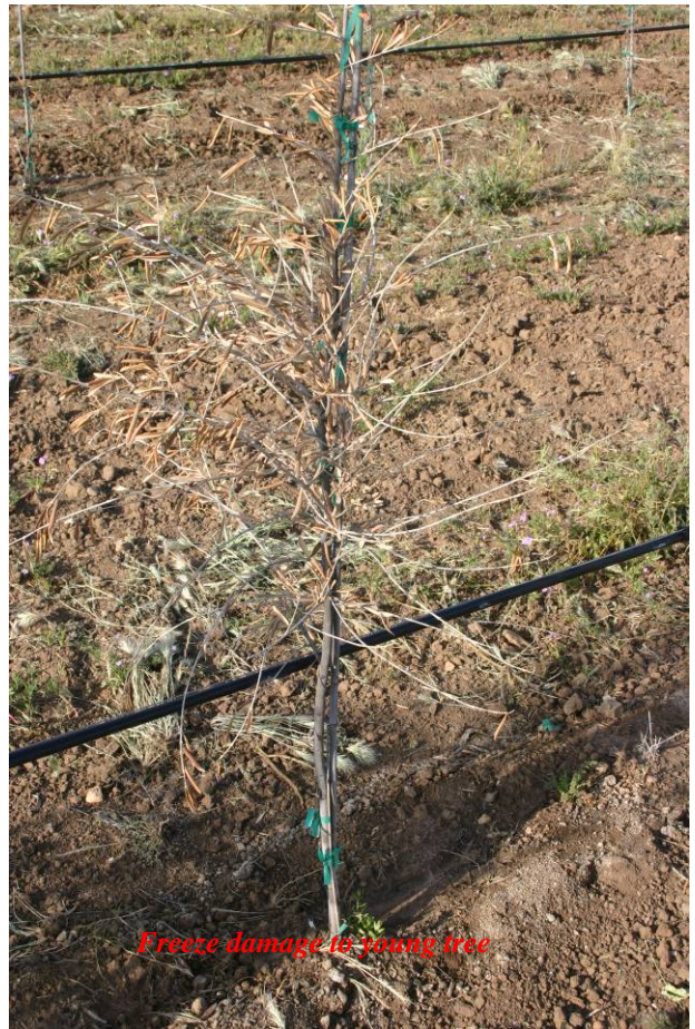
Freeze damage to young tree