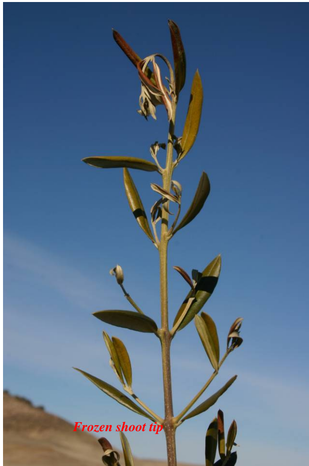
Frozen shoot tip