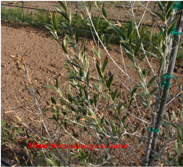
Minor freeze damage to leaves