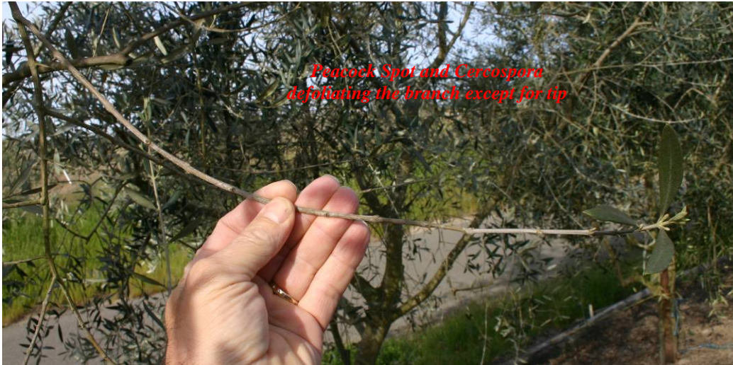
Peacock Spot and Cercospora defoliating the branch except for tip