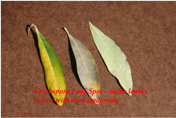
Cercospora Leaf Spot – turns leaves yellow with dark underside