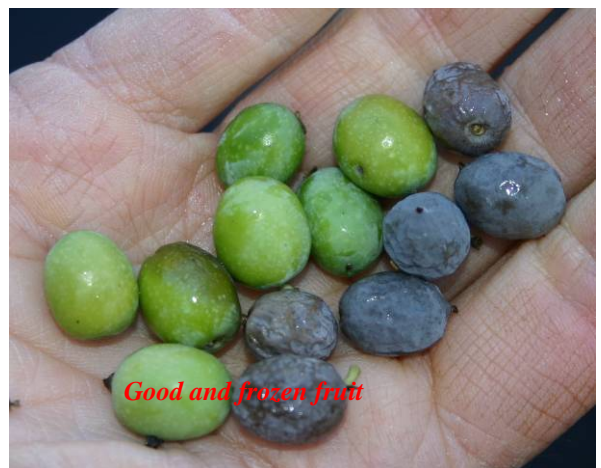
Good and frozen fruit