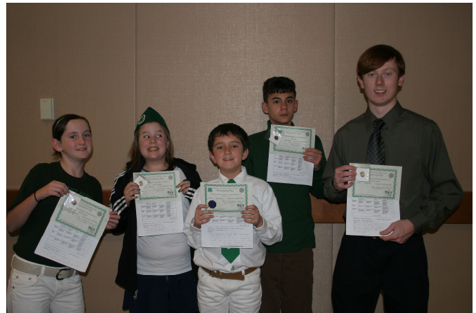
Presenters from 4-H Pleasant Acres Club