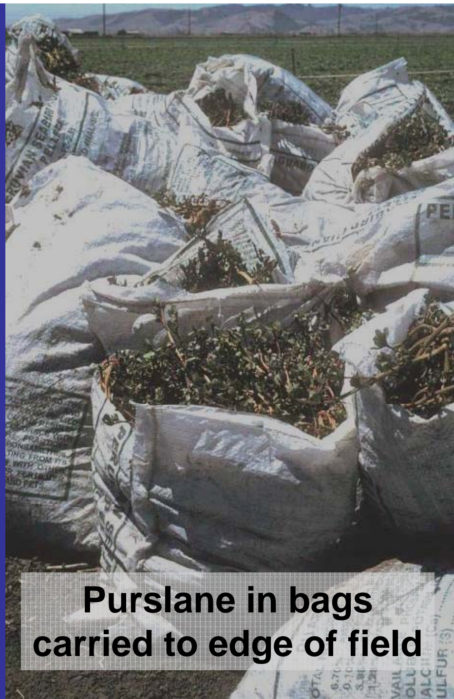
Purslane in bags carried to edge of field