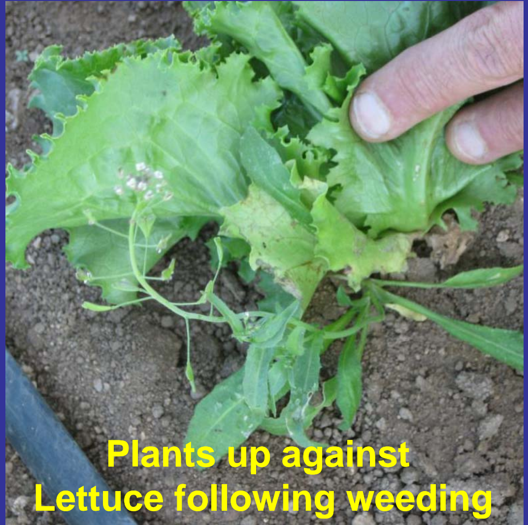
Plants up against Lettuce following weeding