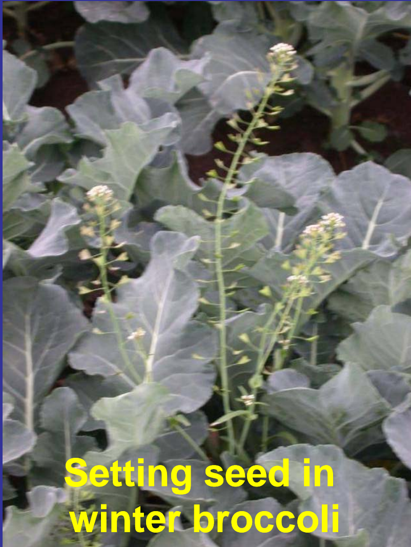
Setting seed in winter broccoli