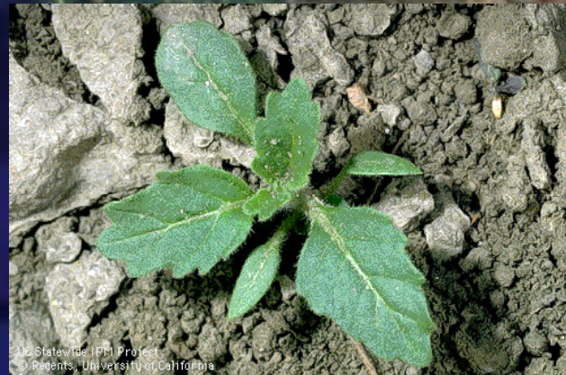
Hairy and Black Nightshade