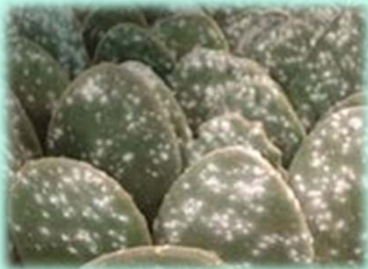
Cochineal scale - dye