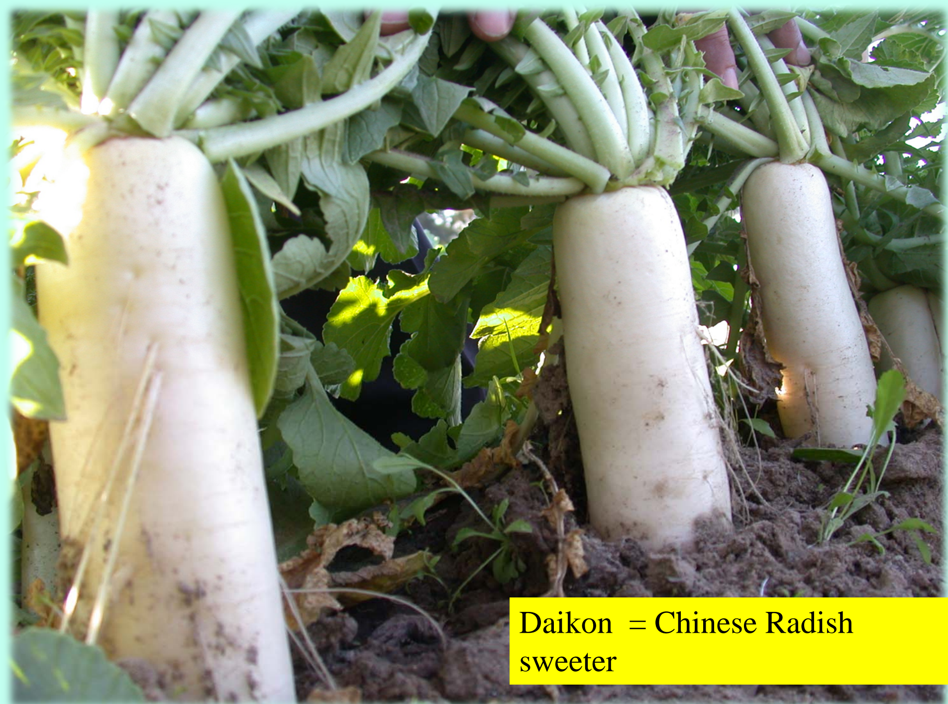
Daikon = Chinese Radish sweeter