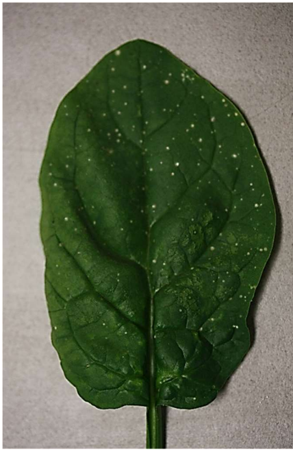
Fine, evenly-distributed pattern of herbicide spray drift; sometimes only the tips of some leaves are affected as they are protected by an upper leaf.