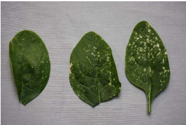
Fine, evenly-distributed pattern of herbicide drift