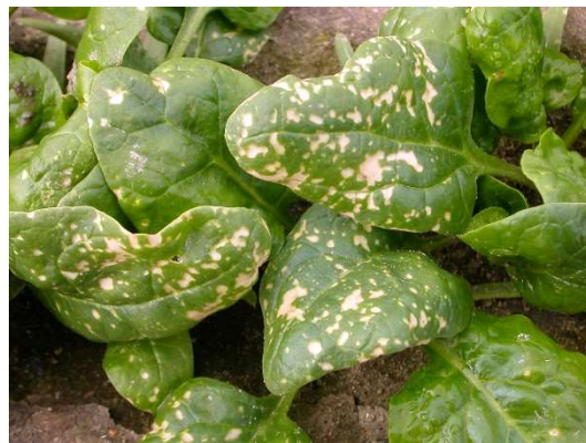
Heavy, blotchy distribution of herbicide