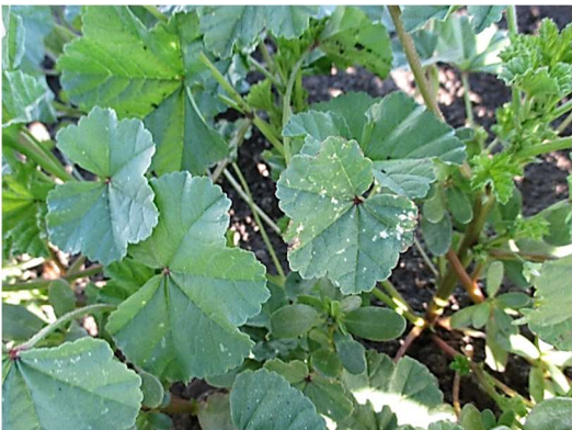
The weeds often show spotting from herbicide burn as well