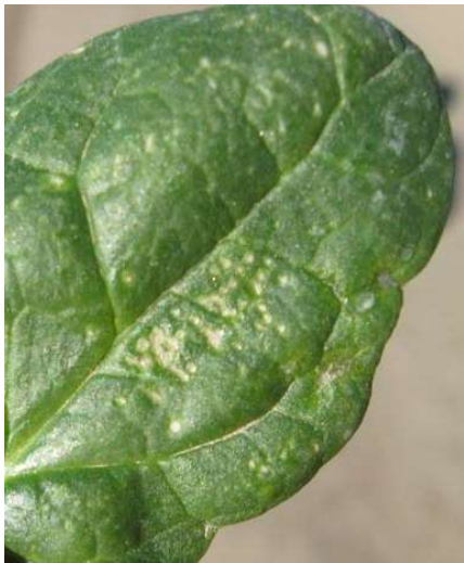
Stippling on a spinach leaf from leafminer feeding

( http://ipm.ucanr.edu/PMG/r732100311.html ); Anthracnose lesions start as dark green water-soaked lesions that later turn tan with black fruiting bodies in the center (can be observed with a good hand lens, http://ipm.ucanr.edu/PMG/r732100211.html ); Stemphylium causes circular lesions, but no fungal fruiting bodies or mycelia occur in the lesions making it difficult to distinguish this disease from abiotic causes ( http://ipm.ucanr.edu/PMG/r732100411.html ).