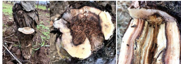
Figure 2. In mature plants, several basidiomycetes fungi (primarily in the genera Fomitiporia , Fomitiporella , Inocutis , Inonotus , and Phellinus ) play also a role in disease and symptoms development. Characteristic symptoms are a white rot in the vascular system in many occasions observed as a yellowish-spongy wood.