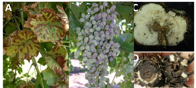
Figure 1. Leaf (tiger stripes) (A), fruit (black measles) (B) and vascular (C) symptoms caused by esca disease complex. Esca (black measles) and petri disease are primarily caused by the vascular pathogens Phaeoamoniella chlamydospora and Phaeoacremonium minimum , which are also involved in Petri disease in young plants (D).