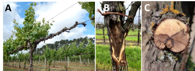
Figure 3. Botryosphaeria dieback, commonly known in California as 'Bot canker' is caused by multiple species in the Botryosphaeriaceae family. Characteristic symptoms are the lack of spring growth of infected areas, including cordons (A) or spurs (B). Cross sections of infected parts reveal a wedge-shape canker (C). The GTD disease known as Phomopsis dieback and primarily caused by the fungus Phomopsis viticola shows very similar symptoms as Botryosphaeria dieback.