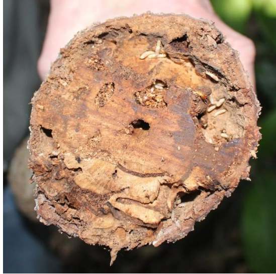
Figure 2. Infested 'Reed' branch in later stages of decline. The white larvae are termites. Once the branch begins to dieback, termite infestation usually follows. Note the staining of the wood and evidence of the PHSB galleries.