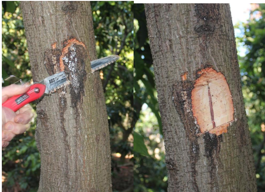
Figure 3. External symptoms of infestation including sugar exudate and bark darkening reveals wood staining due to Fusarium infection of the woody tissue.