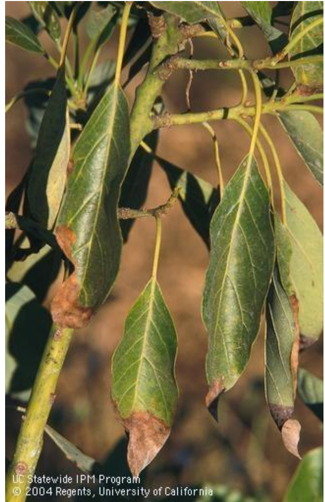
Salt damage due to lack of leaching

Winter irrigation is something we do not commonly perform, but in low rainfall years it is an activity we need to consider, especially for controlling the salts that accumulate from our previous irrigation season.