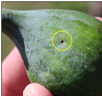
Figure 3. Exit hole from larva burrowing out of the fruit.