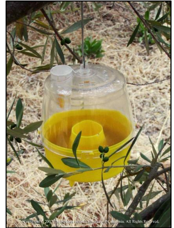
Figure 5. McPhail-type trap.

Management: Biological control appears to be limited and there are currently no chemical controls registered specifically for this pest on California figs. As such, orchard sanitation is critical, and growers should make sure to remove and destroy any BFF-infested fruits. Larvae in infested fruit are protected from pesticide sprays and there are no effective soil drenches for pupal control. Insecticidal baits (e.g. GF-120 NF Naturallyte®) may be useful for control of adult BFF but note that label rates have not been directly tested for efficacy against this pest. Consult with a licensed pest control adviser and your County Agricultural Commissioner before applying any chemical controls.