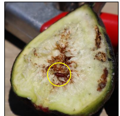
Figure 4. BFF pupa found inside of a fig.