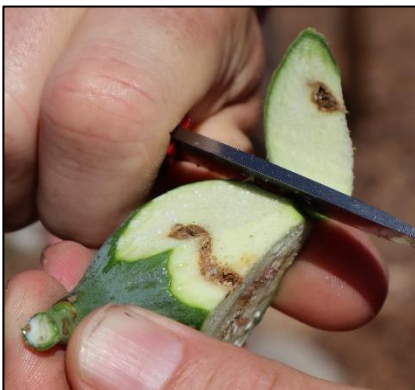
Figure 2. Internal damage to the fig from larval feeding.

Life Cycle: The BFF only attacks figs and prefers unripe and unfertilized fruits. The adult female deposits eggs into the fruit through the ostiole (Figure 1) and larvae subsequently feed internally on the fruit (Figure 2). This feeding damages the fruit and causes it to prematurely drop from the tree. Upon completion of development, the BFF larvae make their way out of the fruit (Figure 3), drop to the soil and pupate. In some cases, BFF pupae have been recovered inside of fruits as well (Figure 4). Black fig flies overwinter as pupae in the soil. In the spring they emerge, mate and begin to attack figs. The BFF can have between 4 to 6 generations per year (more in warmer areas, fewer in cooler areas).