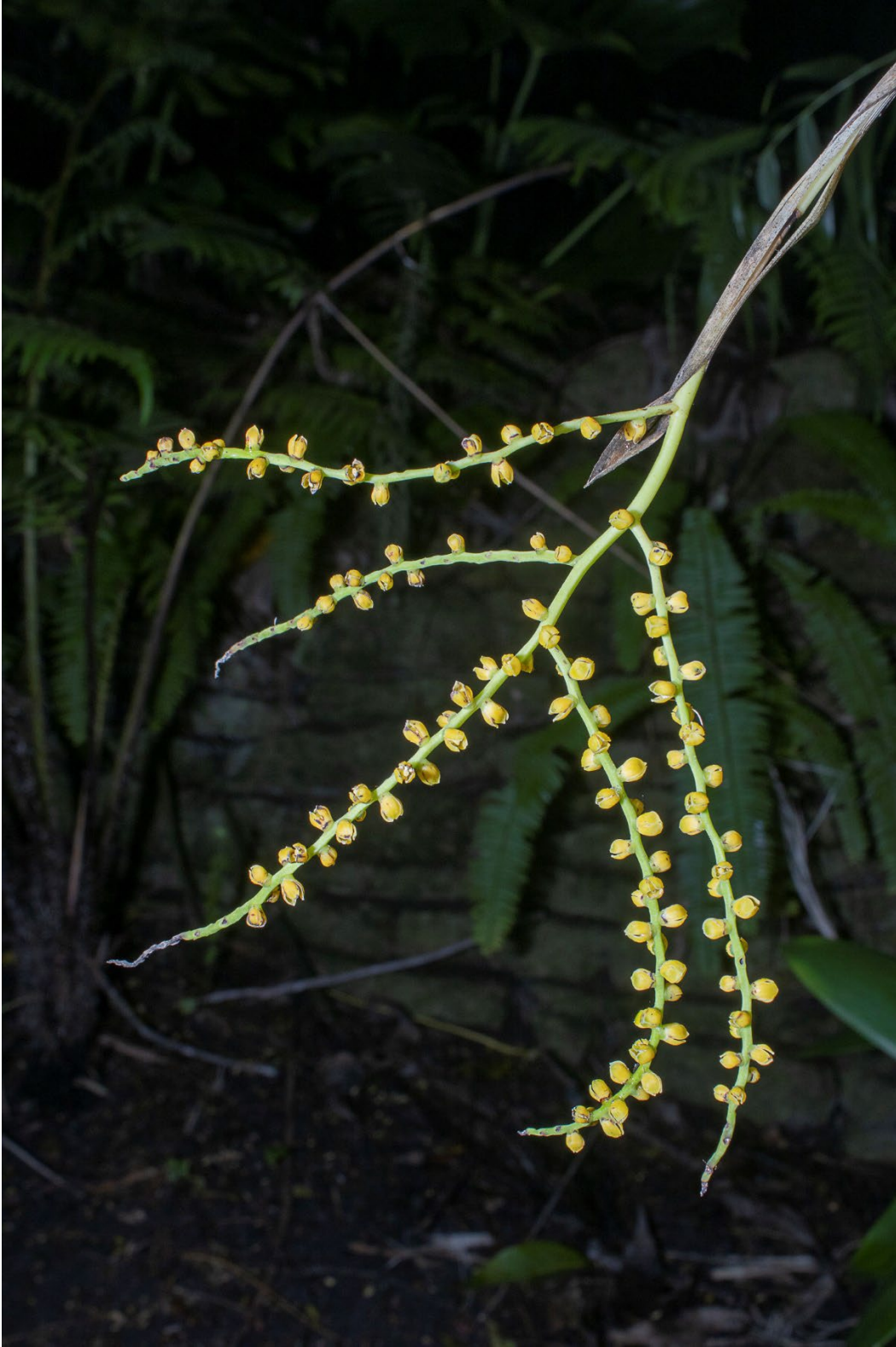
13. Staminate inflorescences of Chamaedorea delicata are longer and typically have 2–7, ascending to spreading rachillae. Hodel et al. 4035.