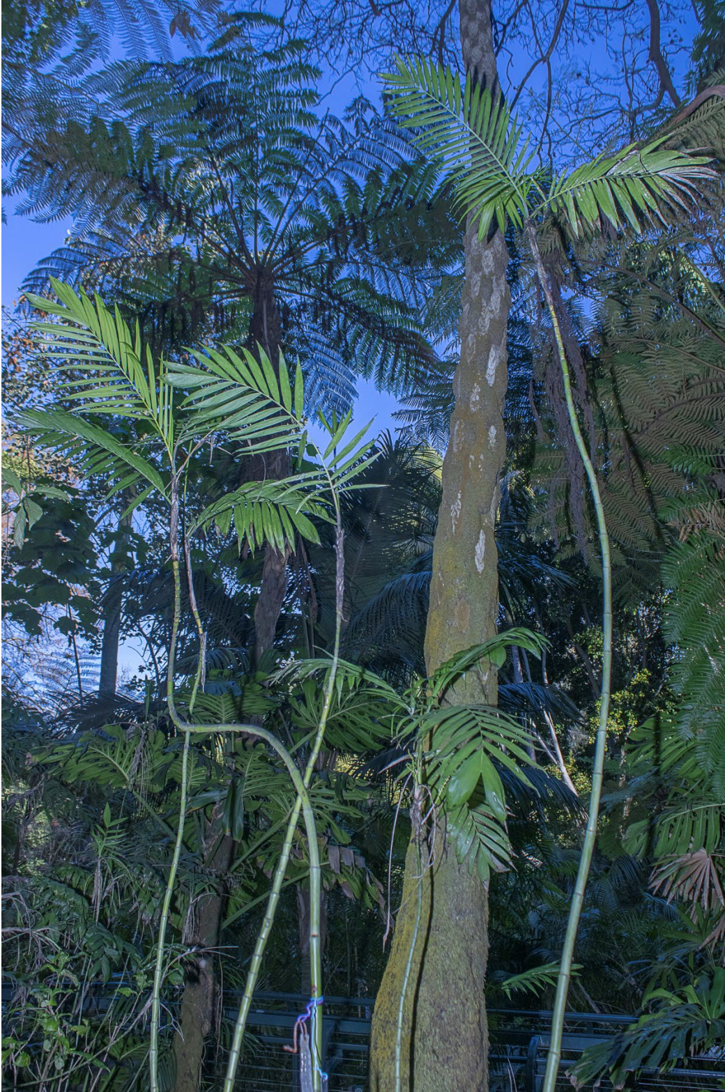
3. Chamaedorea delicata , habit, Hodel et al. 4037.