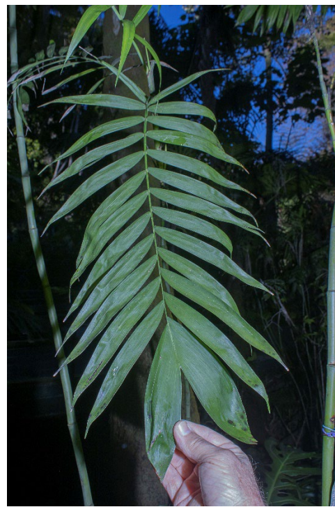
8–9. Leaf blades and pinnae of Chamaedorea delicata . 8. Hodel et al. 4035. 9. Hodel et al. 4037.