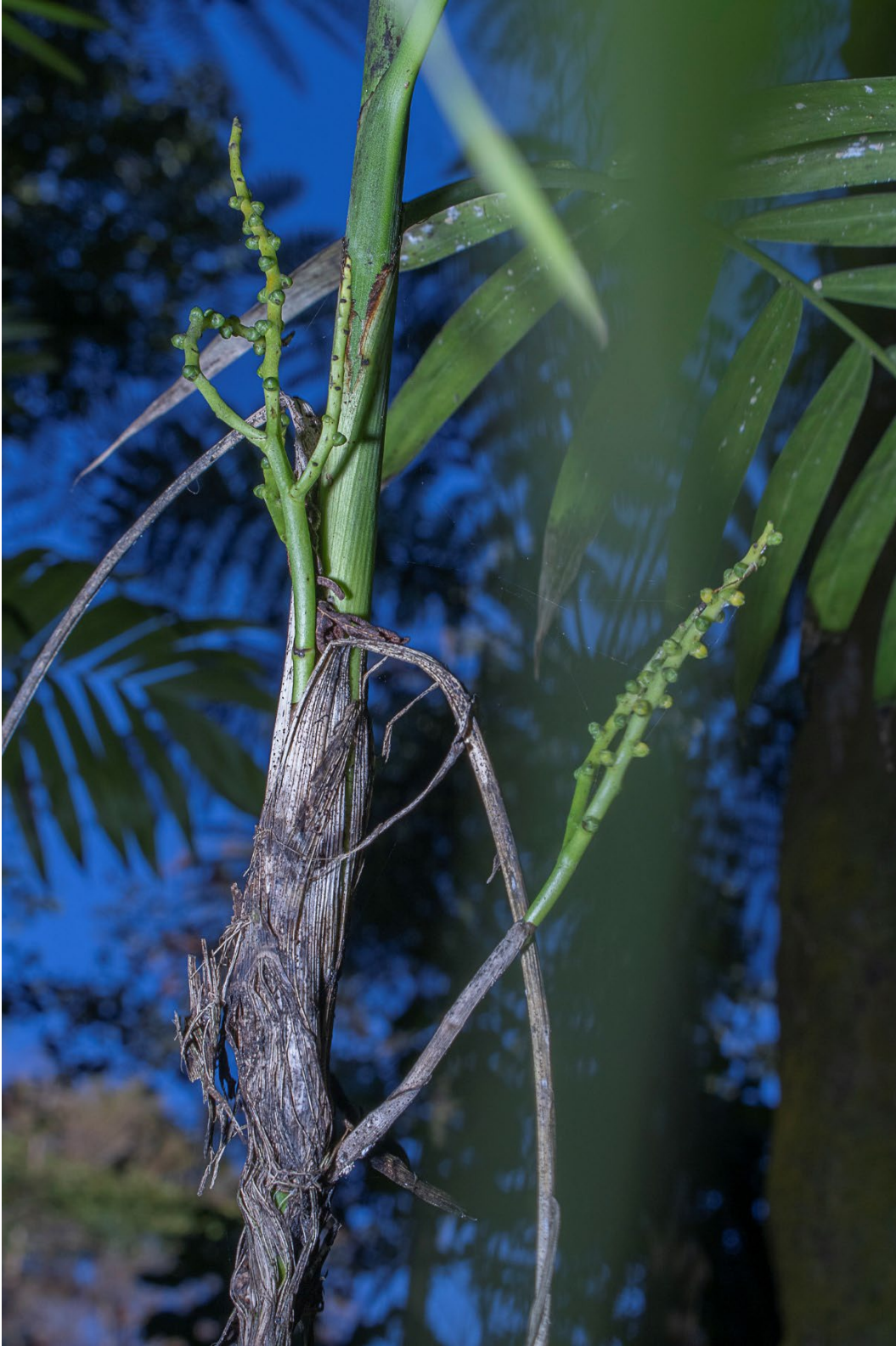
14. Pistillate inflorescences of Chamaedorea delicata are smaller and few-branched with stiffly parallel rachillae. Hodel et al. 4037.