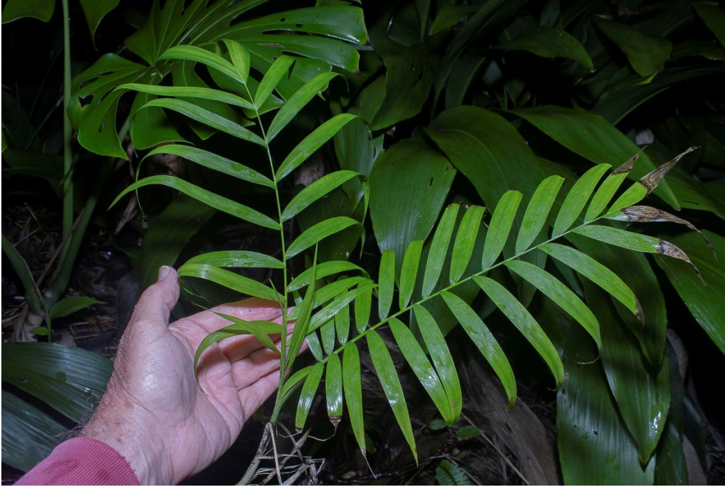
7. Leaf blades of Chamaedorea delicata are pinnate and typically with 15 or fewer per each side of the blade. Hodel et al. 4039.