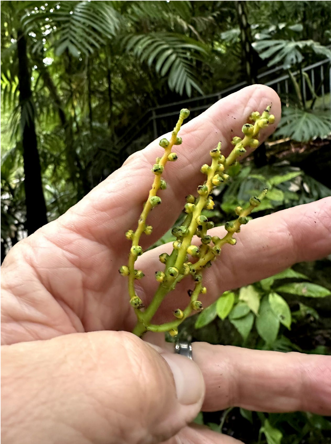
15. Pistillate inflorescences of Chamaedorea delicata are shorter with 2–4, stiff, ascending, parallel rachillae. Pistillate flowers just past anthesis have a green calyx and yellow petals. Hodel et al. 4037.