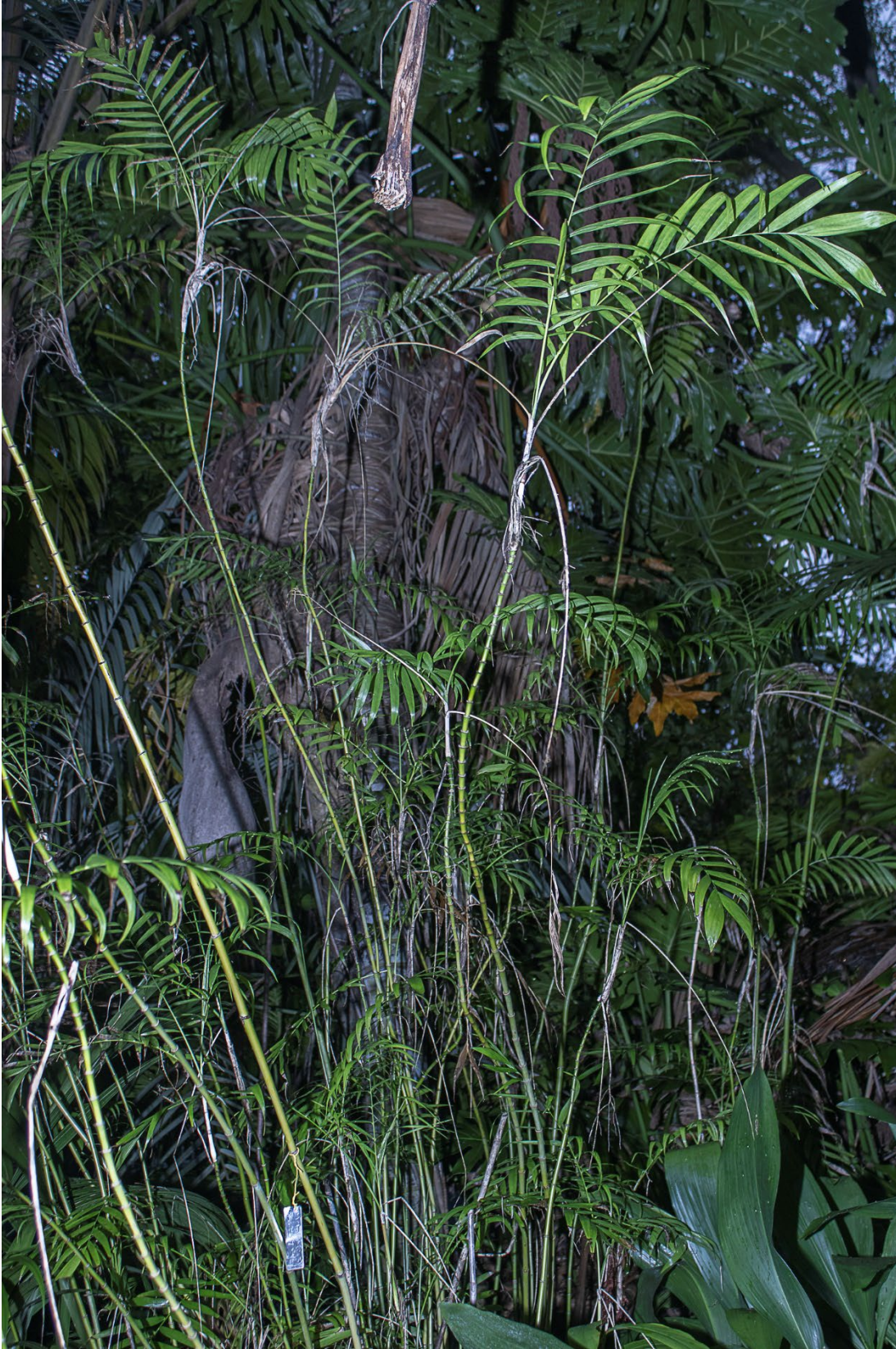
4. Chamaedorea delicata , habit, Hodel et al. 4039.