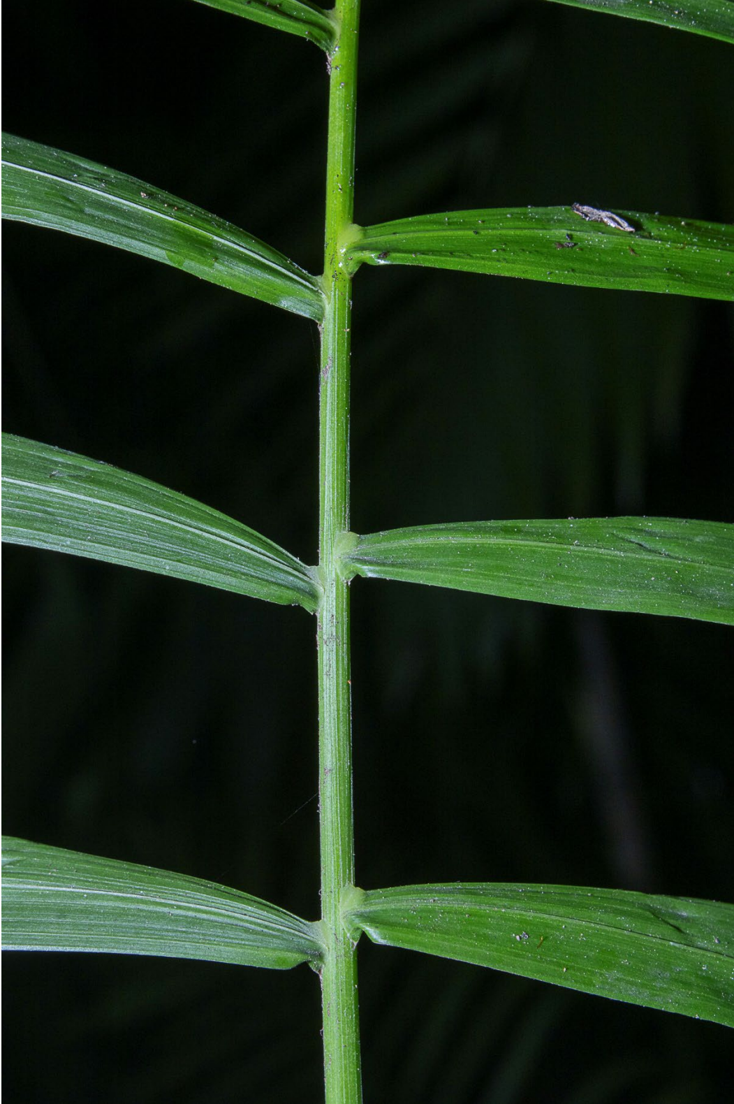
10. Small, hard “knot” adaxially at attachment of pinnae to the rachis of Chamaedorea delicata . Hodel et al. 4035.