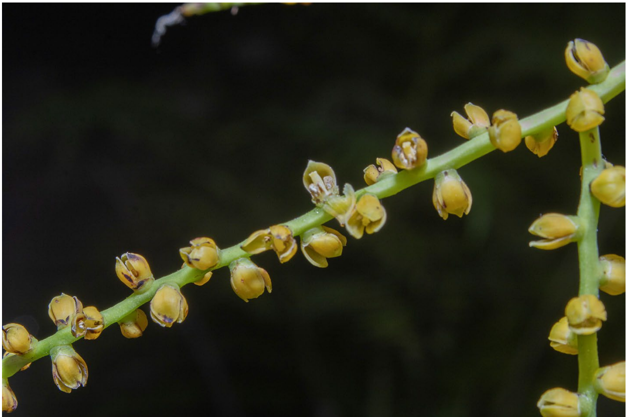
16. Staminate flowers of Chamaedorea delicata have a white to clear-colored pistillode shorter than the petals. Hodel et al. 4035.

Flowers: staminate flowers in 2 spiraling rows 2–4 mm distant, 3–6 mm distant within a row, in bud 2.5–3 × 2 mm, green, calyx light to gray-green, 1/2 as high as corolla, latter dark green; at anthesis, 5 × 3.5 mm, yellow ( Fig. 16 ), aromatic; calyx 1 × 2 mm, green, 3-lobed, sepals imbricate and/or connate in proximal 1/2–2/3, broadly rounded apically, margins light colored; petals 4 × 2.5–3 mm, broadly ovate, valvate, spreading slightly apically, yellow, tips acute and erect; stamens 2 mm high, tightly arranged around and shorter than pistillode, filaments 1.5 mm high, anthers 1 × 1 mm; pistillode 3 × 0.8 mm, columnar, tip truncate, clear- to white-colored, shorter than petals; pistillate flowers 2–5 mm distant proximally, 2 mm distant distally, just prior to anthesis 2 × 2 mm, greenish; calyx 0.7 × 2 mm, 1/3 as high as corolla, cupular, dark green, sepals imbricate in basal 3/5, broadly rounded apically and free; petals 2 × 2 mm, broadly ovate, imbricate in basal 3/5, broadly rounded apically and briefly free with an acute, erect tip, light green; gynoecium 1.8 × 2 mm, black; pistillate flowers just past anthesis larger, 3 × 3 mm ( Fig. 15 ); calyx 1 × 2.75 mm, green; petals 3 × 3 mm yellow; gynoecium 3 × 3 mm, depressed ovoid, green, stigma lobes short, barely discernable, exceeding petals.