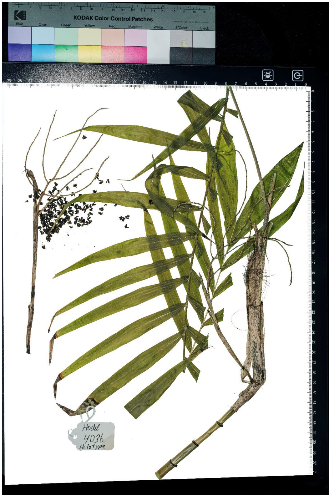
1. Chamaedorea delicata , Hodel et al. 4036, Holotype (LASCA). Petals of yellow staminate flowers turn black when dried.