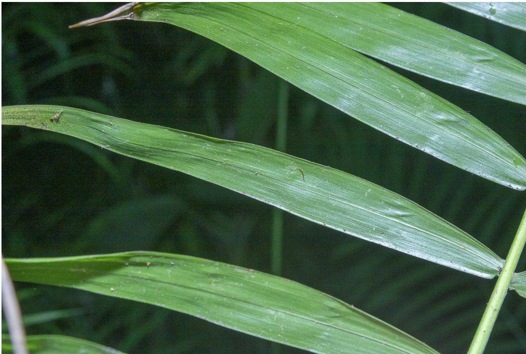
12. Abaxially, the midrib of the pinnae of Chamaedorea delicata is prominently raised and cream-colored to light green. Hodel et al. 4035 .