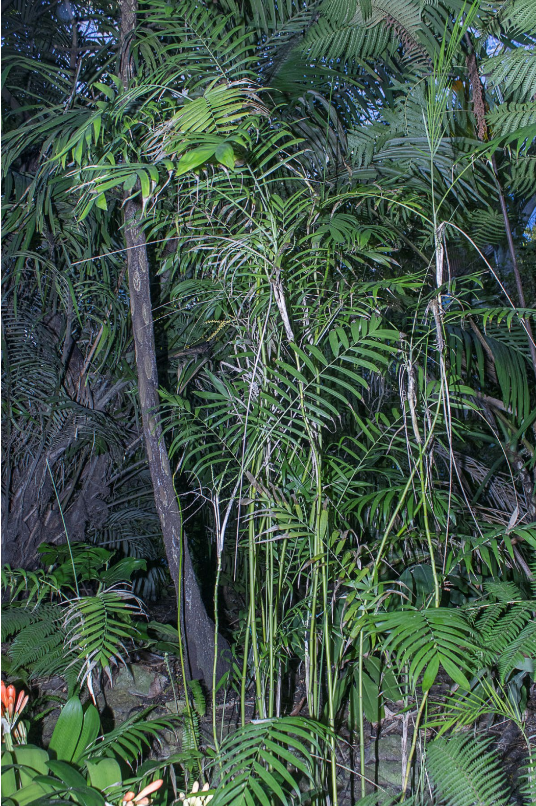
2. Chamaedorea delicata , habit, Hodel et al. 4035. All photos of living plants taken in Fern Canyon, The Zoo, San Diego, California.