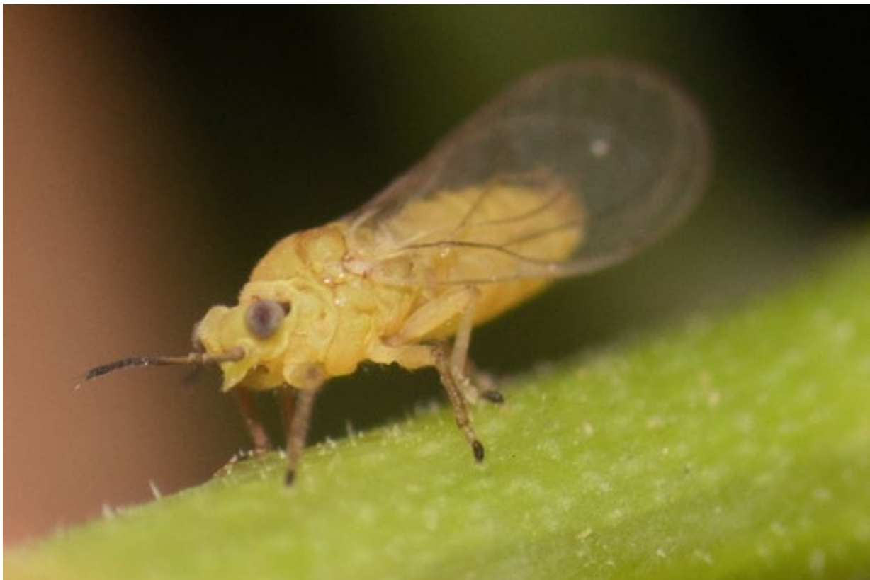
15. Adult pepper tree psyllid ( Calophya schini ). From Rorabaugh (2017).

The pepper tree psyllid belongs to the order Hemiptera, suborder Sternorrhyncha, family Calophyidae. Nymph damage includes formation of the typical galls and perforations on the leaves, petioles, twigs, and shoots of their host ( Figs. 15–16 ). These galls are formed because of the insect's sap suction. When severe, this infestation can cause defoliation and deformation of