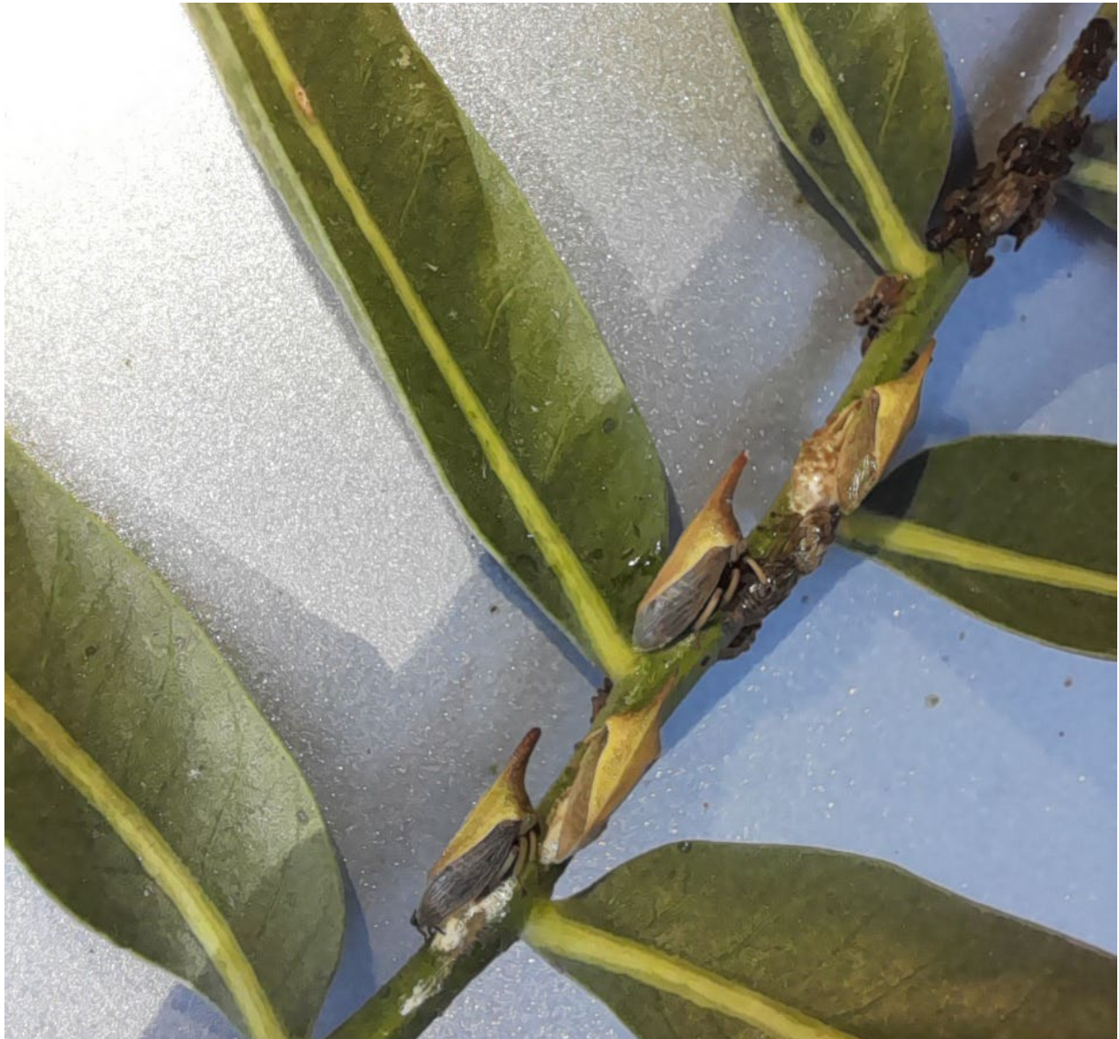
18. Adult thorn buds, which exhibit protective behavior toward nymphs and eggs, are perched on this leaf rachis of a pepper tree.

A member of the order Hemiptera, suborder Auchenorrhyncha, family Membracidae, the thorn bug has been observed on young pepper tree specimens ( Fig. 18 ) and is often associated with ants. A sucking insect that perforates leaves and tender shoots, it causes defoliation, deformed shoots, and necrosis in twigs and young tissue.