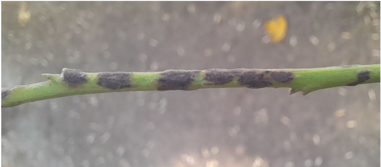
9. Some necrotic spots consistent with sucking insects are observed along young, tender pepper tree branches.