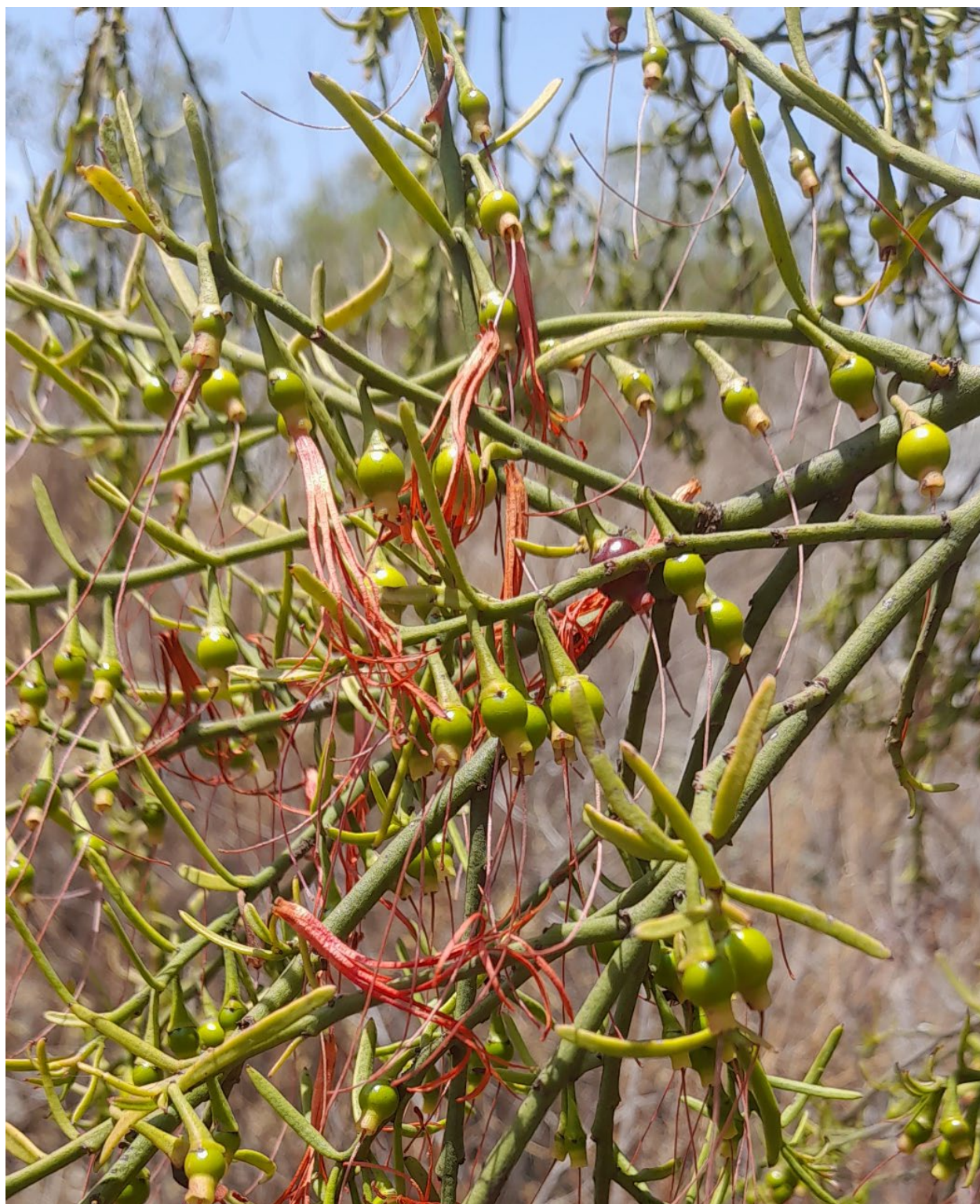
13. The mistletoe jamilla has red flowers and green immature fruits on this pepper tree.