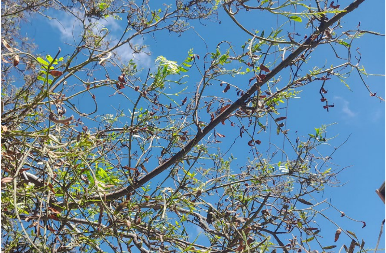
4. View of canopy of an affected pepper tree showing an abundance of dead leaves and small, deformed young sprouts.

According to SENAMHI (2025), Cochabamba received a record high rainfall of 278 mm in January of 2025, the highest since 1949. This excessive precipitation might be a determining factor in the emergence of root and foliar pathogenic fungi (Hodel et al. 2024b).