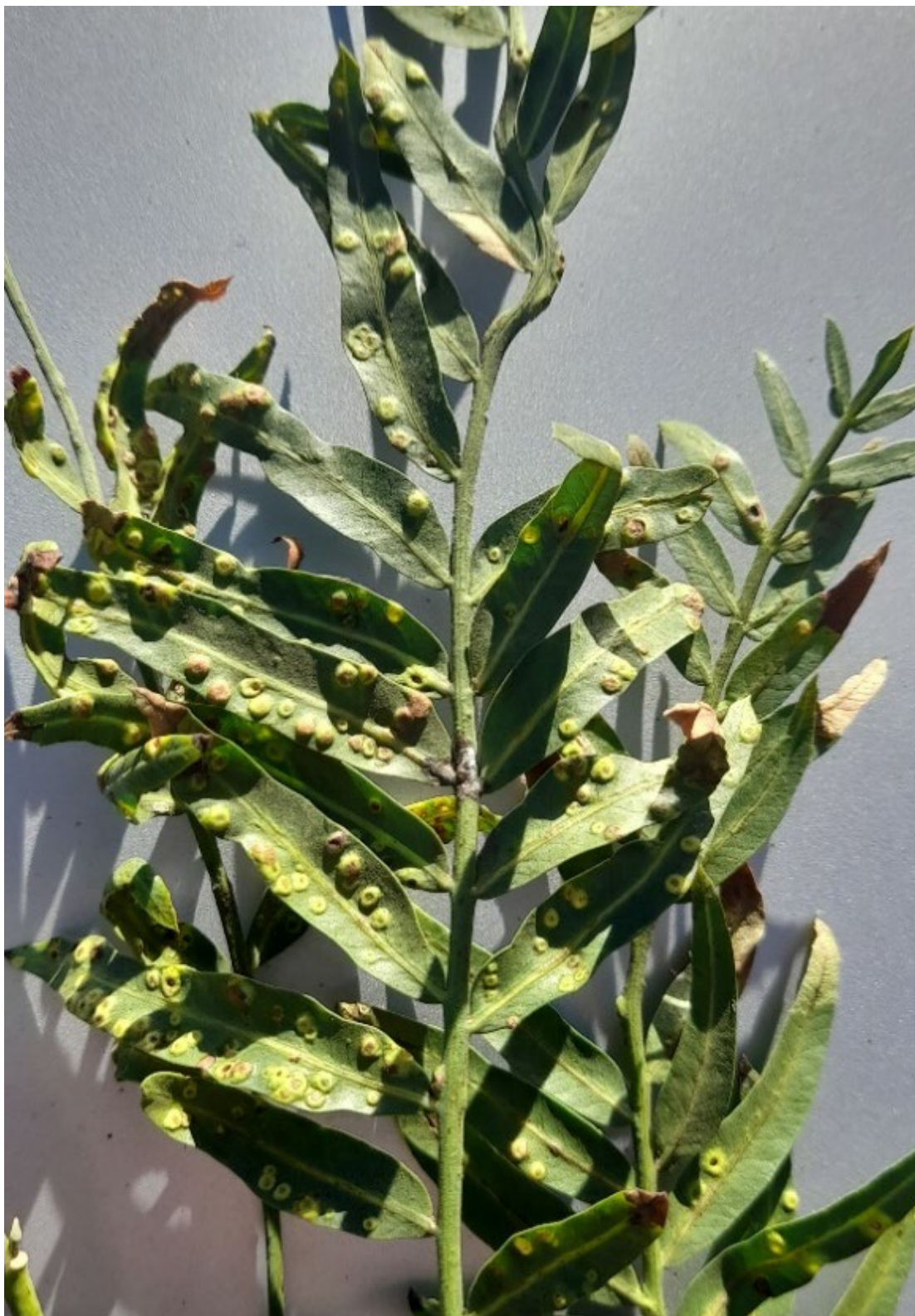
16. The pepper tree psyllid causes galls on leaves and pinnae of the pepper tree.