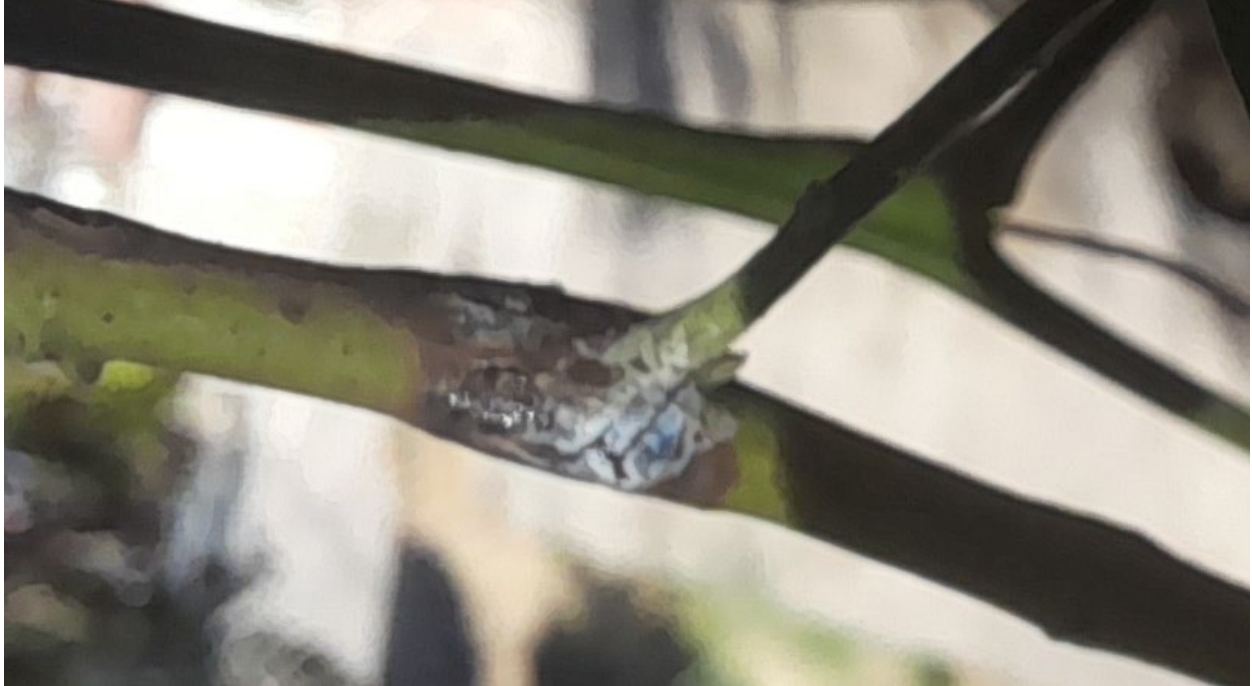
11. An initial fungal infection of a young pepper tree twig occurred at a twig junction. The white material could be wound exudate.