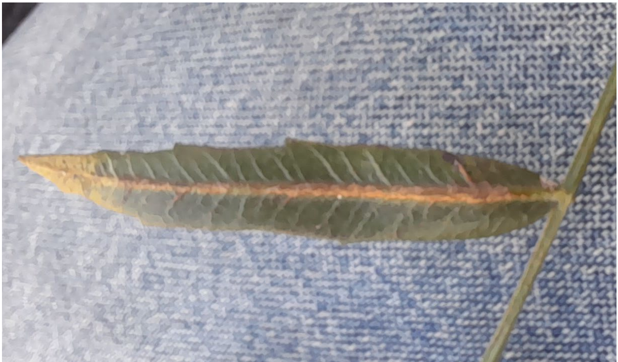
10. Necrosis was also observed on the main vein of pepper tree leaflets.