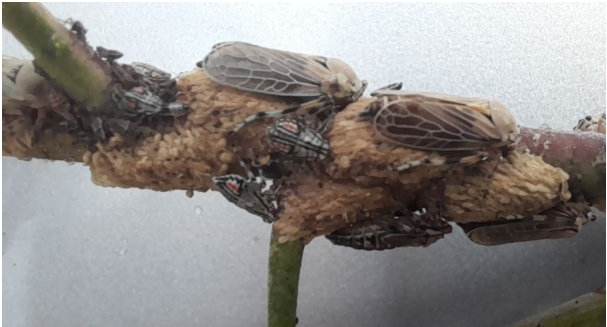
17. The leafhopper Aethalion reticulatum , from eggs to adults are on twigs of a pepper tree.

A member of the order Hemiptera, suborder Auchenorrhyncha, family Aetolionidae, this pest is found abundantly on different tree species, particularly jacaranda ( Jacaranda mimosifolia ) and golden rain ( Tecoma stans ). The pest, found mainly on branches and young, tender shoots ( Fig. 17 ), is a sap sucker and weakens the tree, allowing viruses, bacteria, and fungi to enter through its feeding wounds.