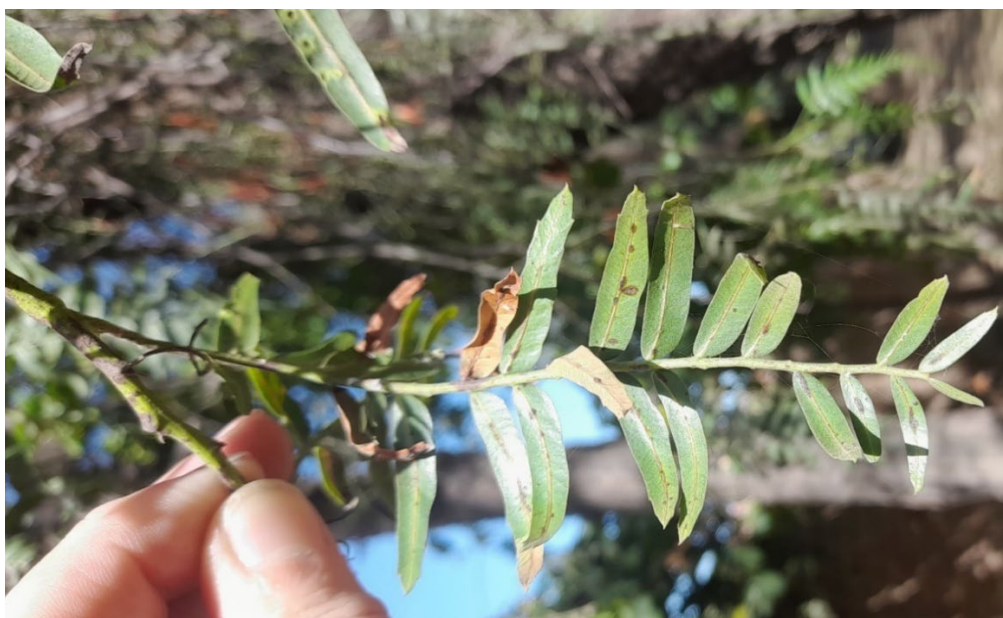
7. Affected pepper tree leaves show necrotic spots on leaflets, rachis, and young, tender twigs.