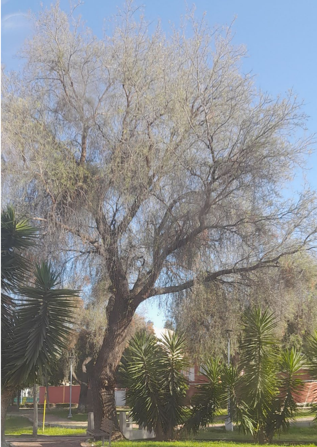
2. A pepper tree with noticeable foliage damage, making the canopy appear diminished, sparse, and weak.