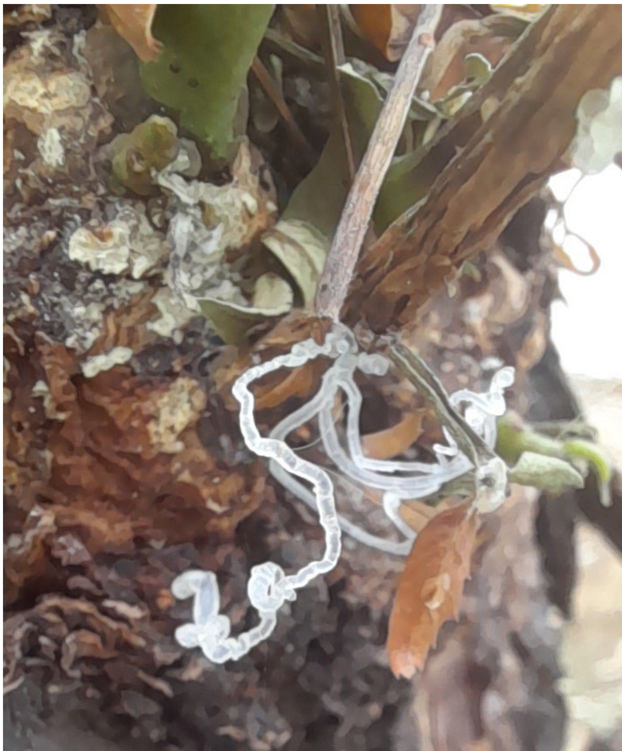
8. Clear-colored resin exudes from affected pepper tree shoots and leaves.