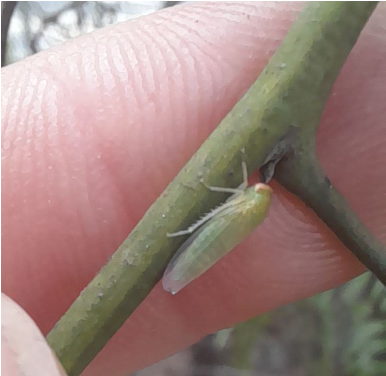
19. This green leafhopper Empoasca cf. sativae is on a young pepper tree twig.

A member of the order Hemiptera, suborder Auchenorrhyncha, family Cicadellidae, the green leafhopper ( Fig. 19 ) is also mentioned as a potential pest and responsible for canopy thinning of Schinus molle in California (Hodel et al. 2024a). This sucking insect perforates leaf tissue, petioles, and tender shoots, possibly causing defoliation, deformed shoots, and necrosis in twigs and young tissue.