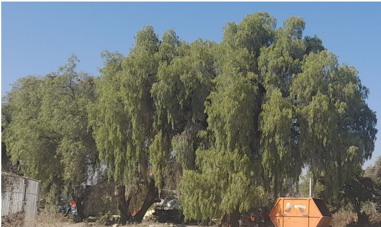
1. Healthy and vigorous examples of pepper trees, the iconic tree of the Inter-Andean Valleys of Bolivia, showing healthy, dense foliage throughout the trees canopies.

Considering the presence of biotic factors, such as insects and fungi, as well as abiotic factors, such as humidity, precipitation, and temperature, it is highly likely that any one of these factors will not act alone, but rather two or more will act in combination. Climate change and its associated effects, such as prolonged consecutive years of drought followed by years of abundant rainfall, could not only stress trees and cause canopy thinning on their own, but could also initiate