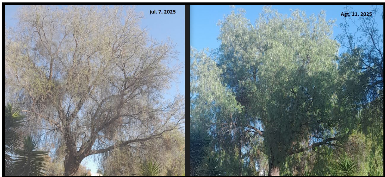
Figure 21. Comparison of the physiological status of pepper tree specimens in July, 2025 (left) and August, 2025 (right).

In a final observation made in mid-August of 2025, a substantial improvement was noted in many of the pepper trees, which was attributable to the presence of winter. Although not particularly cold in this geographical area, with average temperatures of 14.7 C and average minimum temperatures of 1 C, along with low relative humidity and virtually no precipitation, these conditions are not conducive to pathogenic fungal development and can reduce populations of harmful insects, allowing the pepper trees to recover on their own.