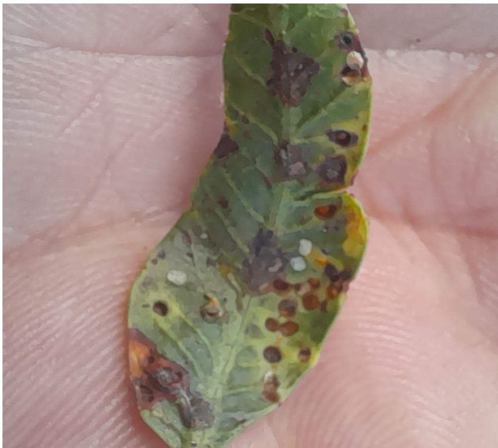
6. Pinnae damage on pepper trees includes necrotic spots, galls, and oozing.