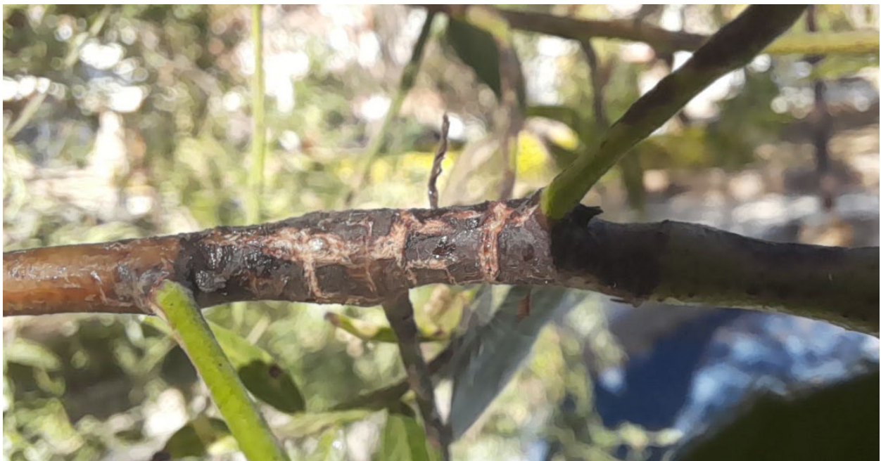
12. An advanced fungal infection of a pepper tree twig shows darkened, "platy" tissue.