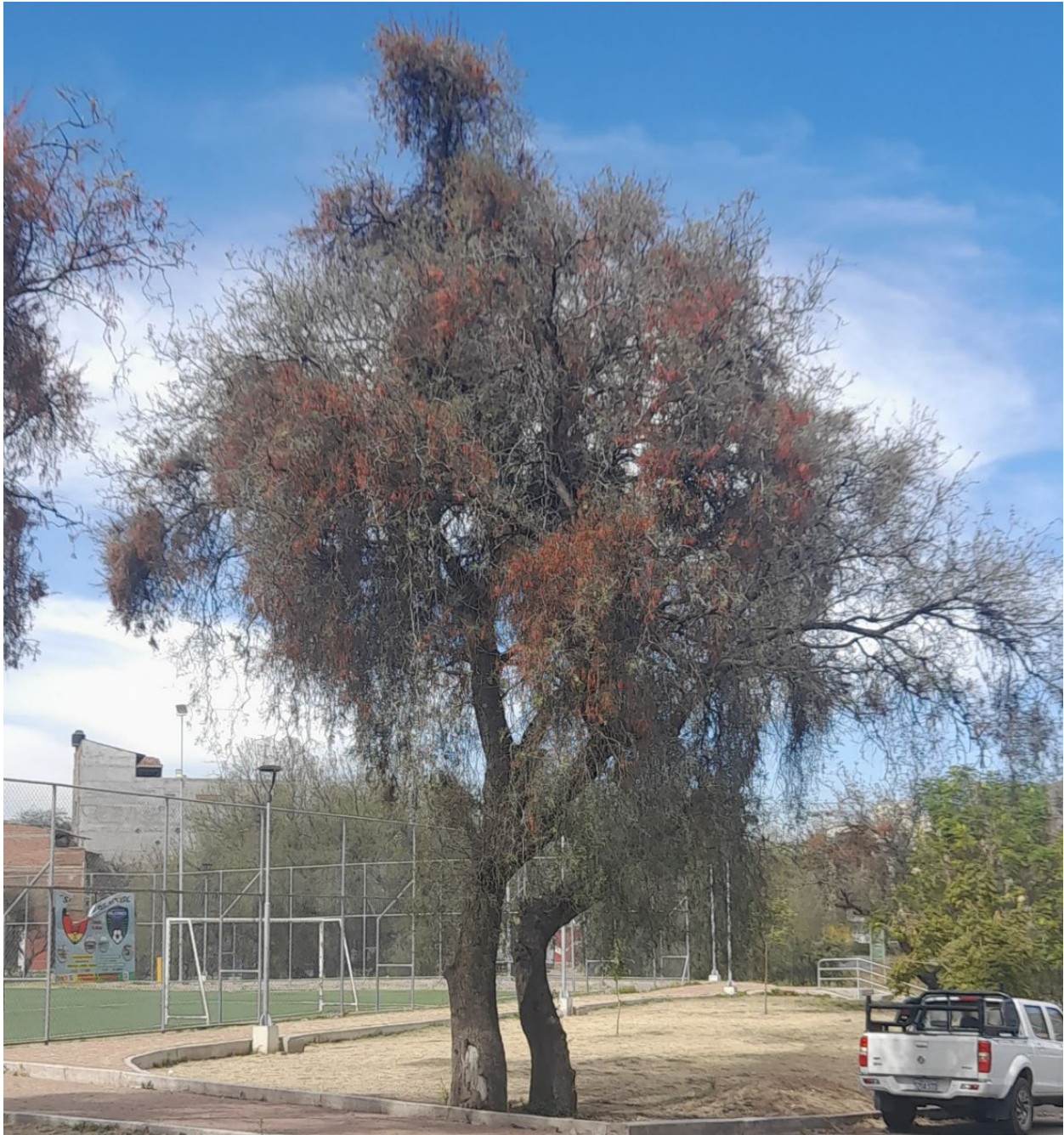
14. This pepper tree is heavily infested with the mistletoe jamillo . Note the reddish color from the jamillo flowers.