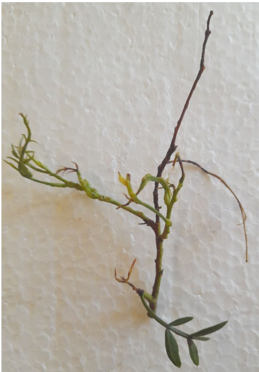
5. Affected pepper trees show malformed sprouts and dieback.