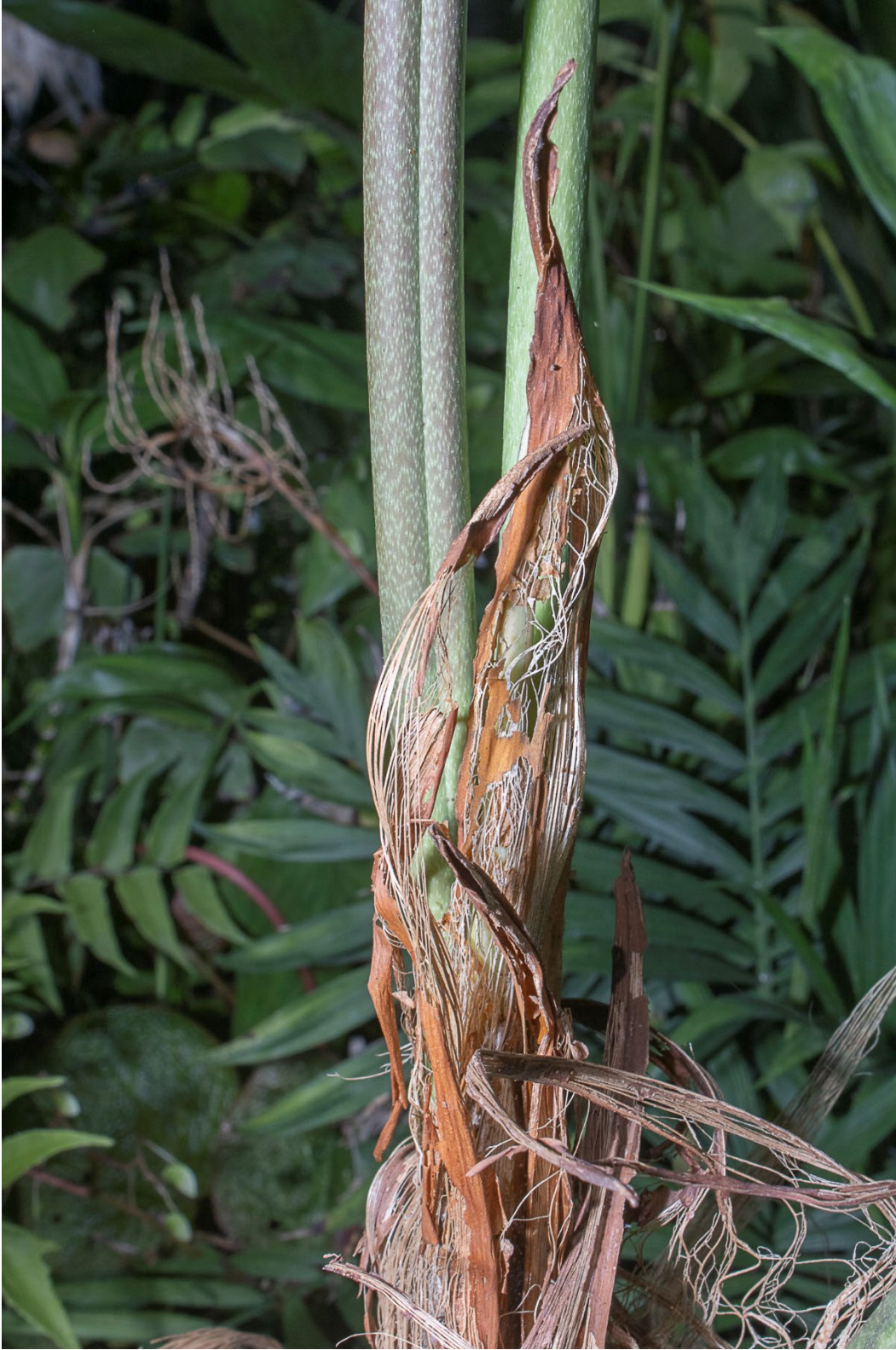
9. Cataphylls of Anthurium viridifructum quickly turn brown and persist, becoming marcescent.