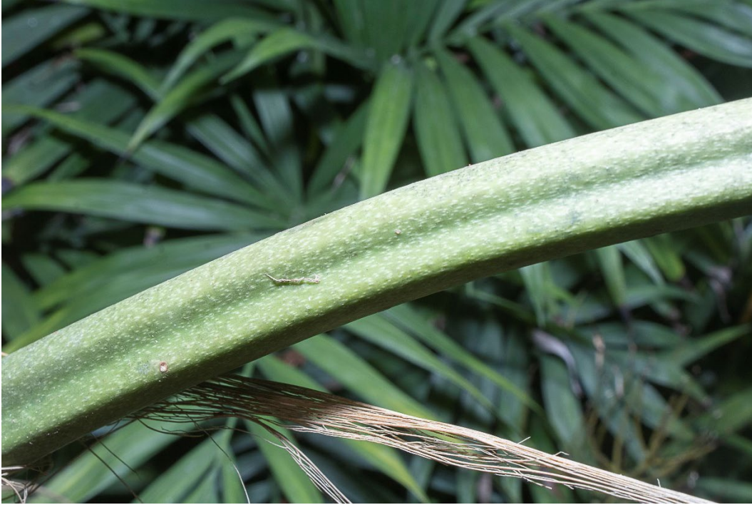
11. Petioles of Anthurium viridifructum are prominently sulcate adaxially, glabrous, and densely and minutely white-spotted.