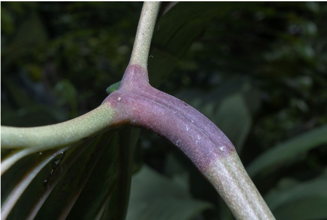
12. The geniculum of Anthurium viridifructum is grooved adaxially and pinkish to burgundy colored.