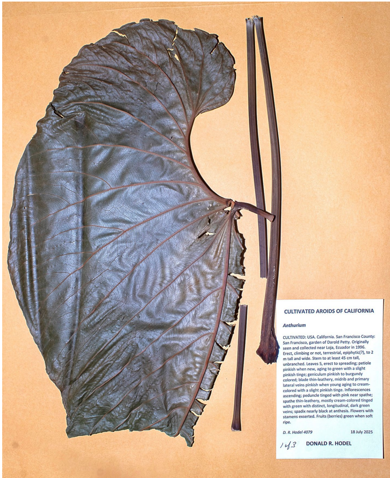
2. Sheet one of three sheets of the holotype of Anthurium viridifructum , Hodel 4079, prior to being consolidated into two sheets at MO. This sheet has about one-half of the leaf blade and the petiole.