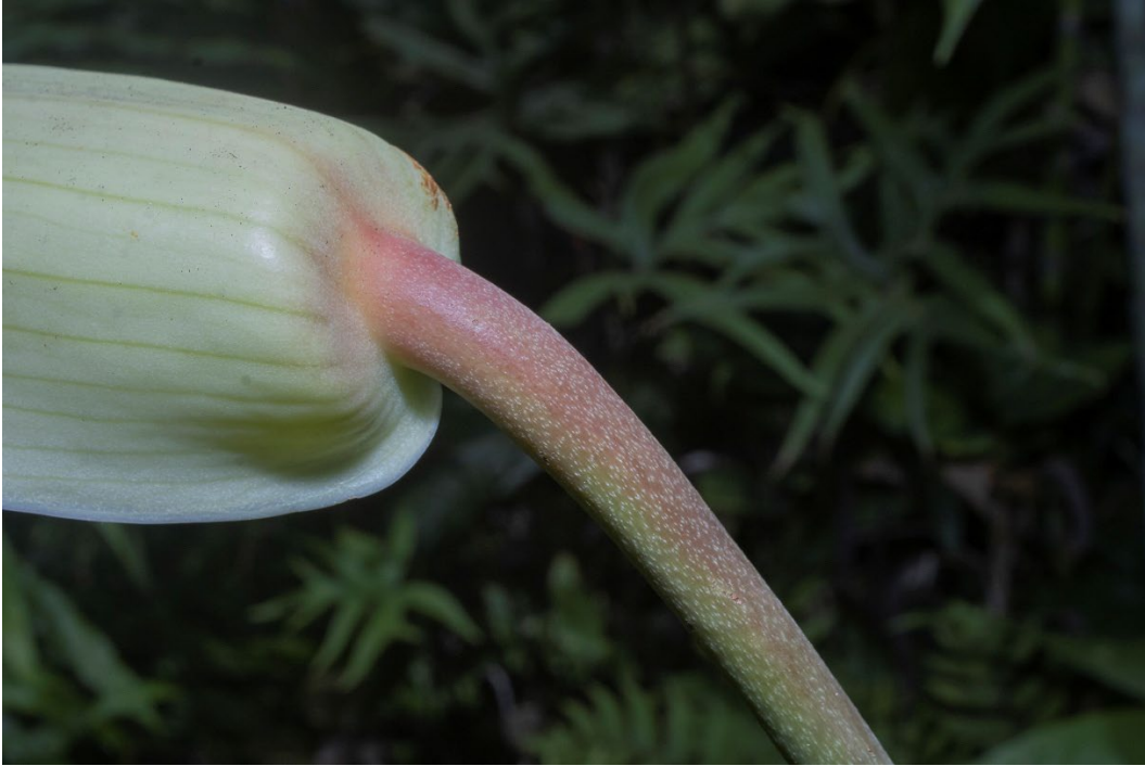
19. The peduncle of Anthurium viridifructum is tinged with pink at spathe.