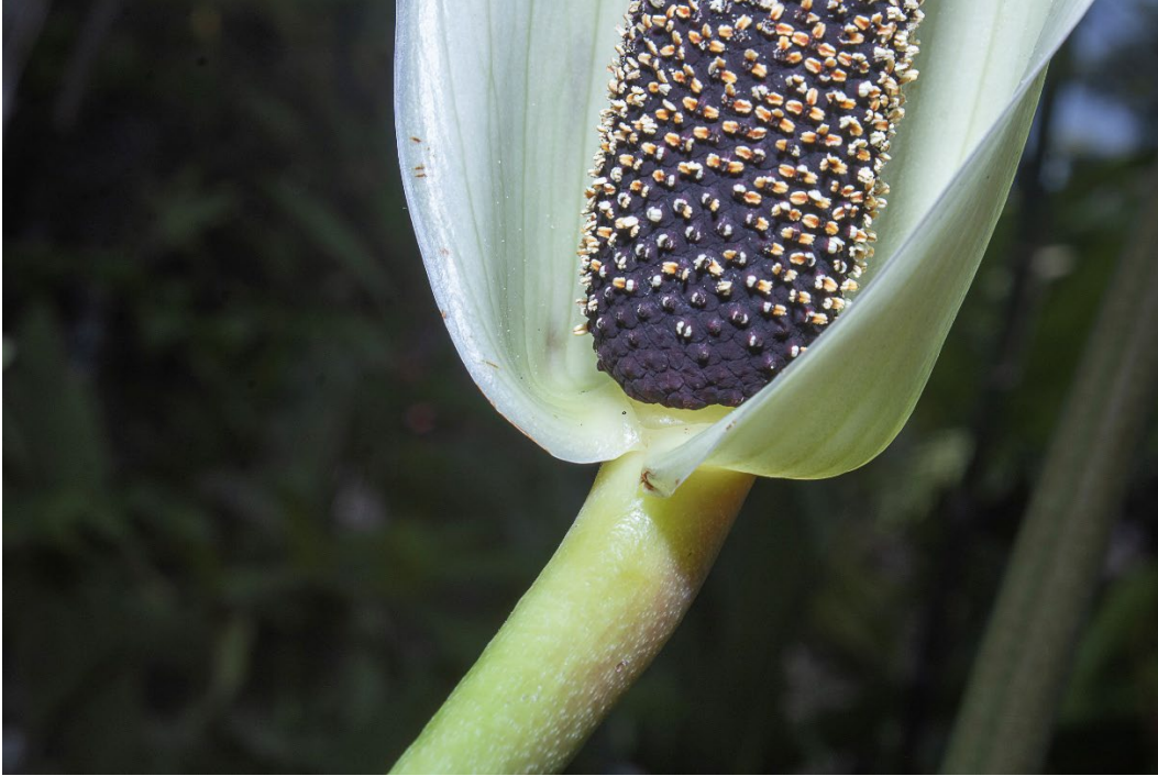
21. The spathe of Anthurium viridifructum nearly completely encircles the spadix at its base.