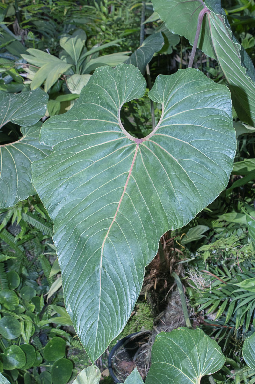
13. Leaf blades of Anthurium viridifructum ovate-sagittate, about as long as the petioles, gradually acuminate at apex, prominently lobed at base, subcoriaceous, and green adaxially.