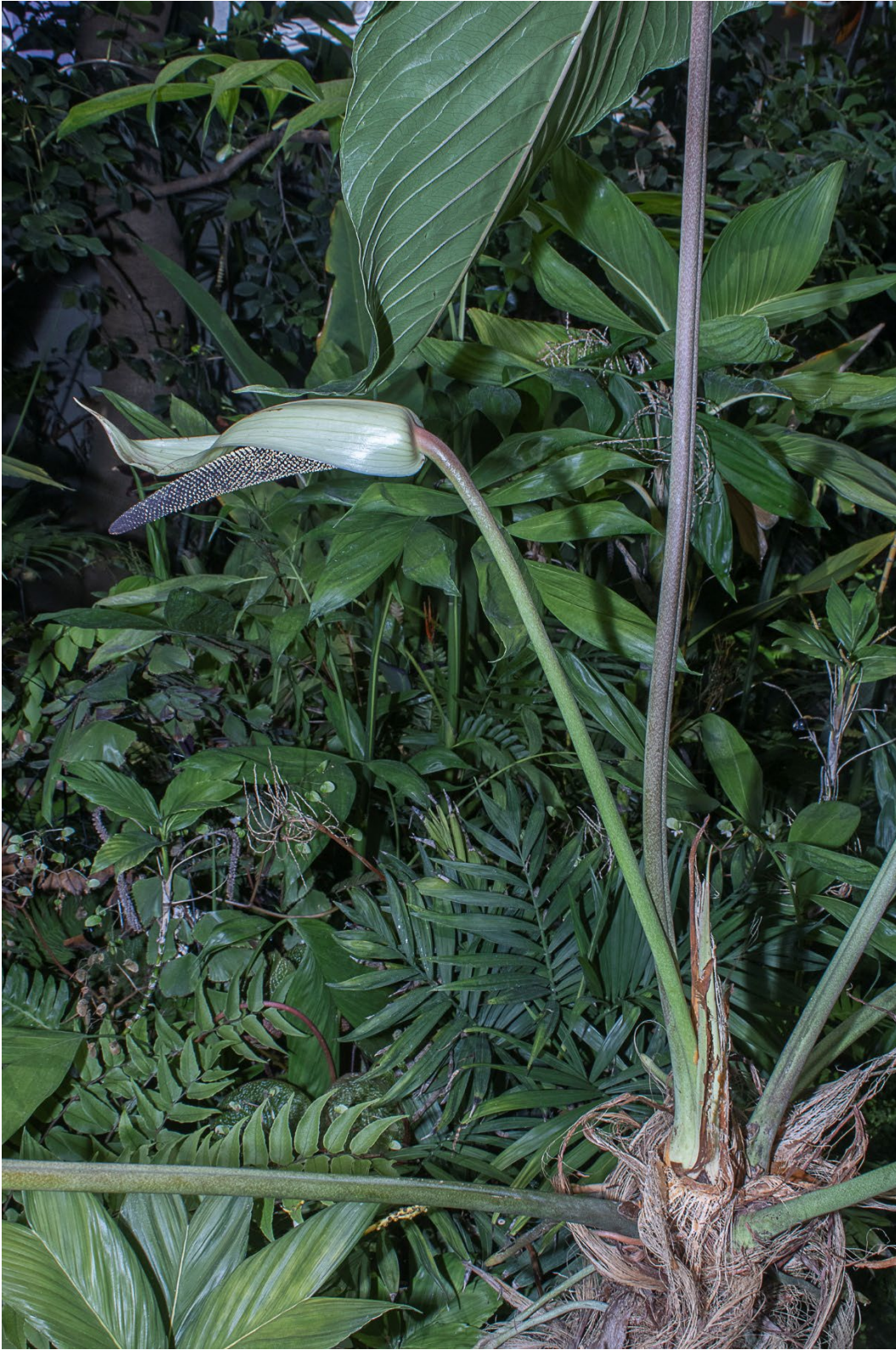
17. The inflorescence of Anthurium viridifructum is erect to ascending. Note the peduncle tinged with pink just proximal of spathe.