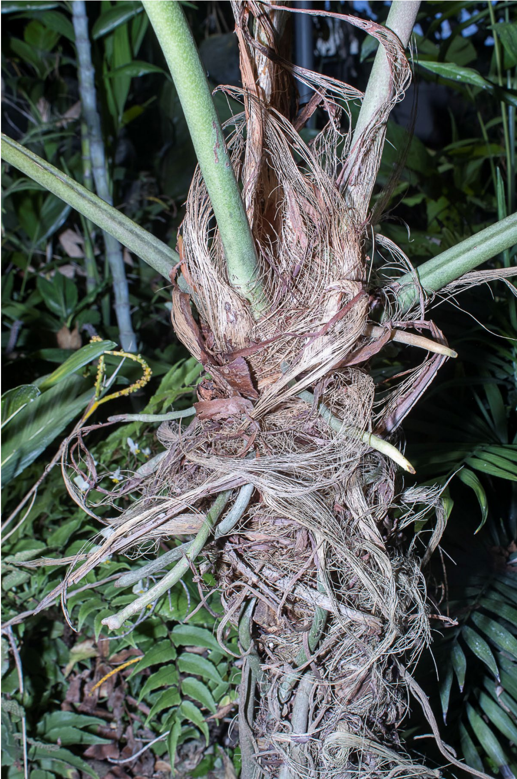
5. The unbranched, erect, stem of Anthurium viridifructum is typically enveloped in persistent, fibrous cataphylls and adventitious aerial roots.