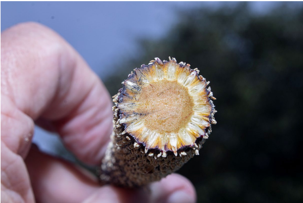
25. Flowers of Anthurium viridifructum are densely packed and angled from mutual pressure.