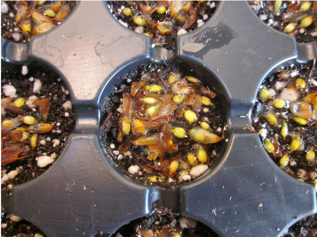
27. Freshly planted seeds of Anthurium viridifractum have a clear, sticky coating that was not water soluble and was impossible to wash off. From the type plant.

but the spadix did not break down and die like it typically would. It seemed to take many months for the fruits (berries) to mature. The spadix looked the same but increased a lot in overall size. The green soft-ripe fruits quickly “erupted” from the surface of the spadix over just a few days, and then the whole spadix broke down into a slimy mess. The seeds had a clear, sticky coating that was not water soluble and was impossible to wash off. He sowed the seeds in his greenhouse, in which he maintained temperatures of 10 to 24 C, and got good germination ( Fig. 27 ).