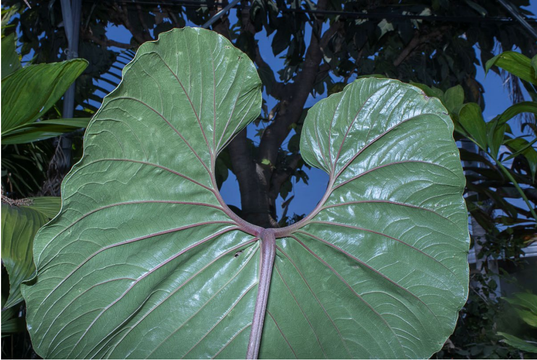
15. The leaf blade sinus of Anthurium viridifructum , formed from the posterior lobes, is hippocrepiform and, in this case, open. Note the color and pattern of the veins.