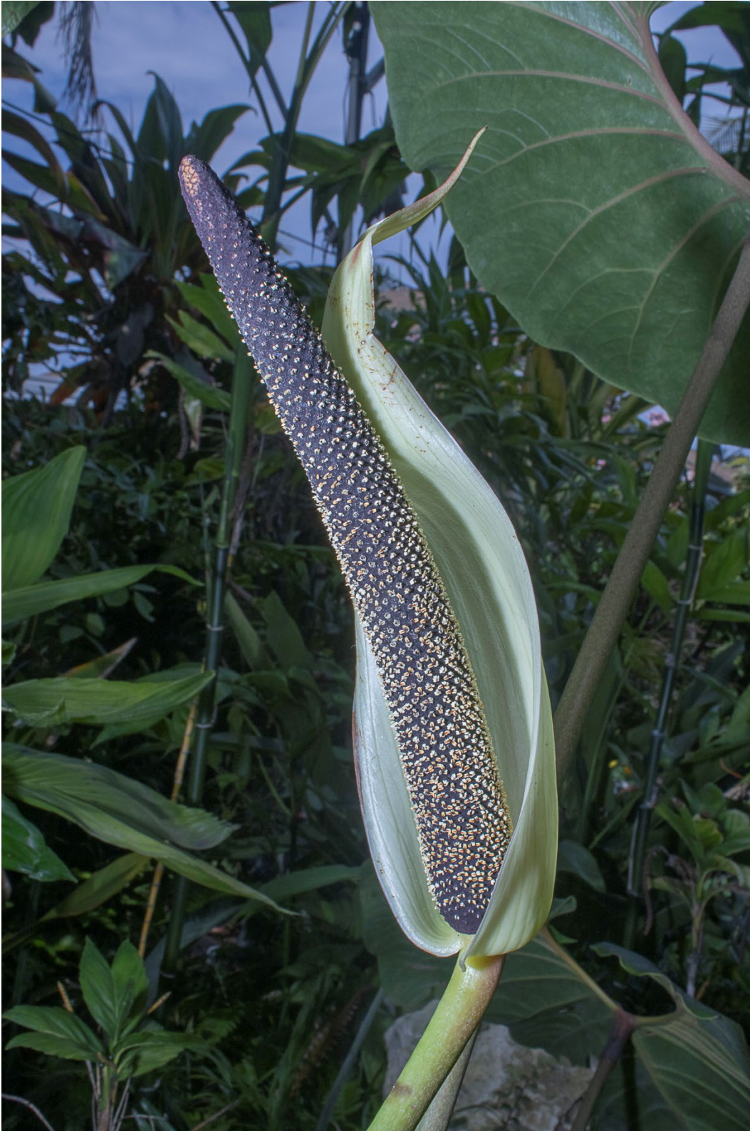
23. The spadix of Anthurium viridifructum is blackish purple and briefly and abruptly tapers to an acute-rounded apex.