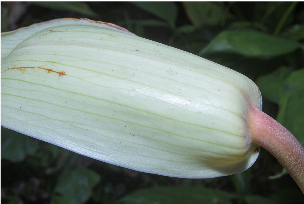
22. Abaxially the spathe of Anthurium viridifructum is thin-leathery, mostly cream-colored tinged with green and with distinct, longitudinal, dark green veins.