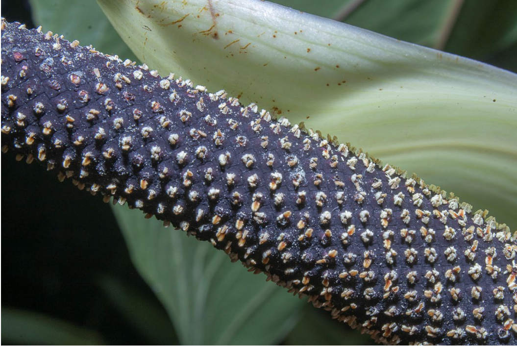
24. Flowers of Anthurium viridifructum are spirally arranged in the purplish black spadix.