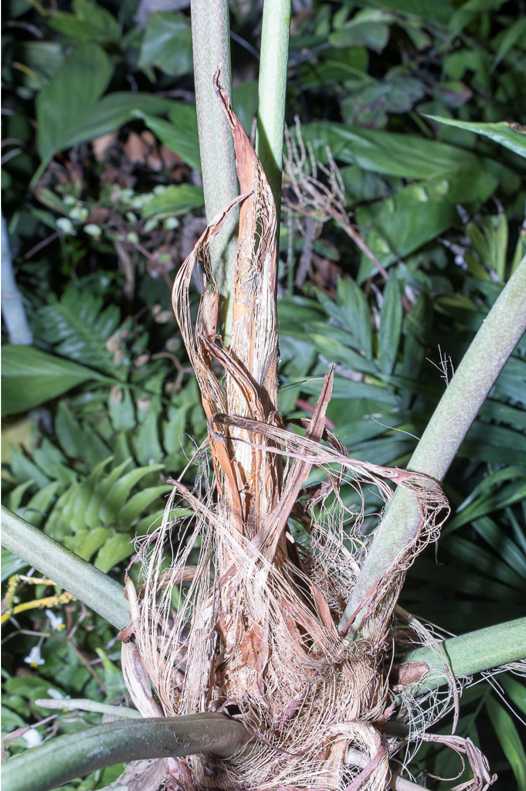
10. Cataphylls of Anthurium viridifructum disintegrate into a mass of indistinguishable, closely spaced, fine, light brown-drying fibers.