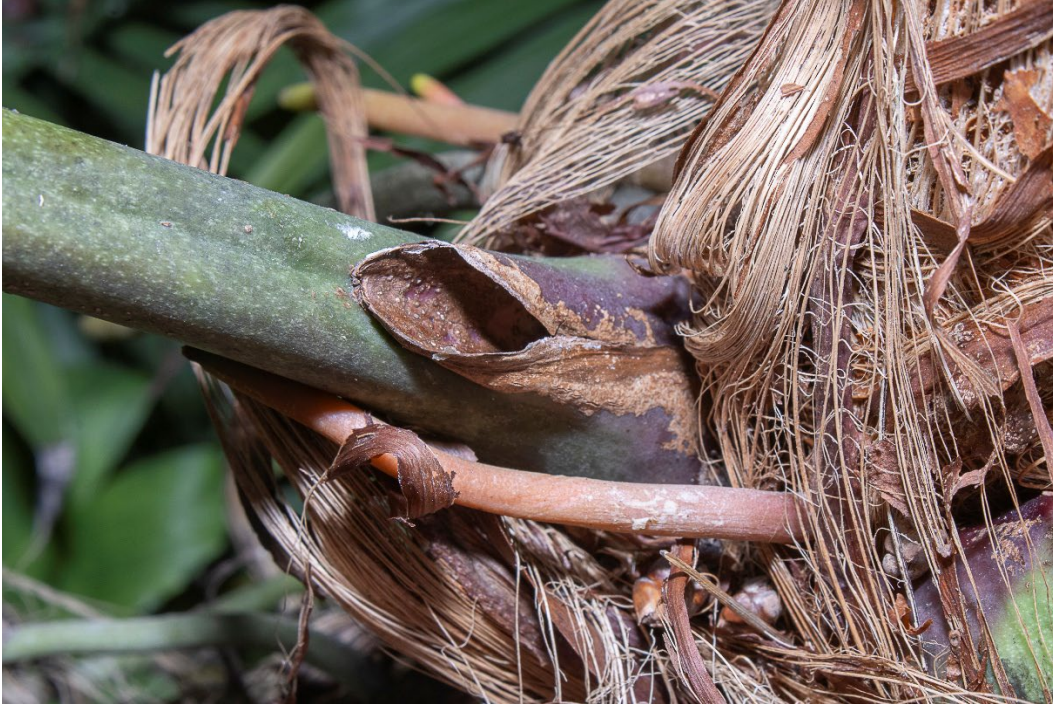
6. Aerial roots of Anthurium viridifructum are pink to brown when young.