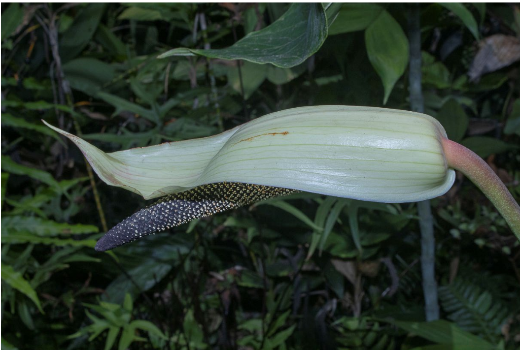
20. The spathe of Anthurium viridifructum is narrowly ovate-lanceolate and slightly exceeding and hooded over the spadix at anthesis.