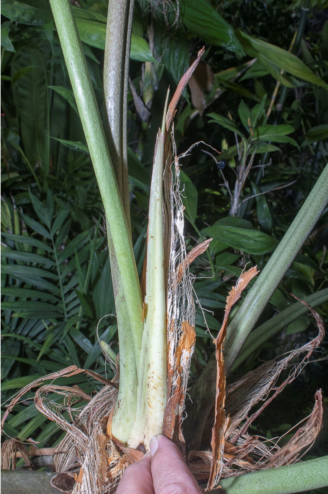
8. Cataphylls of Anthurium viridifructum are briefly greenish white when young.