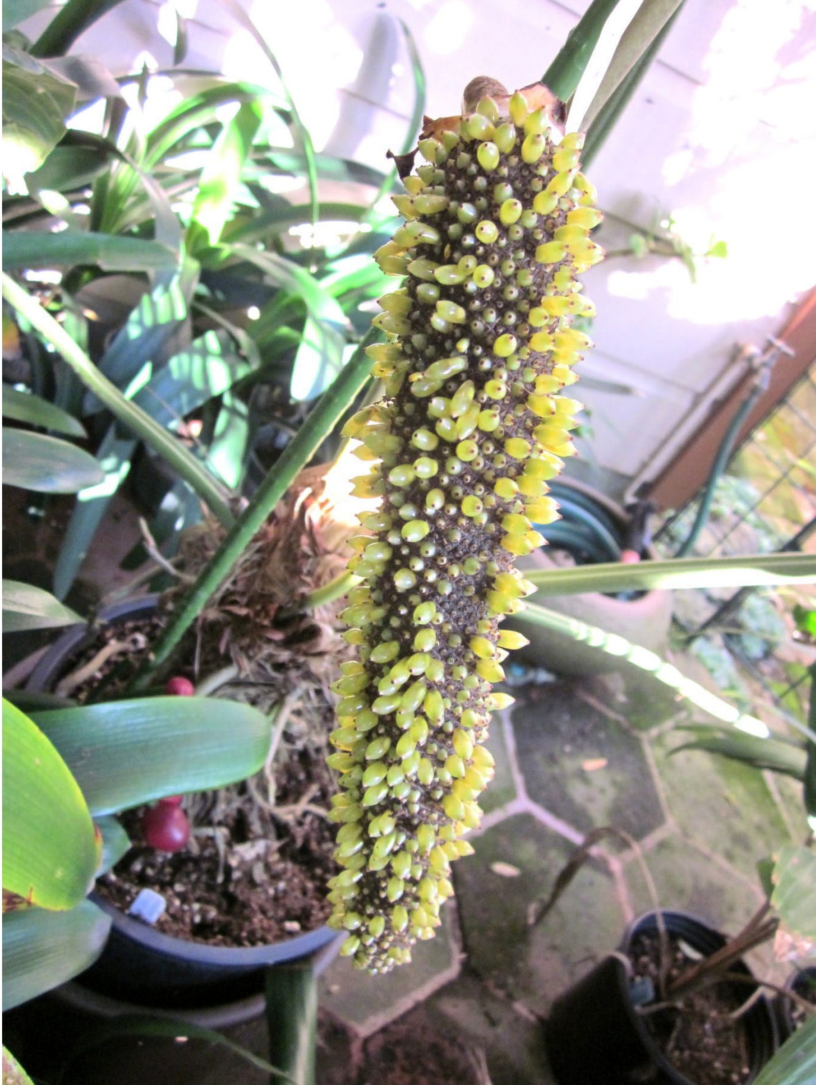
26. Mature, soft-ripe berries of Anthurium viridifructum are green, hence the specific epithet. Type plant in the garden of Darold Petty, San Francisco, California.