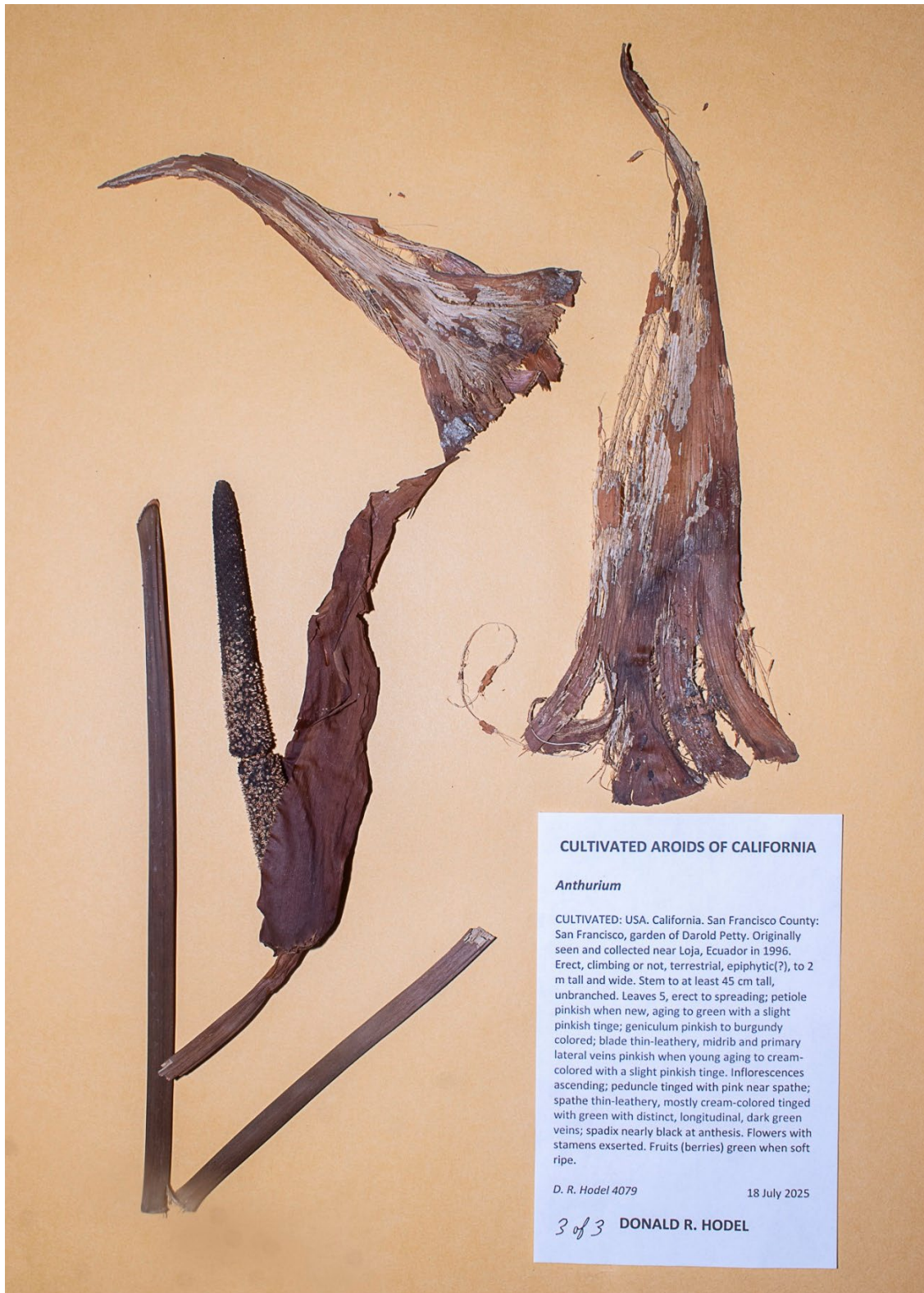
4. Sheet three of three sheets of the holotype of Anthurium viridifractum , Hodel 4079, prior to being consolidated into two sheets at MO. This sheet has cataphylls and an inflorescence.