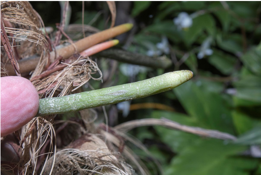
7. Aerial roots of Anthurium viridifructum age to green.