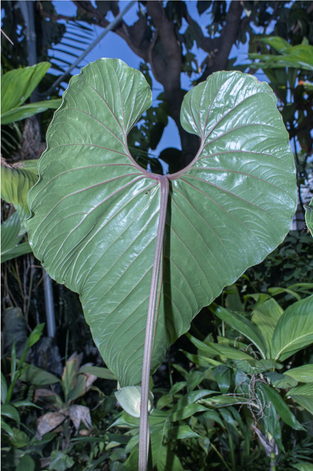
14. Leaf blades of Anthurium viridifructum are paler and glossy abaxially.