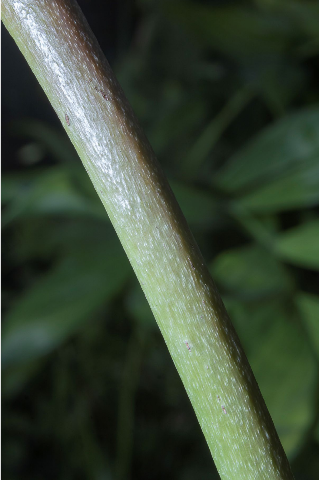
18. The peduncle of Anthurium viridifructum is round and green with minute white, elongated spots.