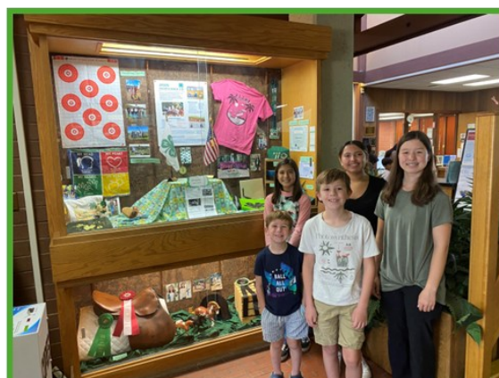
Top left to right: Lone Star/Fowler, McKinley, Reedley, Renegades