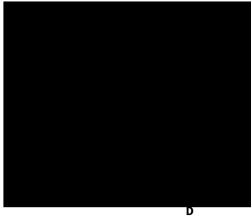
Figure 4. Bark grafting. A–C. Scions cut for bark grafting. D. Scions in proper position (note flathead nail).

Once the scions begin to grow well, remove all but one scion per branch. Early on, however, prune the scions that will be removed to reduce their vigor but do not prune the scion that will be kept. The one scion you keep will eventually become a main scaffold branch. Any nurse branches should also be removed after all the scions are growing well.