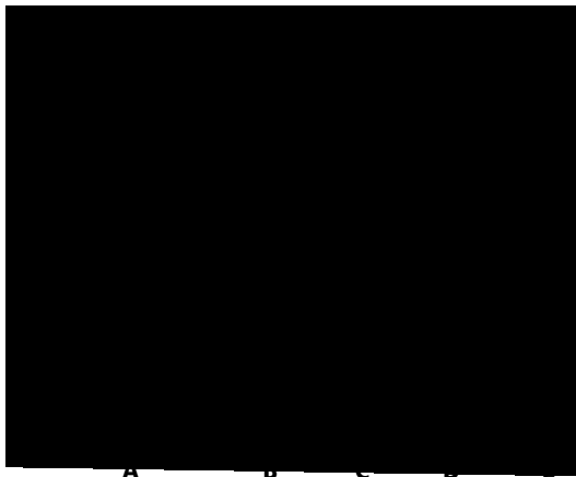
Figure 3. Whip grafting. A. Rootstock stem cut for grafting. B. Tongue cut into rootstock to hold scion in place. C. Scion cut for grafting, with tongue. D. Scion and rootstock properly aligned. E. Graft wrapped with budding rubber.

To make a whip graft (fig. 3), select as a scion hard and mature green wood. First make a long, sloping cut about 1 to 2½ inches (2.5 to 6.2 cm) long on the rootstock (fig. 3A). Make a matching cut on the scion. Cut a “tongue” on both the scion and rootstock by slicing downward into the wood (figs. 3B–3C). The tongues should allow the scion and rootstock to lock together. Fit the scion to the rootstock (fig. 3D) and secure with budding rubber (fig. 3E). Apply grafting wax to seal the union. To prevent sunburn, new whip grafts should be protected from the sun until they heal. After the scion has begun to grow, remove any growth from the rootstock. If necessary, support new shoots by staking.