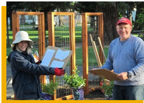
Master Gardeners show their plans to plant roses

Potential applicants are encouraged to explore current workshops and special events on our website.