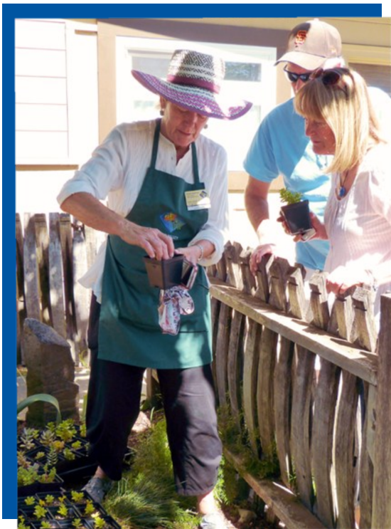
A succulent plant is potted up for an attendee at a Master Gardener event

The UC Master Gardener Program of Napa County is a volunteer organization associated with the University of California Agriculture and Natural Resources. (ANR) Master Gardeners are trained, unpaid teaching staff and certified to extend practical horticultural information to home gardeners.