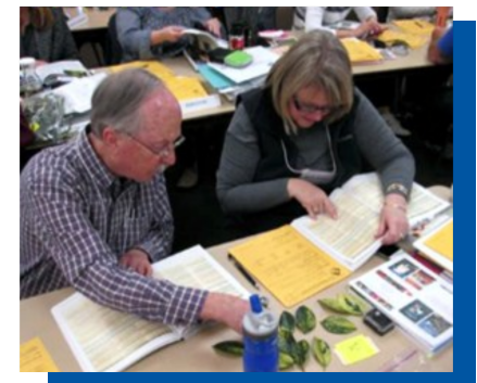
Master Gardener trainees engaged in plant problem diagnosis

Master Gardeners are adults of all ages and all walks of life who reside in Napa County. They have a desire to learn with the purpose of helping home gardeners become successful. Bilingual applicants are encouraged to apply.