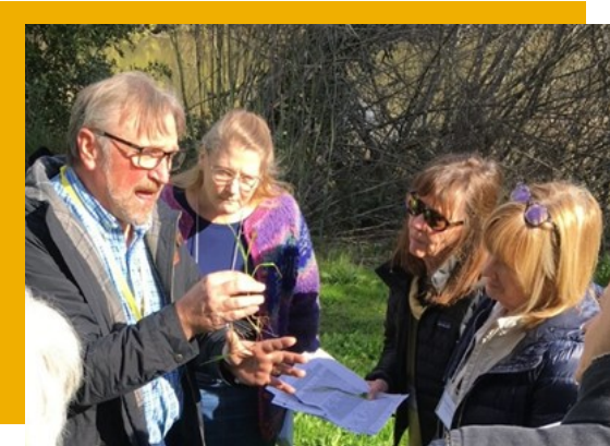
Master Gardener trainees learn weed identification

There is a charge of $300 for materials, instruction and supplies. Partial scholarships are available upon request.