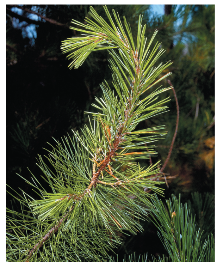
Figure 2. Infected Monterey pine shoot. Discolored area of shoot is the lesion resulting from infection by the pathogen. Note the wilting of the tip of this shoot.