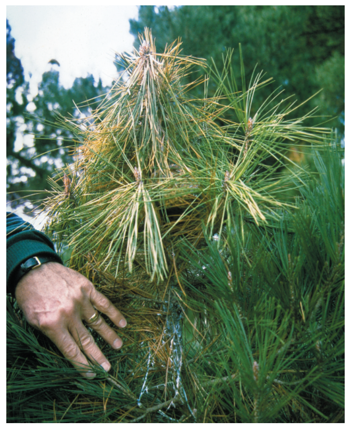
Figure 3. Resin exudation from infected Monterey pine branch tip. Needles distal to the point of infection wilt and die.