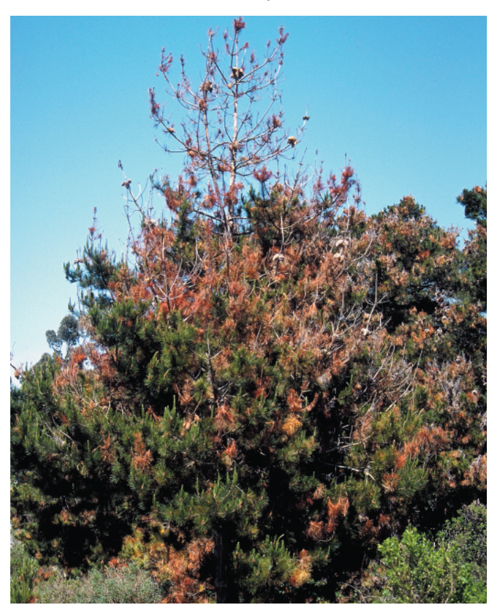
Figure 1. Multiple branch tip infections and dead tree top resulting from pitch canker in Monterey pine.

ANR Publication 8025 FAQ ABOUT PITCH CANKER 2