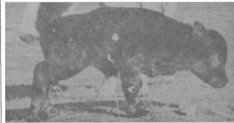
An "Acorn Calf" with the characteristic short legs and the arched back, resulting from multiple nutritional deficiencies in the dam.

in calves from heifers in their first pregnancy, but may occur in offspring of cows of any age.