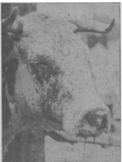
A cow in the area of the Merced Irrigation District affected with skin blisters on the muzzle and about the eye as a result of eating photosensitizing plants.

When feed is very short and scarce, less palatable, and even poisonous, plants will be eaten that would have been left undisturbed under better feed conditions. Loco weed is somewhat in this class, but when animals get the habit of eating it they will search it out on account of having acquired a craving for the effect it seems to produce.