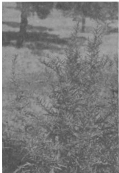
Durango root ( Datisca glomerata ), a new toxic species demonstrated to be poisonous to cattle in Mariposa County in 1944. When dry forage is depleted, its green leaves and stems are attractive to the grazing animals.

There are hundreds of thousands of plant species. Animal and plant food relations are flexible depending on degree of stocking and variety of plants present.