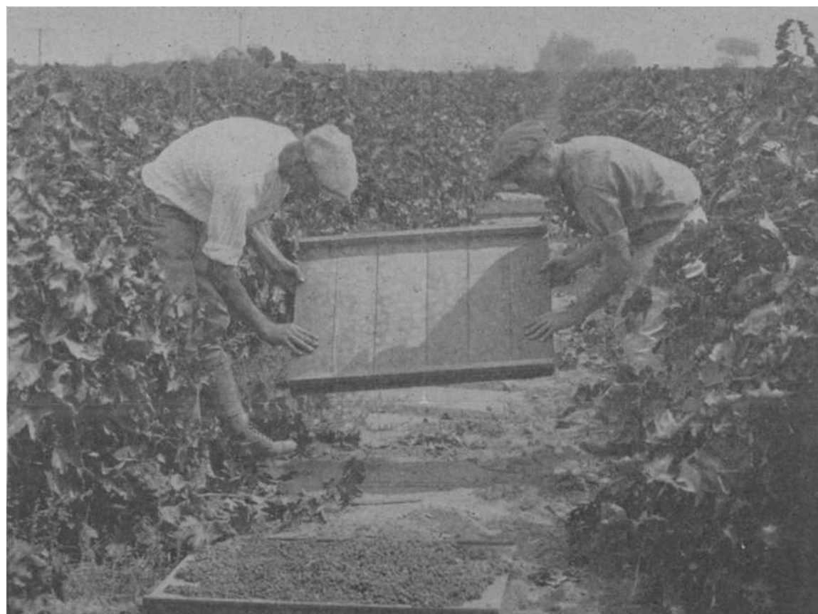
Turning grapes on wood trays. An empty tray is placed upside down over a full one, then both are "flipped" over as illustrated.

well-ripened fruit, and (2) The more favorable drying conditions early in the season.