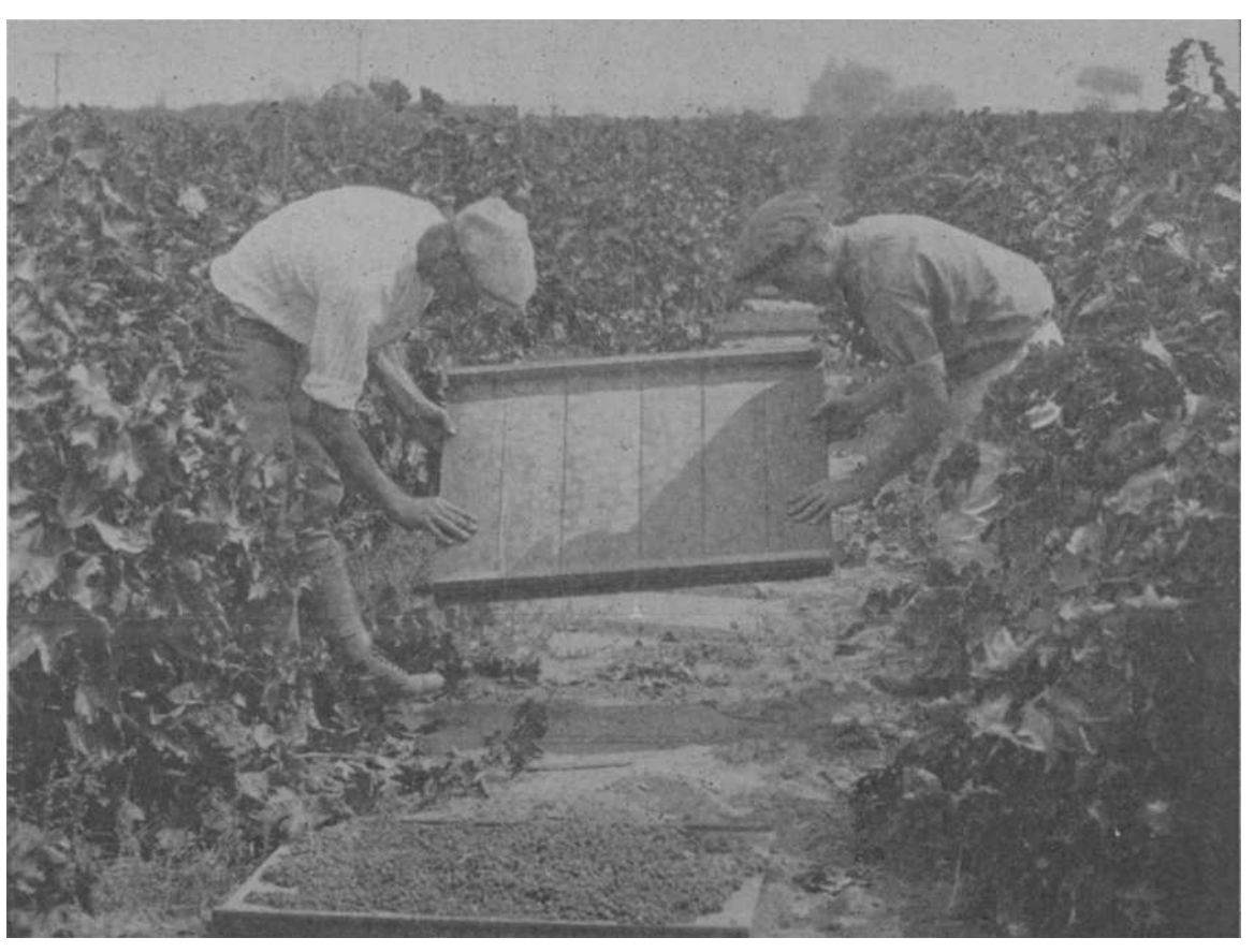
Turning grapes on wood trays. An empty tray is placed upside down over a full one, then both are "flipped" over

favorable drying conditions early in the season.