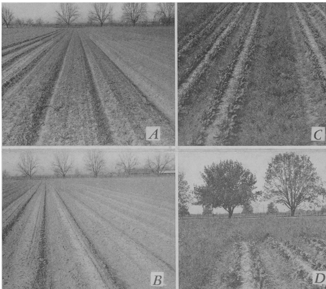
Control of weeds in sugar beets by the use of pre-emergence sprays. A. Normal weed growth at the time of spraying. B. Adjacent soil after spraying. Beet seedlings appeared in these plots within five to six days after spraying. C. The strip of weedy growth in the middle was unsprayed while the soil on either side was sprayed. D. The plot in the right foreground was sprayed, the surrounding soil was not sprayed. Plots C and D were neither cultivated nor irrigated. The photographs of these two plots were taken about 45 days after spraying.

Decorticated sugar beet seed was drilled in at three different depths: 1 inch, 1½ inches, and 2 inches. A